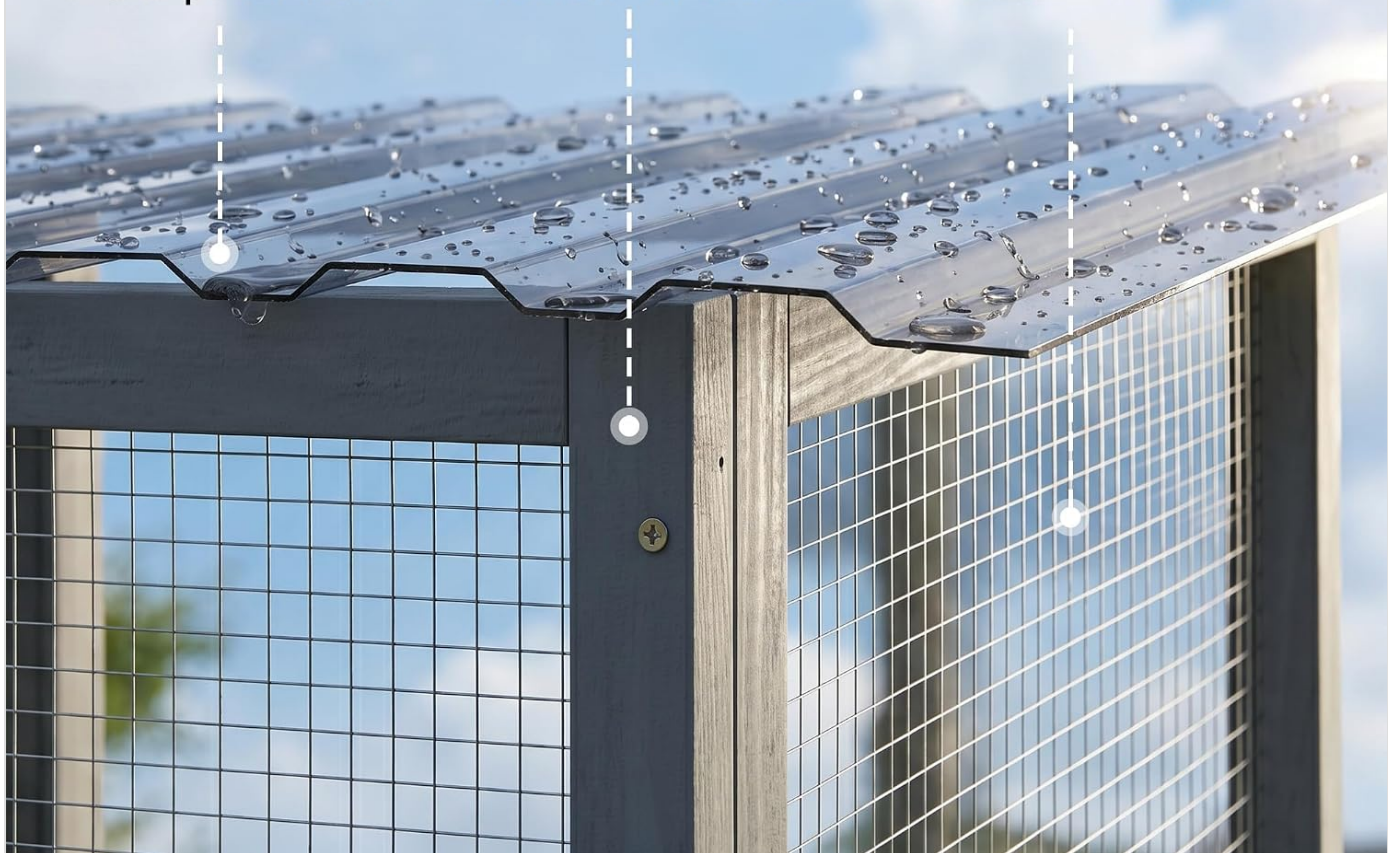
Figure 6: The waterproof roof provides protection from rain and other elements.