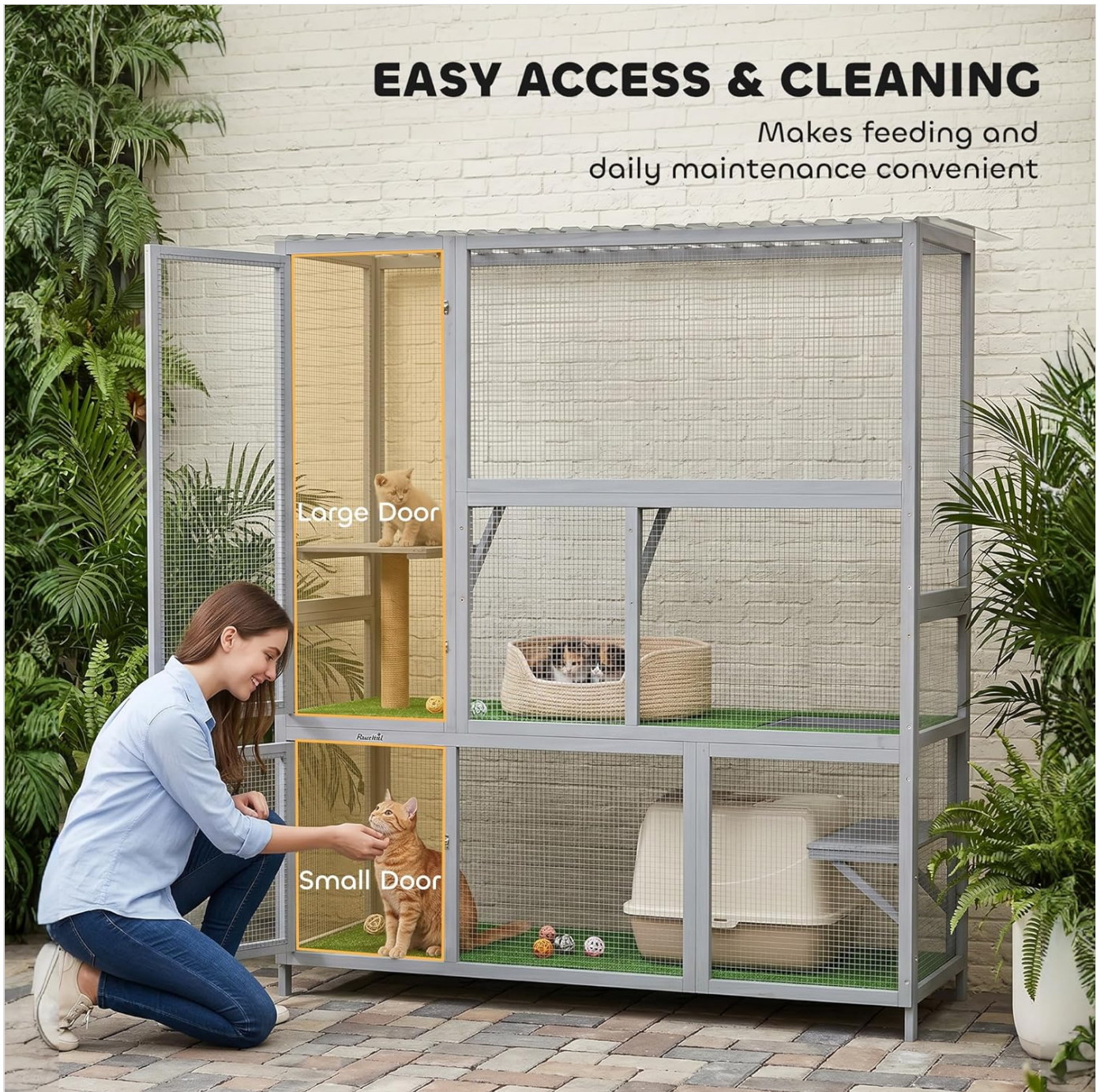
Figure 4: The catio features a large door and a smaller access door for convenient interaction and cleaning.

Makes feeding and daily maintenance convenient