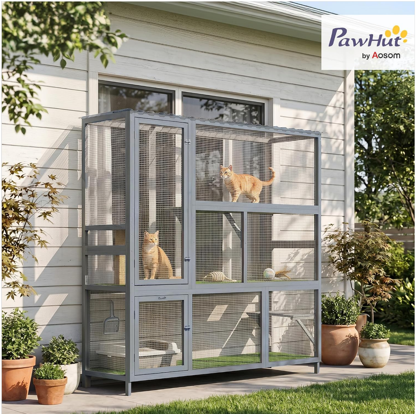
Figure 1: Fully assembled PawHut Catio, showing its placement against an exterior wall.