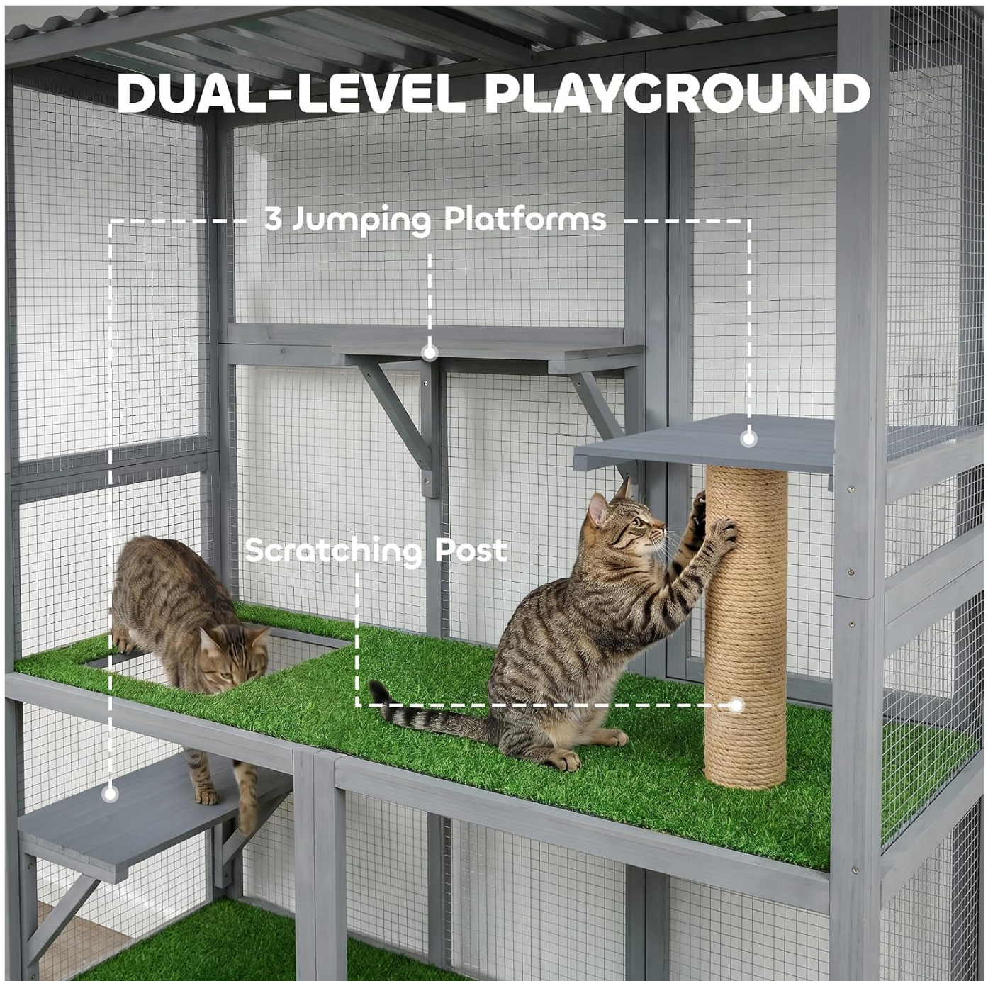
Figure 3: Interior features including jumping platforms and a scratching post for feline activity.