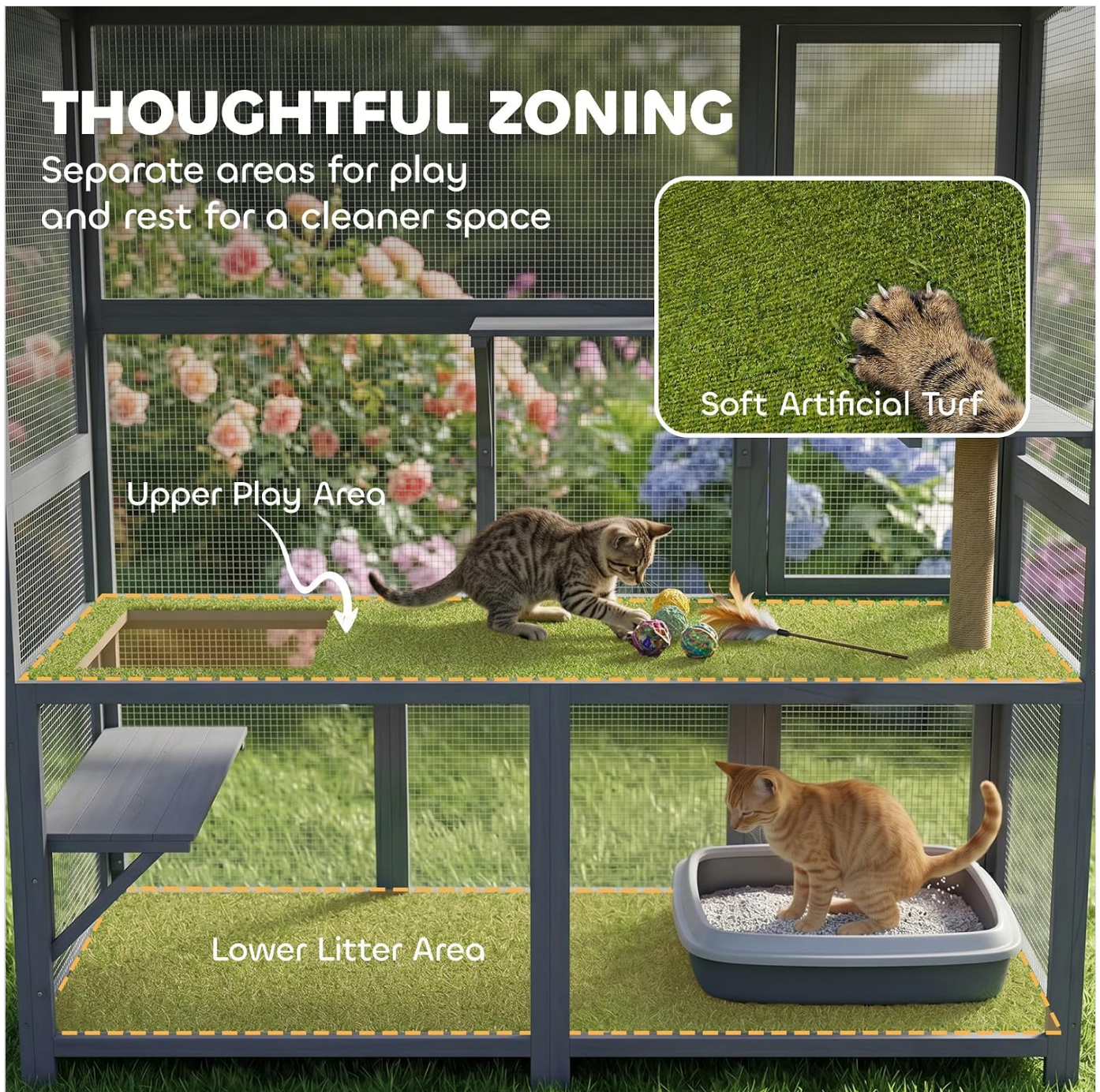
Figure 5: Thoughtful zoning separates play and rest areas from the litter area for improved hygiene.