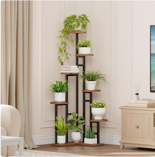
Image 5.1: The plant stand positioned in a living room corner, showcasing multiple plants.