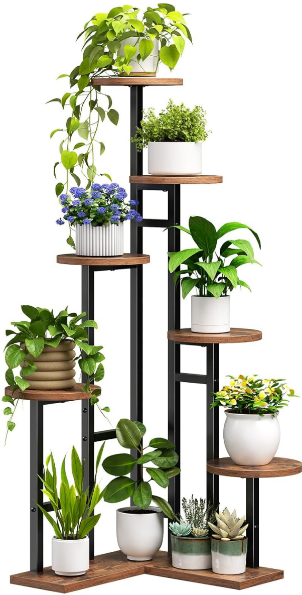
Image 1.1: The HOOBRO 7-Tier Corner Plant Stand, designed to hold multiple potted plants and utilize vertical space.