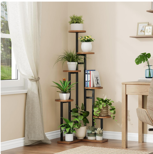
Image 5.2: The plant stand used in a room, demonstrating its versatility for plants and small decorative items.