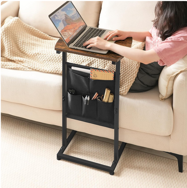
Image 5.4: The C-shaped end table used with a laptop while sitting on a sofa, demonstrating its functional design.