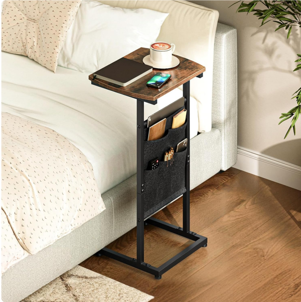
Image 5.3: The C-shaped end table positioned beside a bed, providing a convenient surface for bedside items.