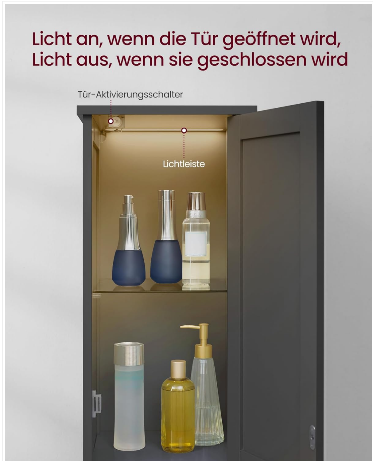
Figure 5.1: Door-Activated Light. The light turns on when the door is opened and off when closed.

The upper cabinet features a built-in light that automatically activates when the door is opened and deactivates when the door is closed. This functionality enhances visibility, making it easier to locate items within the cabinet, especially in low-light conditions.