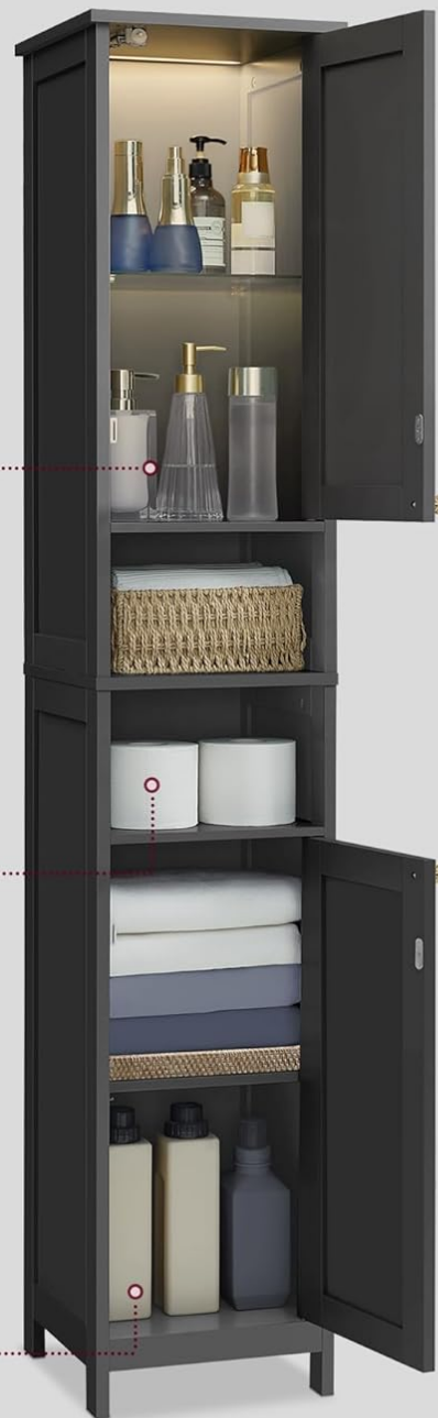
Figure 5.3: Organized Storage. Each section is designed for specific item types.