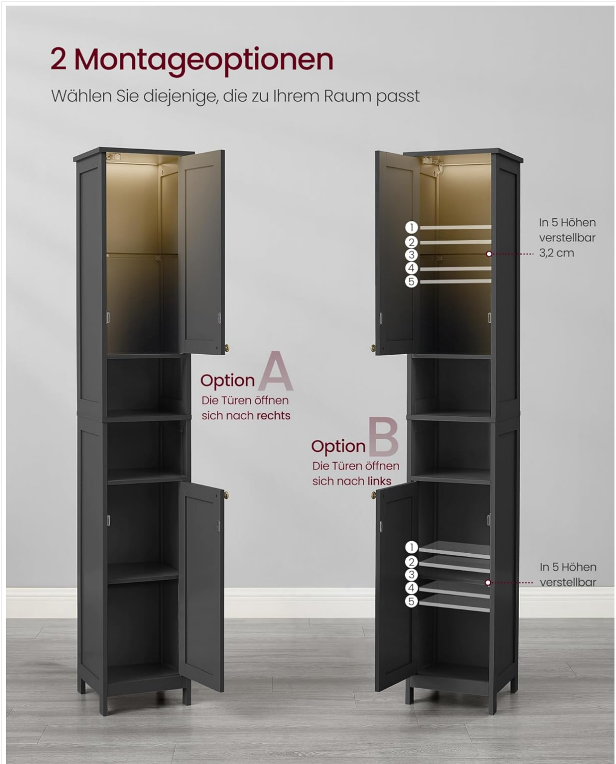
Figure 4.1: Two Assembly Options. Choose between left or right door opening during assembly.

The cabinet doors can be configured to open to either the left or the right. This flexibility allows the cabinet to adapt to various room layouts and personal preferences. Refer to the assembly manual for specific steps on how to choose and implement your desired door orientation.