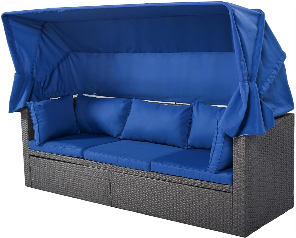
Image: The sectional daybed in sofa configuration with the canopy retracted, showing the open-air seating arrangement.