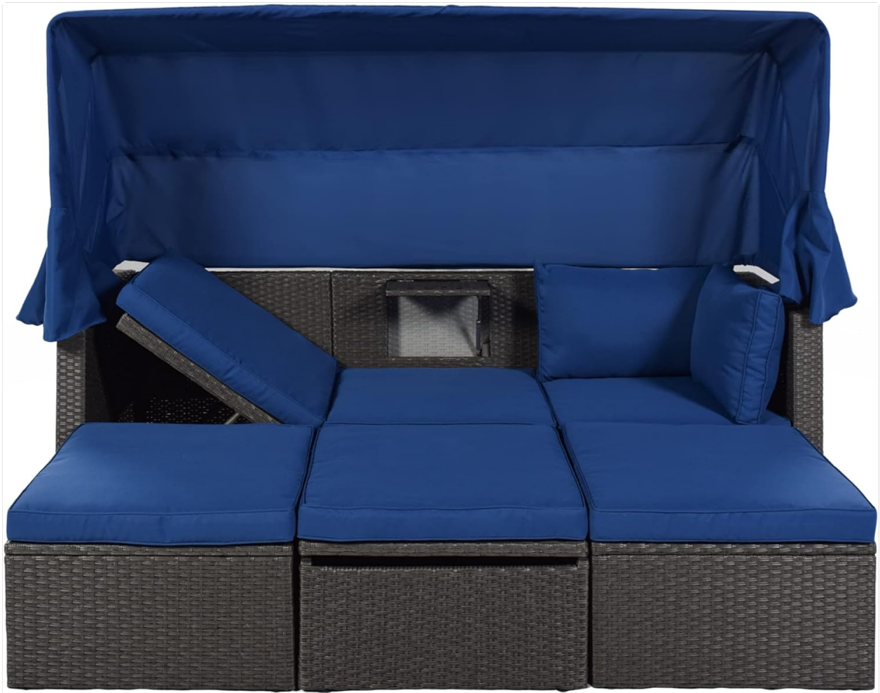
Image: The sectional daybed in daybed configuration with the canopy extended, providing shade for the lounging area.