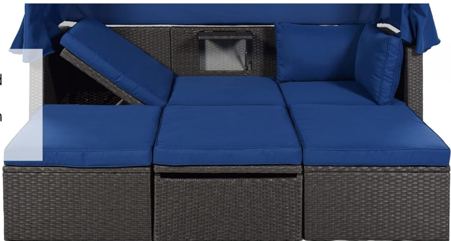
Image: The sectional daybed configured as a conversation set with separate ottomans and then as a full daybed for lounging.