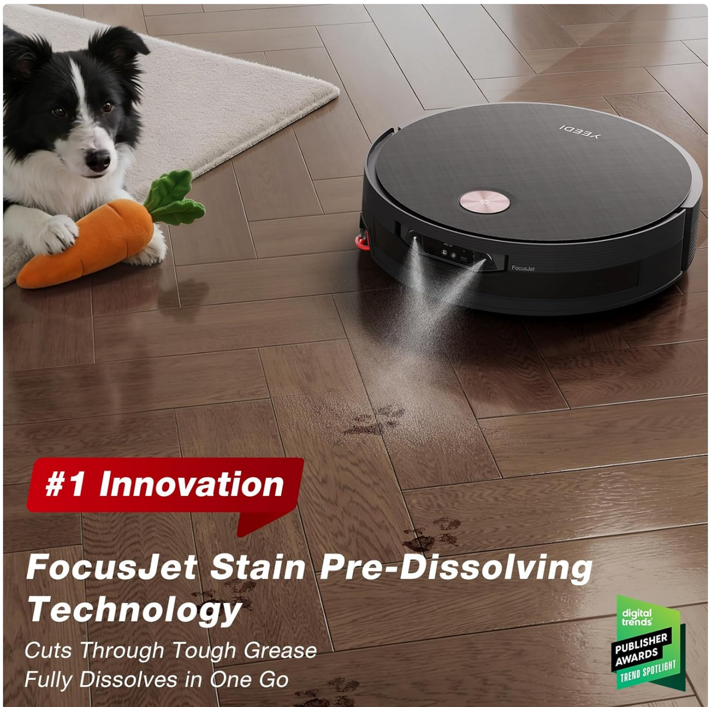
Image: The robot vacuum applying FocusJet Stain Pre-Dissolving Technology to a floor stain.