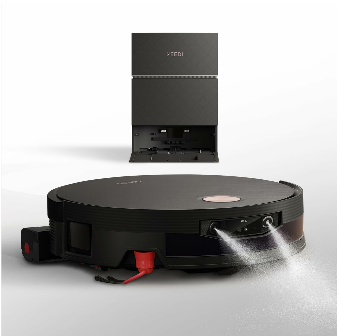
Image: The Yeedi S20 Infinity Ultra Robot Vacuum and Mop with its Omni Station.