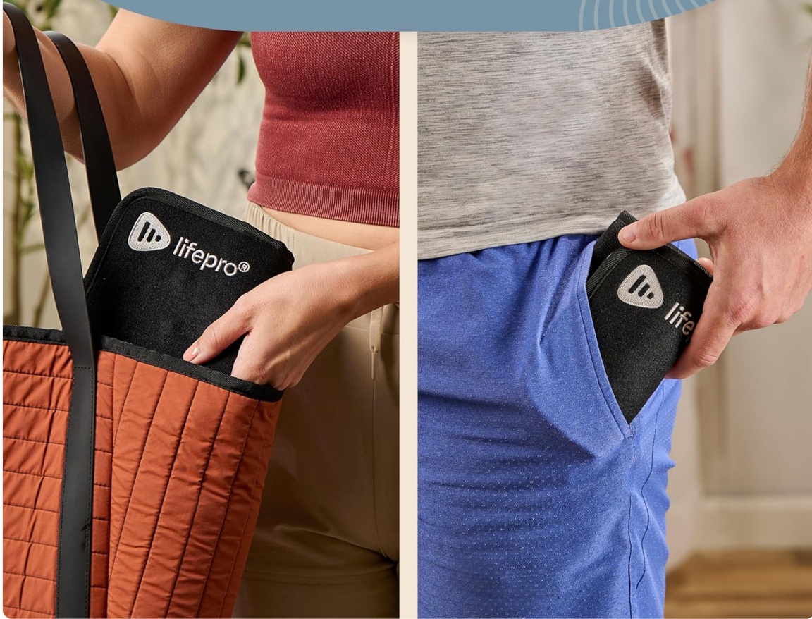
Image: Demonstrating the portability of the therapy belt, showing it being easily stored in a tote bag and a pocket.