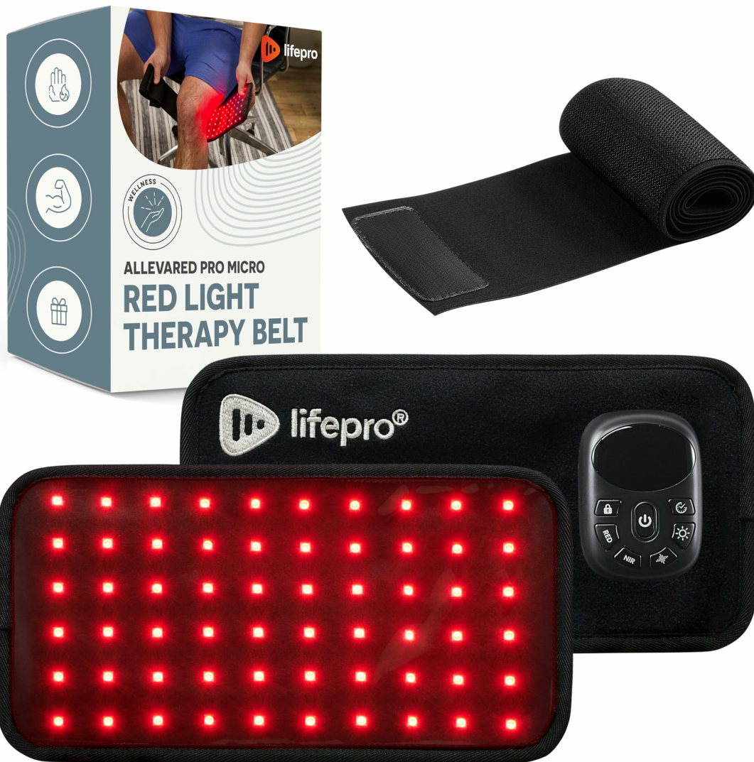
Image: The Lifepro Allevared Pro Micro Red Light Therapy Belt with its detachable control unit, ready for use.