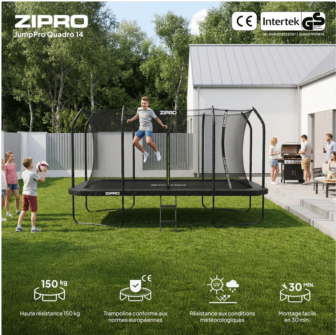
Image: The ZIPRO JumpPro Quadro 14FT Rectangular Trampoline set up in a garden, showing children actively using it and adults nearby. This illustrates the trampoline's intended use in a family setting.