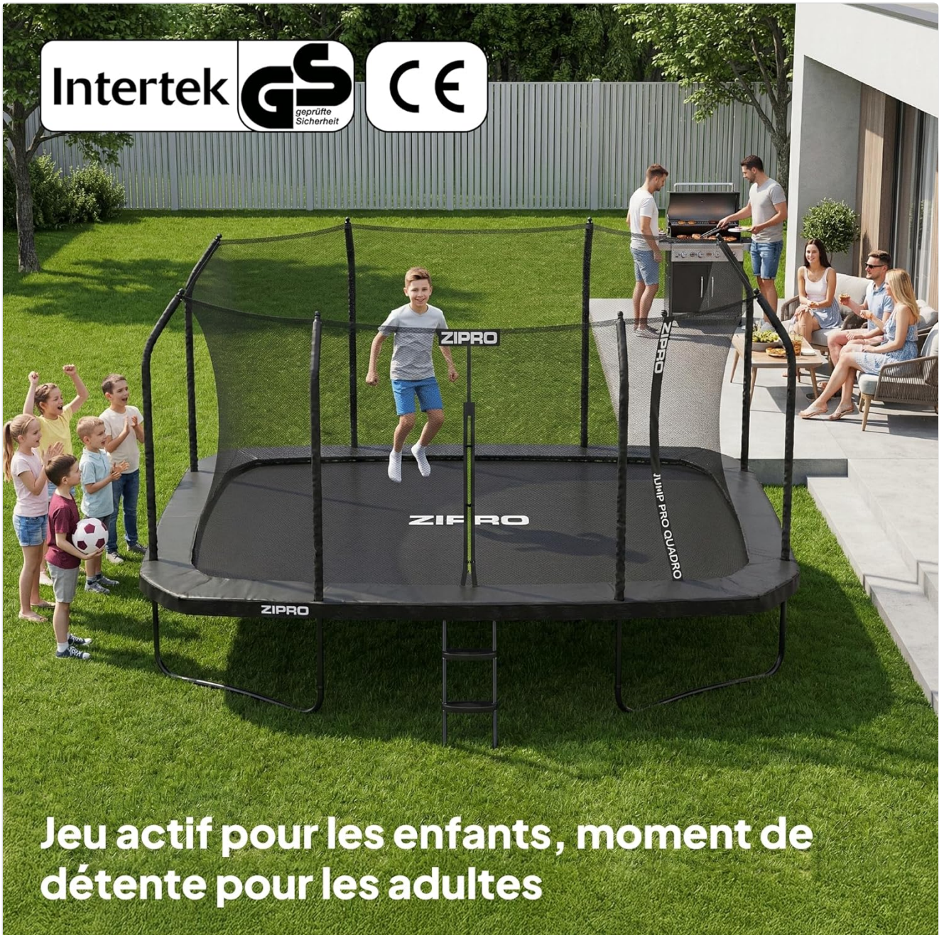
Image: A child actively jumping on the ZIPRO JumpPro Quadro 14FT trampoline, demonstrating its use for active play and emphasizing the large jumping surface.