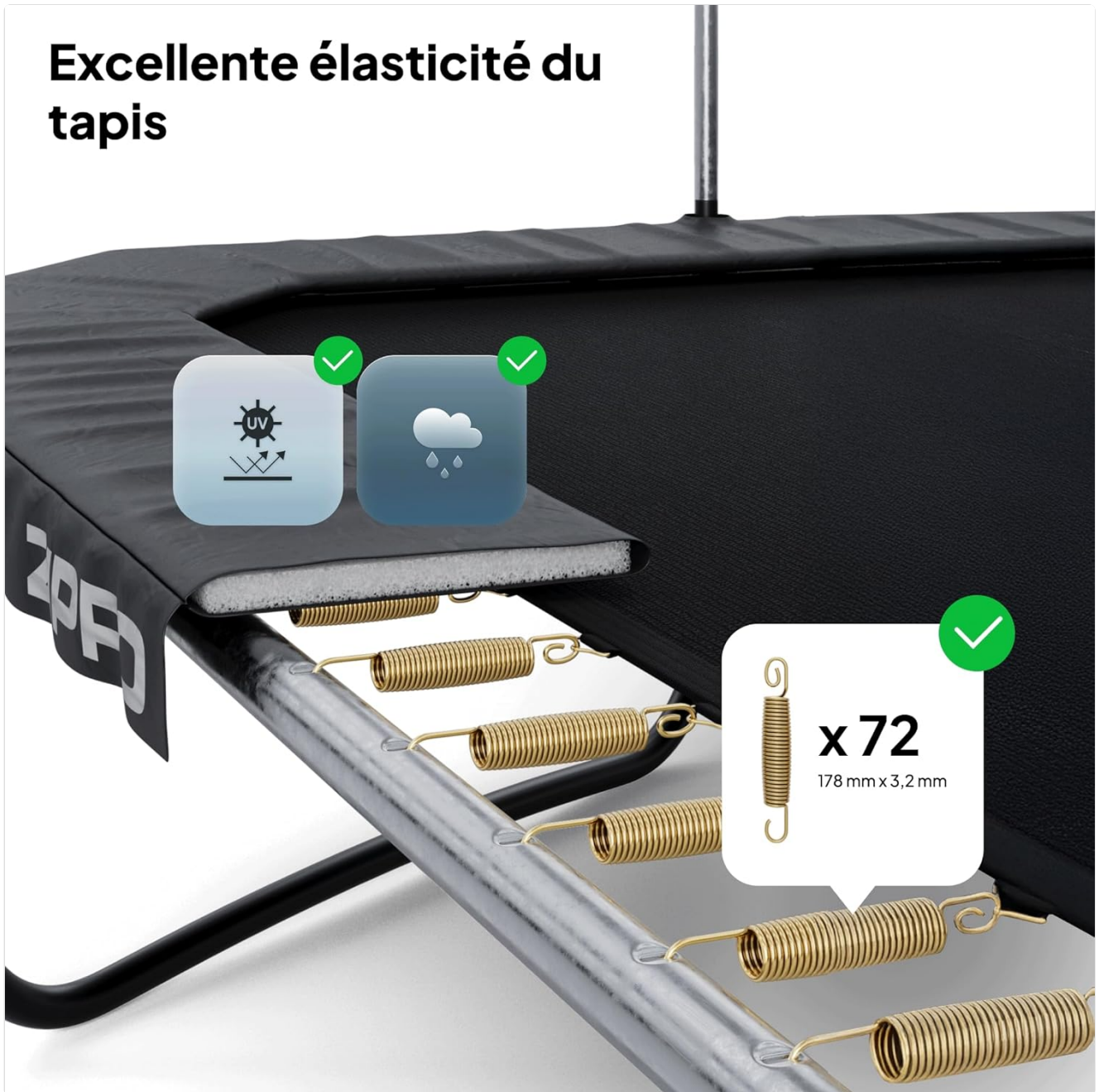
Image: A close-up view of the trampoline's springs and the edge of the jumping mat, illustrating the quantity of springs (72 units, 178 mm x 3.2 mm) and the robust connection that provides excellent elasticity for the jumping surface.