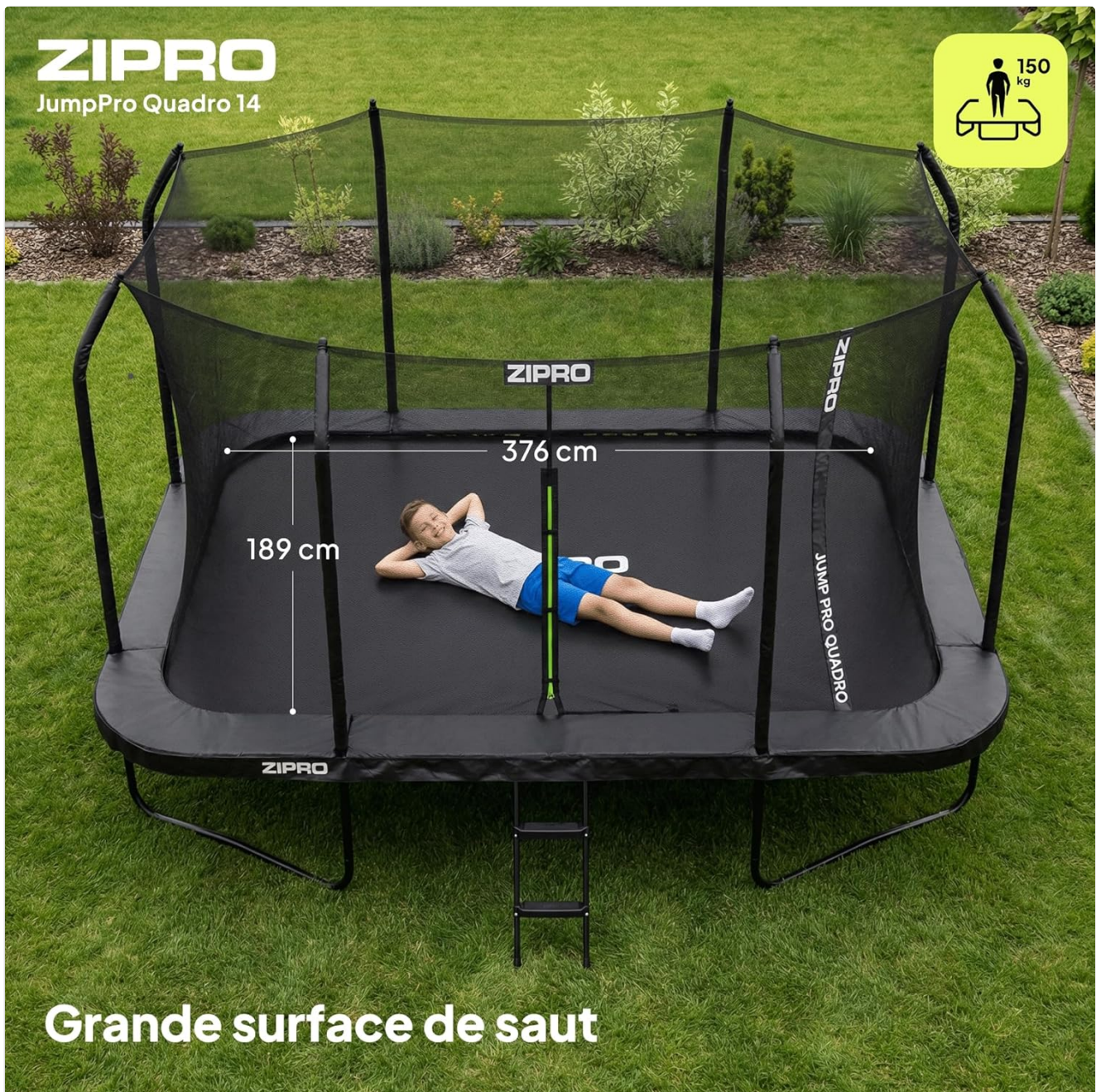
Image: A top-down view of the ZIPRO JumpPro Quadro 14FT trampoline, clearly indicating the jumping surface dimensions: 376 cm in length and 189 cm in width. A child is shown relaxing on the mat, providing a sense of scale.