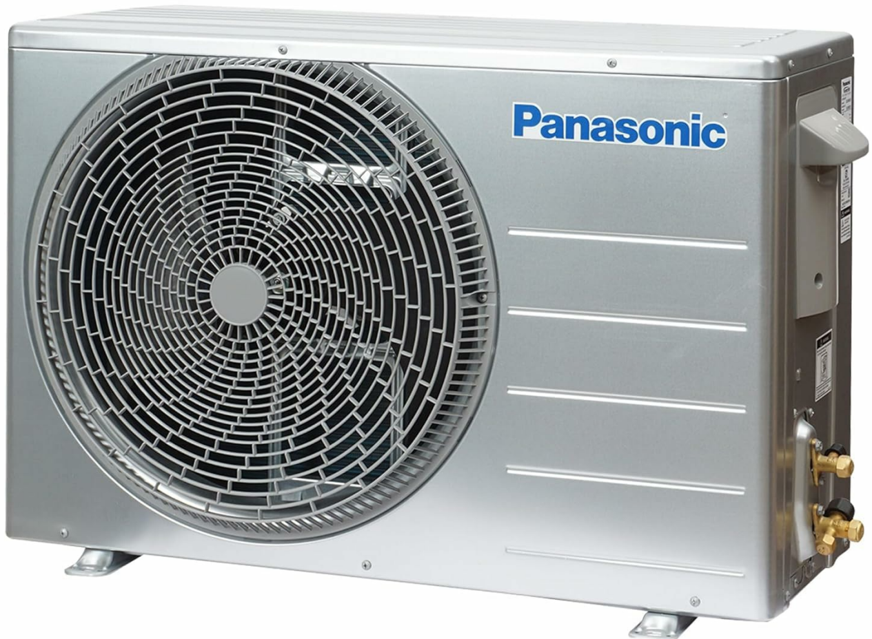
Image: Panasonic Outdoor AC Unit. This image displays the silver-colored outdoor unit of the Panasonic air conditioner, showing the fan grille and connection points.