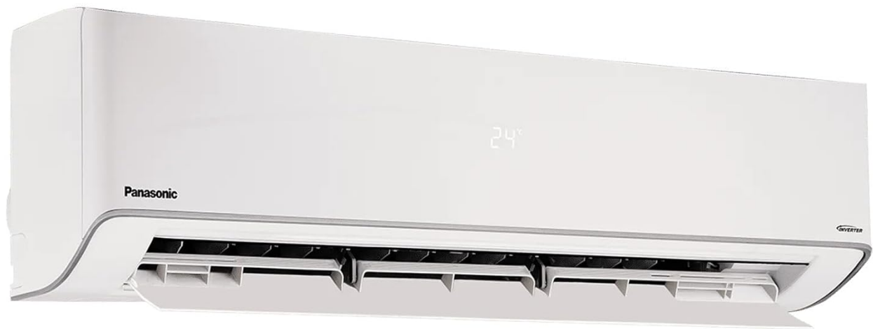
Image: Panasonic Indoor AC Unit. This image shows the sleek white indoor unit of the Panasonic split air conditioner, featuring a digital display and the Panasonic logo.