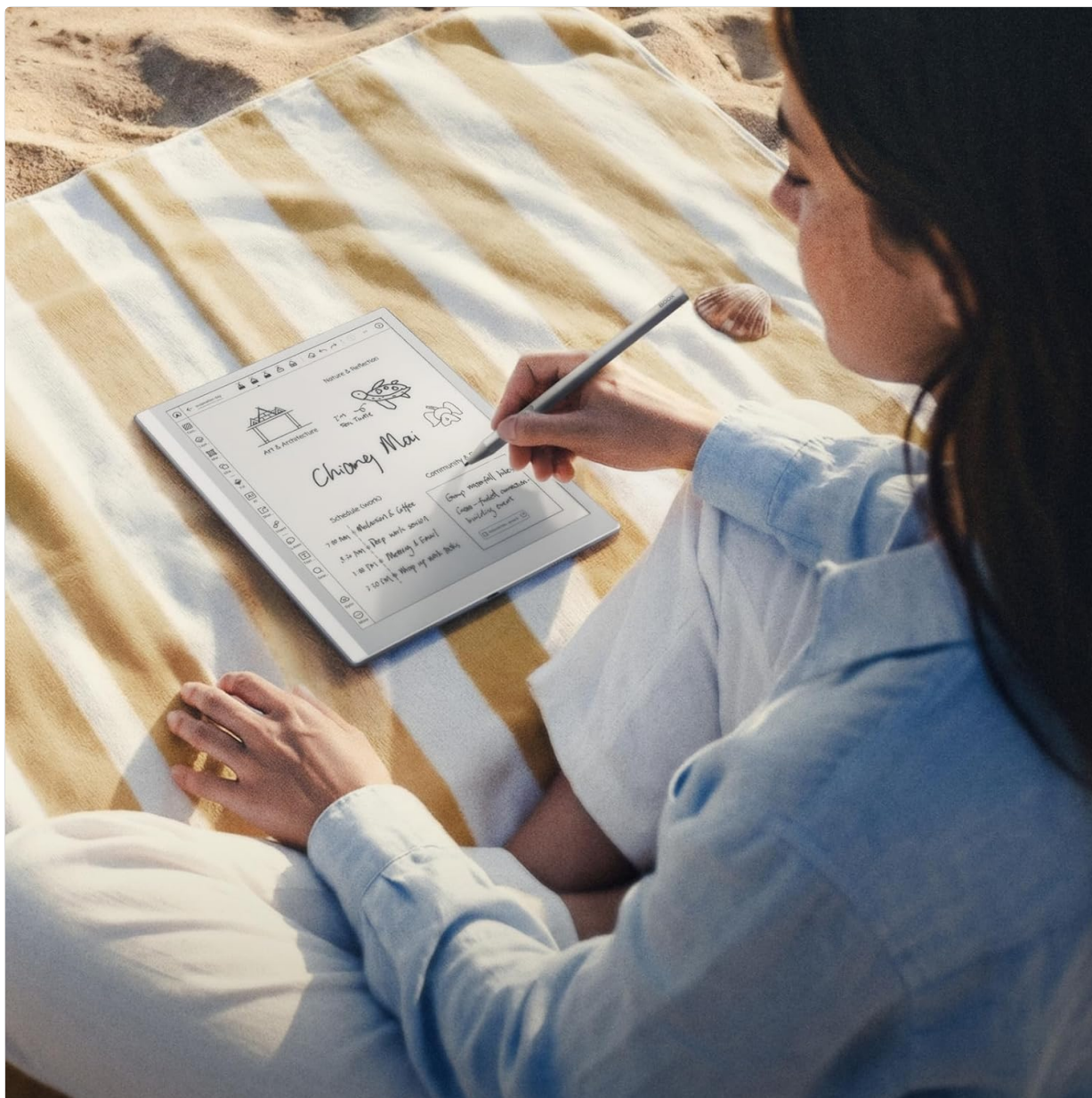
Image: The BOOX Go 10.3 Gen2 Lumi being used for creative tasks like sketching, highlighting its versatility and portability for various environments.