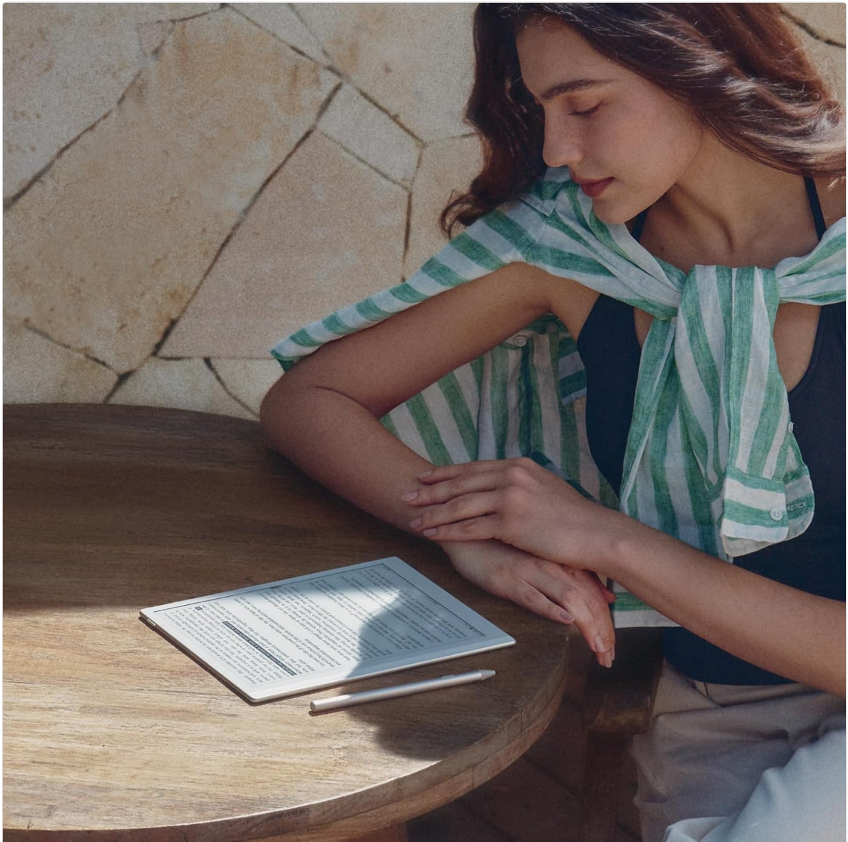
Image: A user comfortably reading on the BOOX Go 10.3 Gen2 Lumi, demonstrating its portability and clear display for outdoor use.

Open your desired document or e-book from the library. Swipe left or right on the screen to turn pages. Tap the center of the screen to bring up reading settings, allowing you to adjust font size, contrast, and backlight.