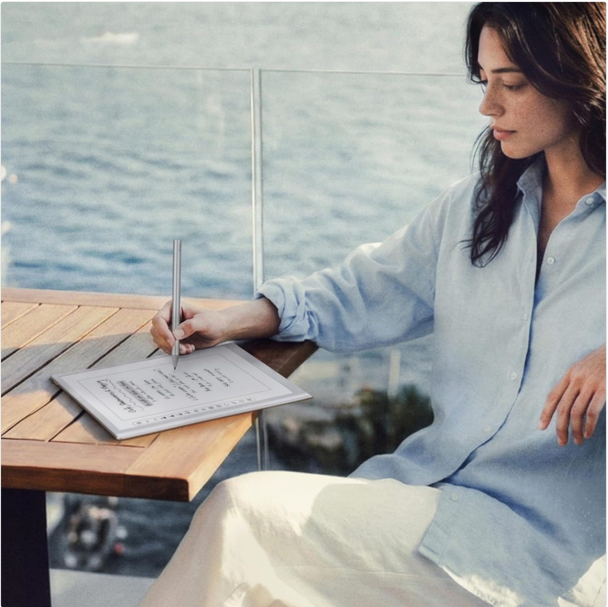
Image: A user actively writing on the BOOX Go 10.3 Gen2 Lumi with the InkSense Plus Stylus, showcasing its note-taking capabilities.