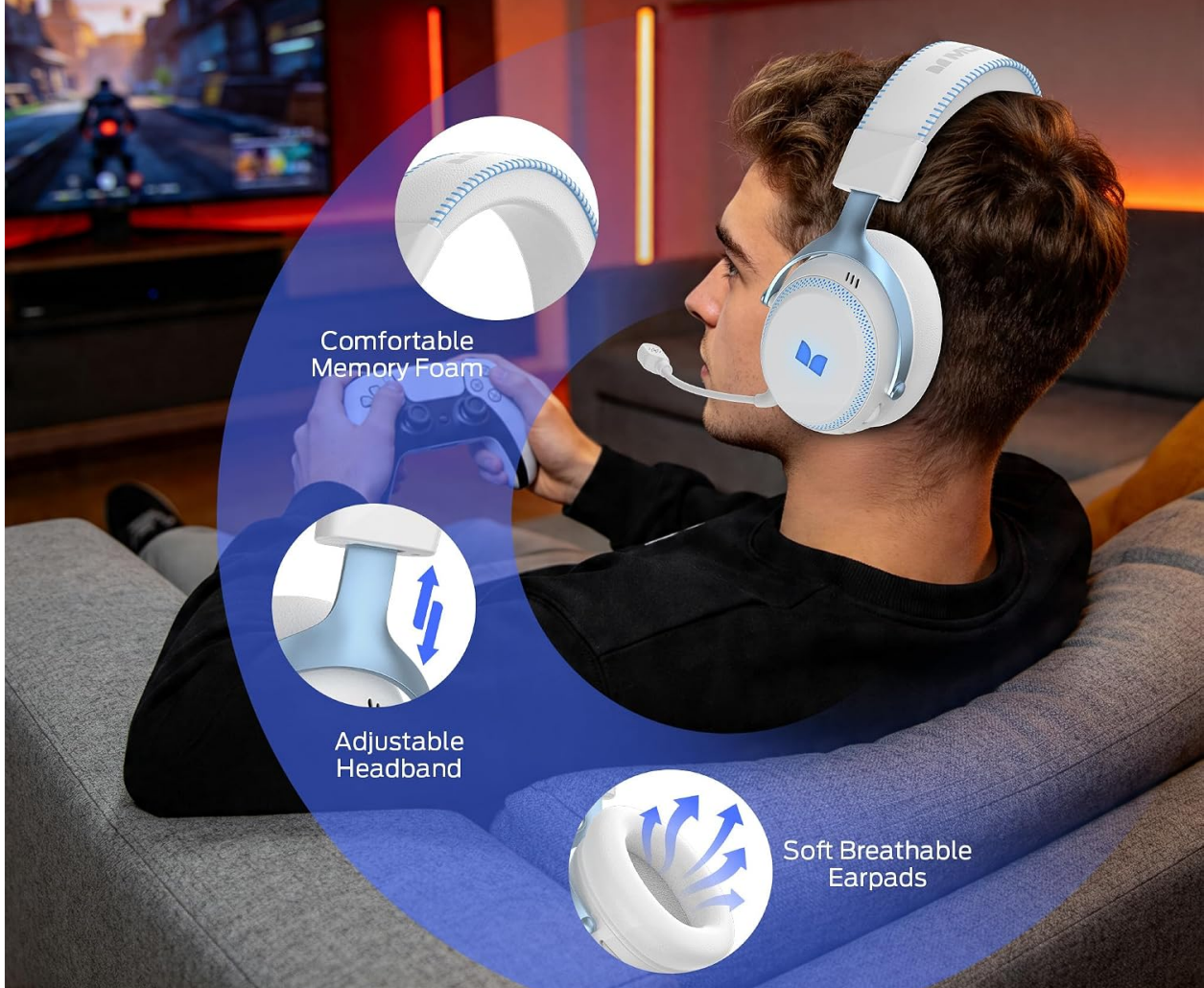
Figure 6.1: The Monster Mission 350 headset is designed for all-day comfort, featuring comfortable memory foam earcups, an adjustable headband, and soft, breathable earpads to reduce fatigue during extended use.

Ultra-Lightweight Build for Fatigue-Free Gaming