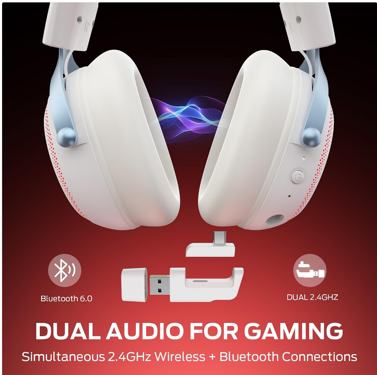
Figure 4.1: The Monster Mission 350 supports dual audio connections, featuring Bluetooth 6.0 for mobile devices and a dedicated 2.4GHz wireless dongle for low-latency gaming on compatible platforms.