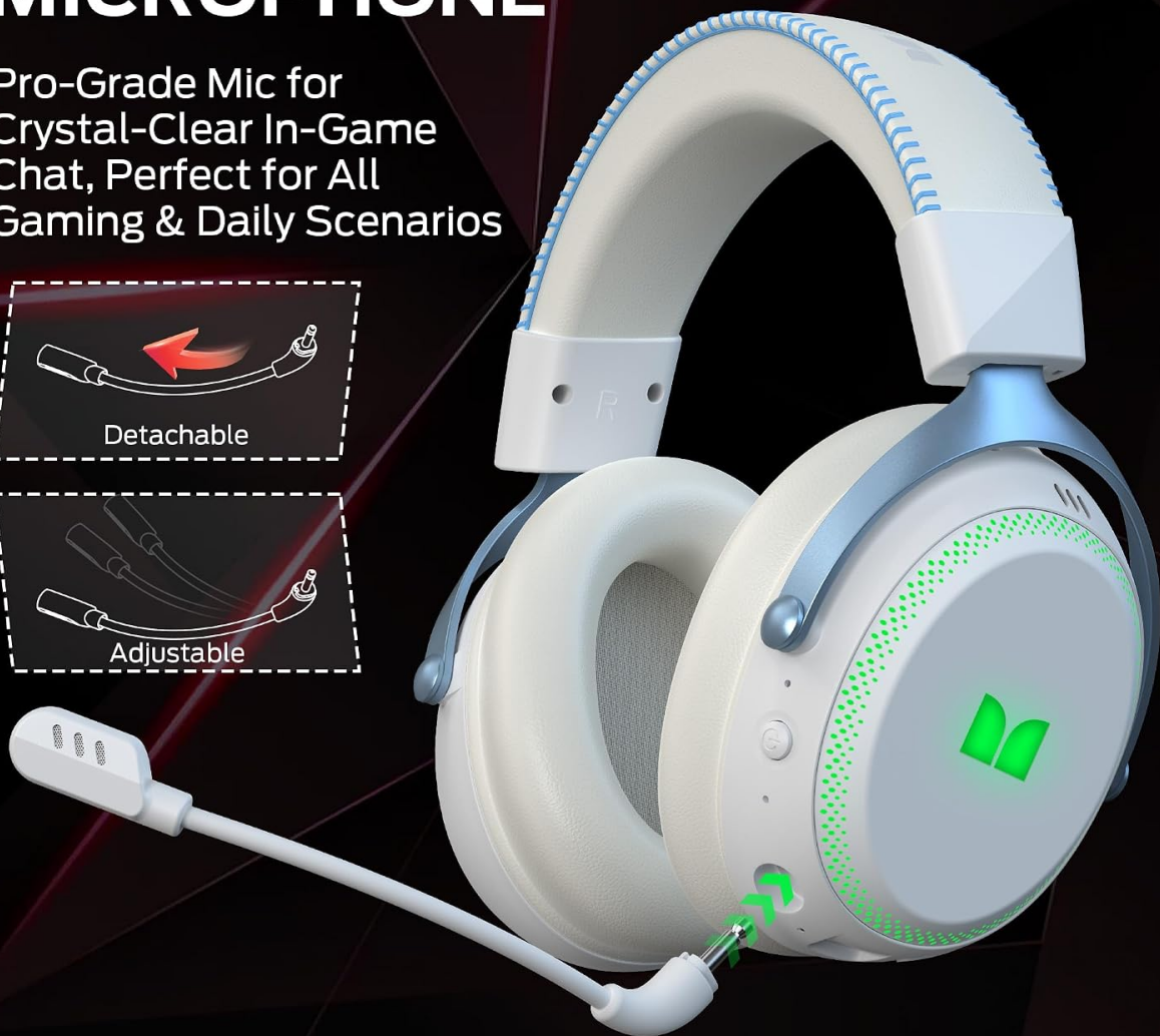
Figure 3.1: The headset features a detachable and adjustable gaming microphone, designed for clear in-game communication and versatile use in various scenarios.