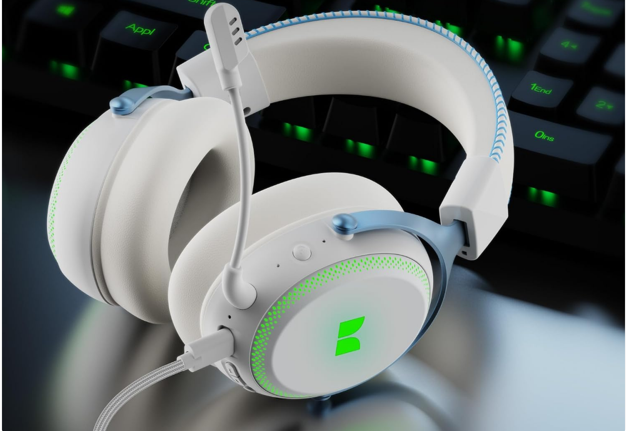
Figure 3.2: The headset includes customizable RGB lighting effects on the earcups, allowing users to personalize their gaming setup and enhance the aesthetic appeal.

Customizable RGB Lights for Stand-Out Style & Dynamic Gaming Atmosphere