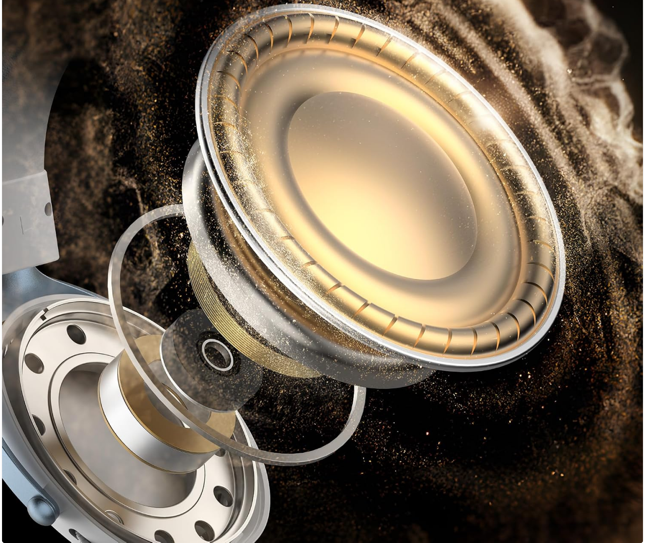
Figure 8.1: The Monster Mission 350 headset is equipped with a 55mm dynamic driver, engineered to deliver clear and powerful audio performance for gaming and multimedia.