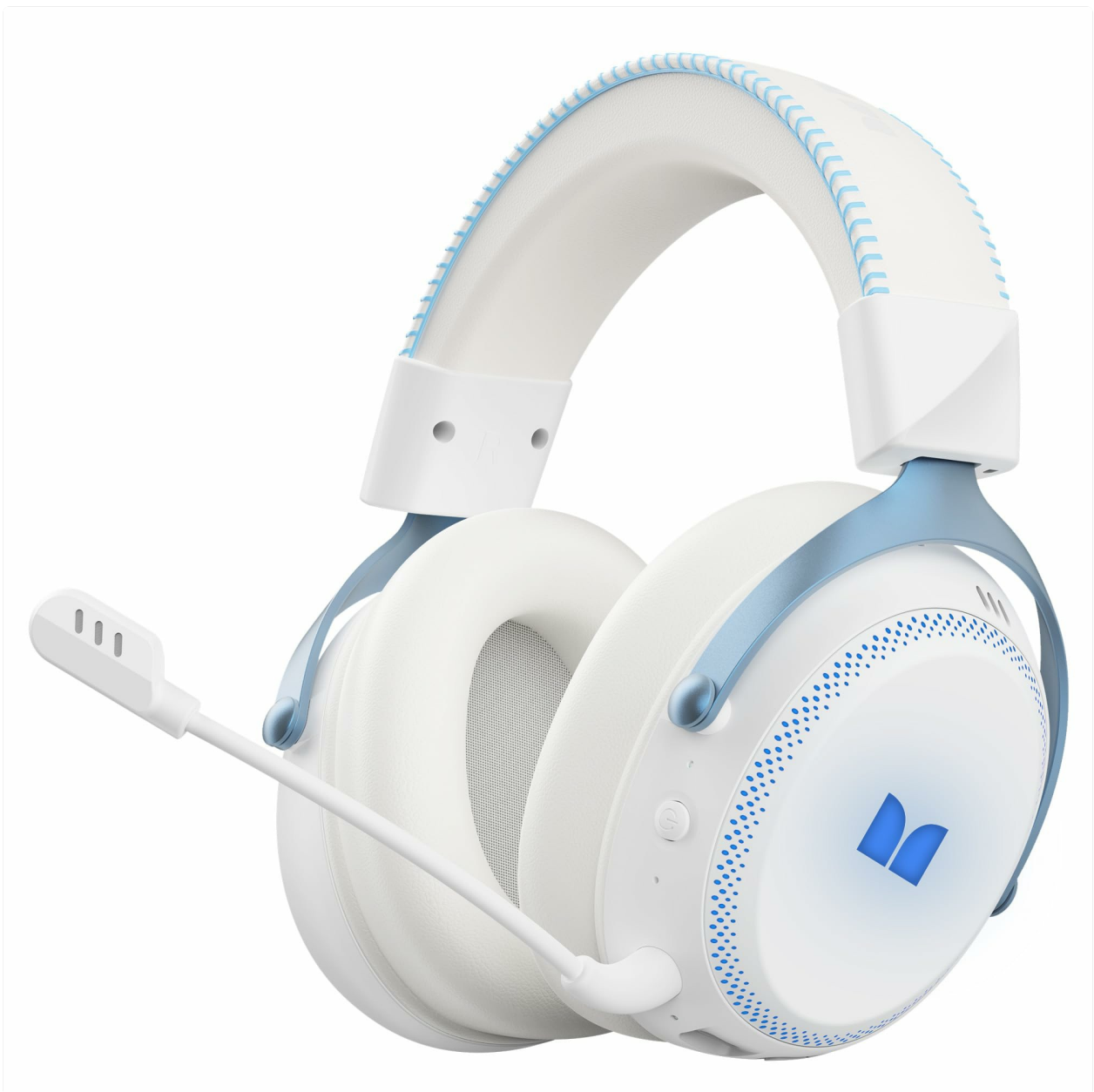
Figure 1.1: The Monster Mission 350 headset providing 7.1 surround sound, allowing users to pinpoint audio cues like gunshots, explosions, vehicle sounds, and enemy footsteps for an immersive gaming experience.