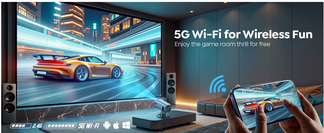
Image: The projector wirelessly connected to a smartphone via 5G Wi-Fi, displaying content on a large screen.