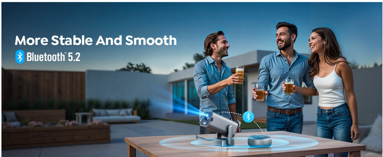
Image: The projector wirelessly connecting to an external Bluetooth speaker, indicating Bluetooth 5.2 connectivity.