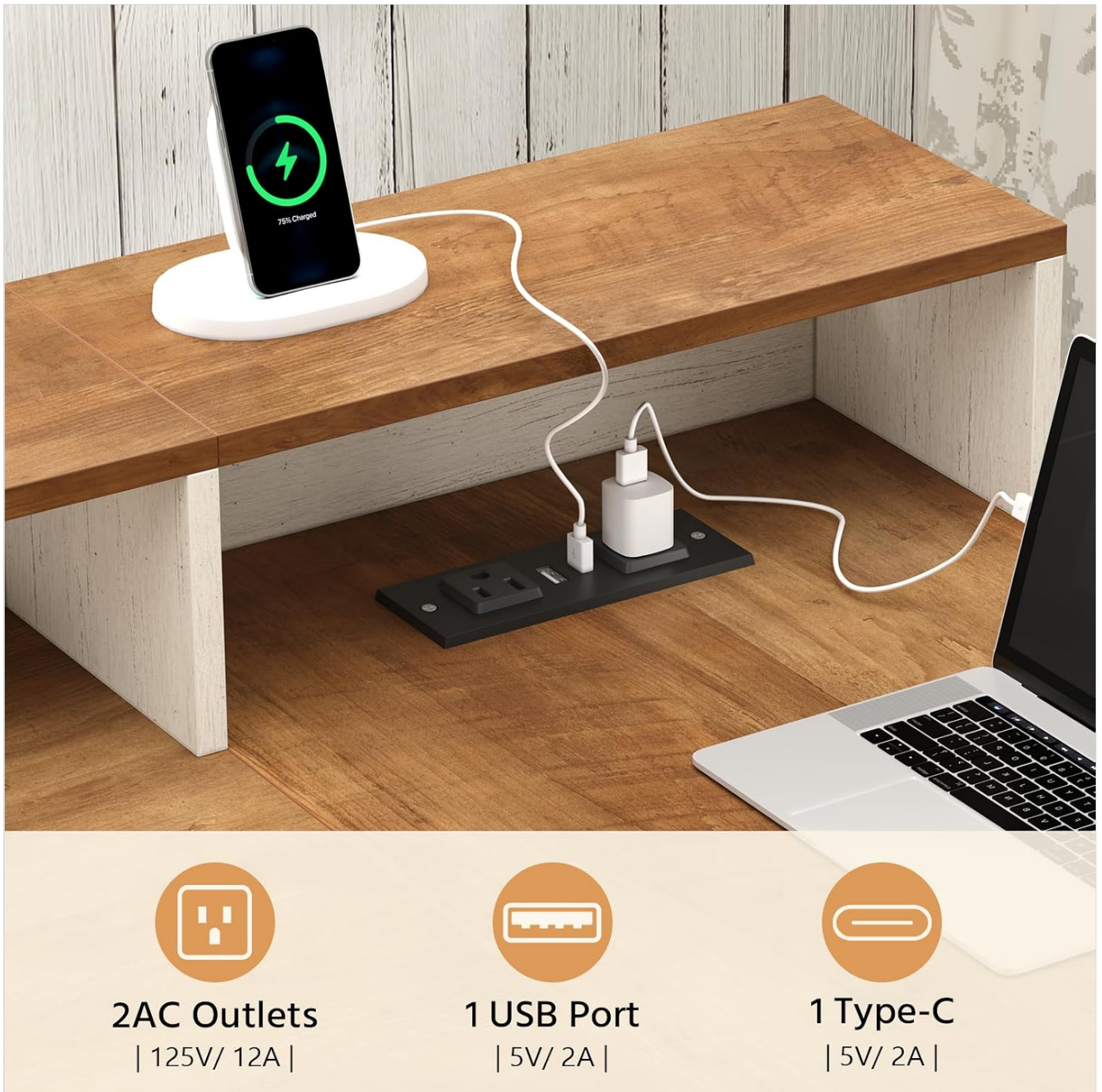
Figure 4: Integrated Power Outlet. This image details the power strip with its various ports for convenient device charging.