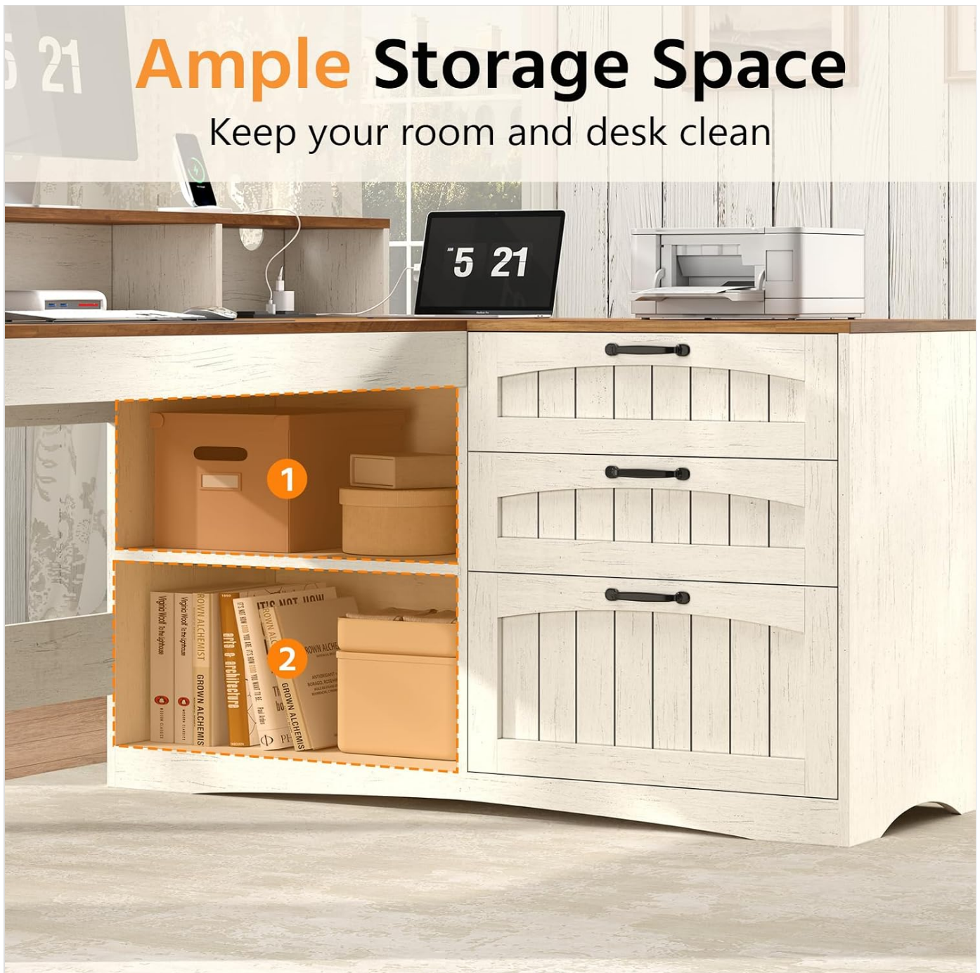
Figure 5: Ample Storage Space. This image illustrates the various storage compartments, including open shelves and drawers, designed for organization.