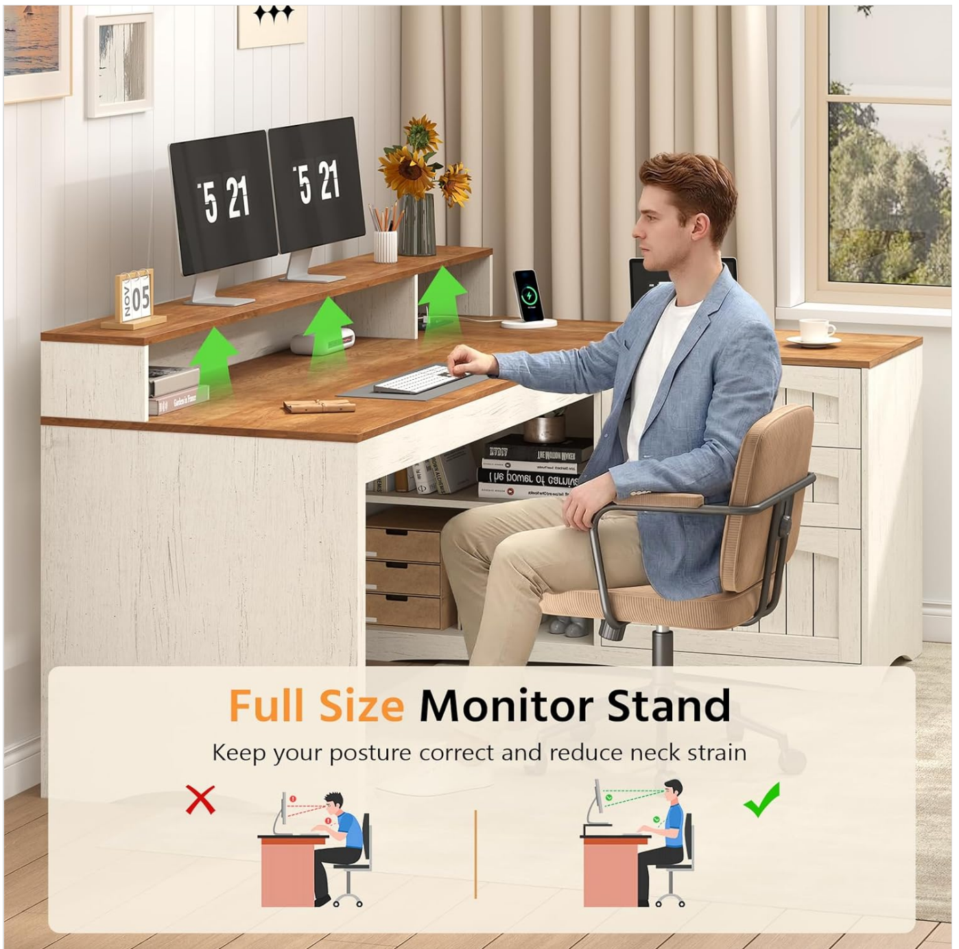
Figure 3: Monitor Stand Ergonomics. This image highlights the ergonomic benefits of the elevated monitor stand, promoting better posture.