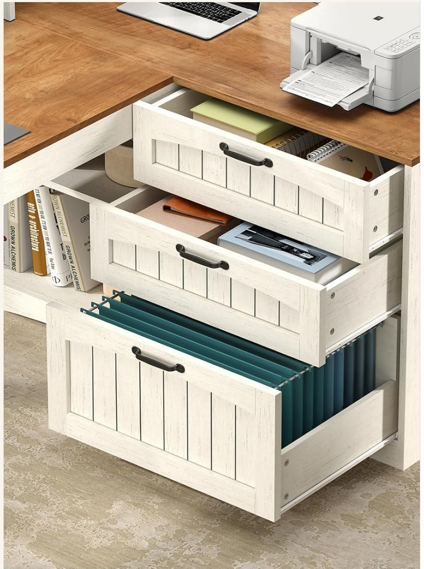
Figure 2: Storage Drawers. The image demonstrates the capacity and design of the three storage drawers, suitable for various document sizes.