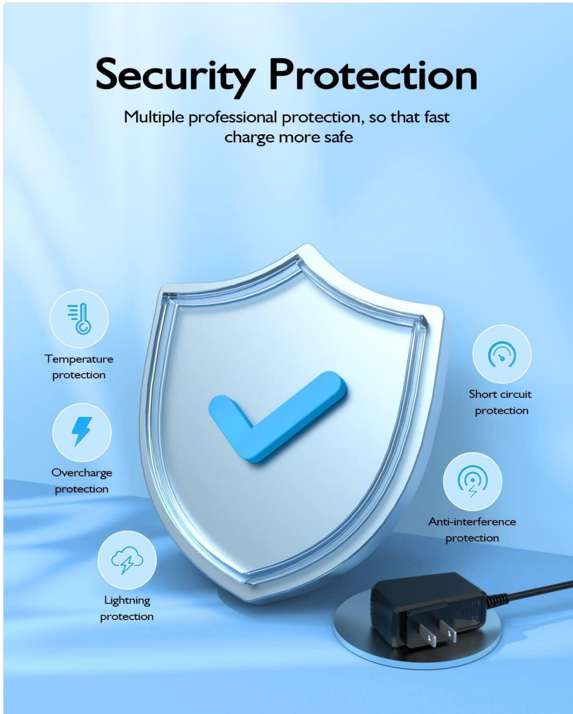
Image: Security Protection features of the eeTao Power Supply Adapter.