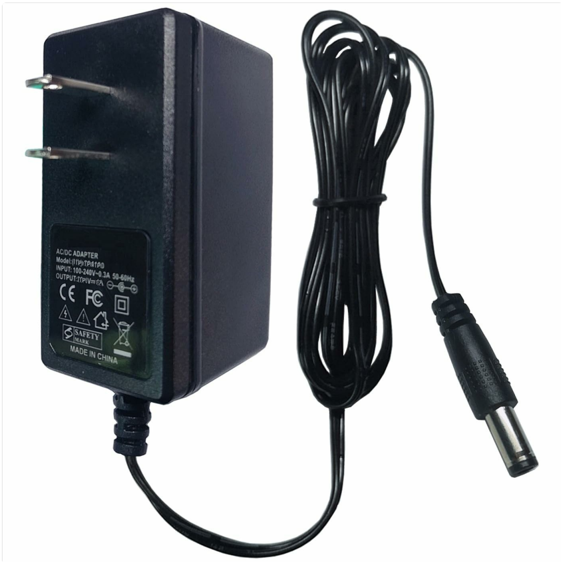
Image: The eeTao Power Supply Adapter.