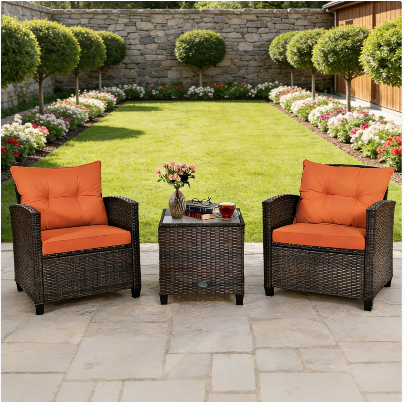
Image 1.1: The 3-piece patio furniture set in a garden environment.