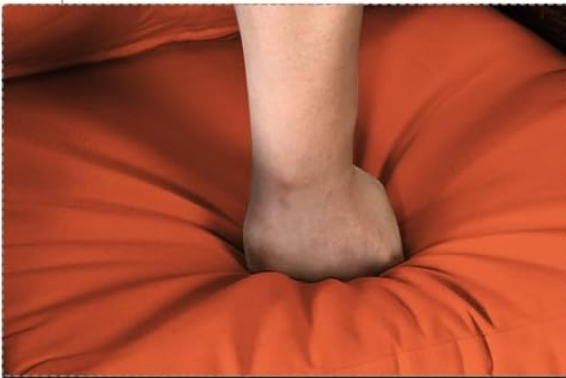
Thick & High-resilience Cushion