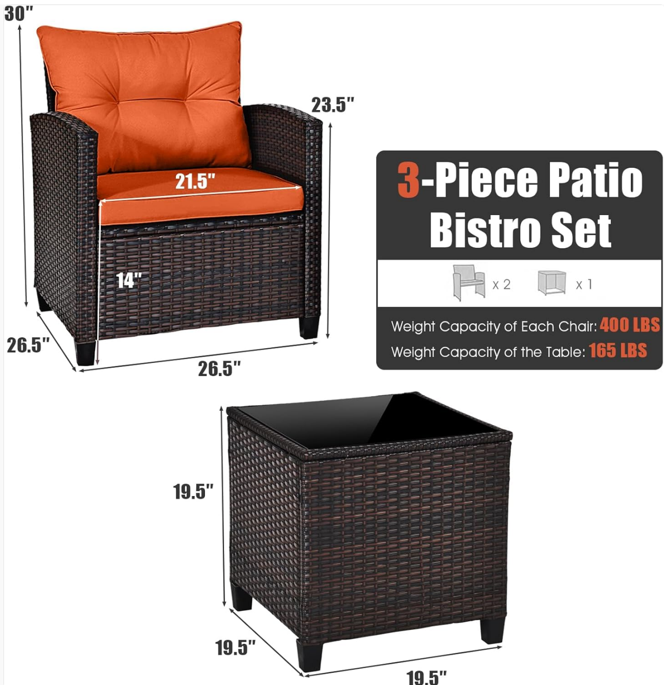
Image 4.1: Product dimensions and weight capacities for reference during assembly.

Your browser does not support the video tag.