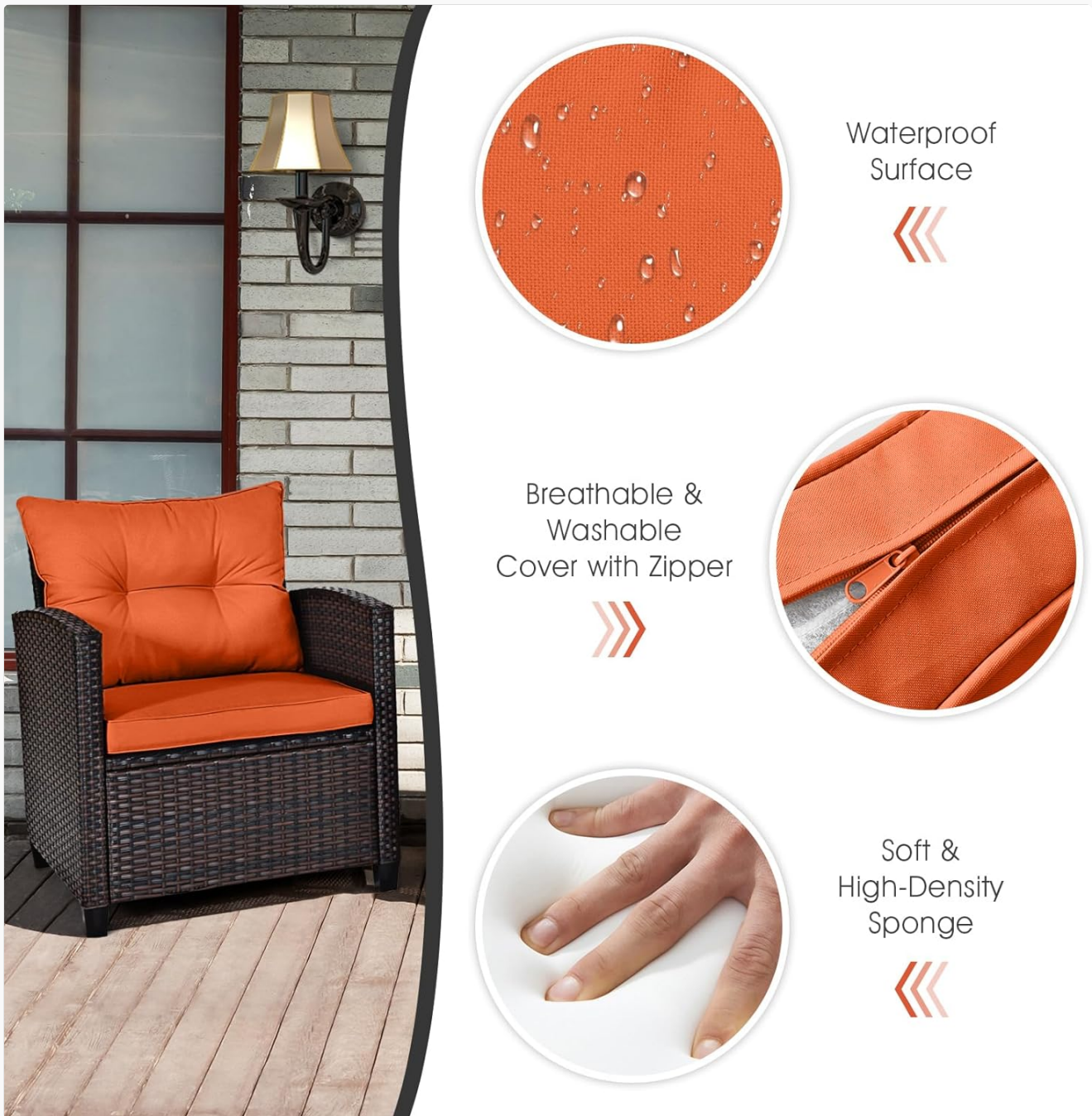
Image 6.1: Details of the cushion material, highlighting its waterproof surface, washable cover with zipper, and soft, high-density sponge.