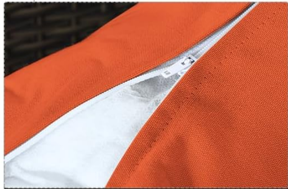
Thick & High-resilience Cushion