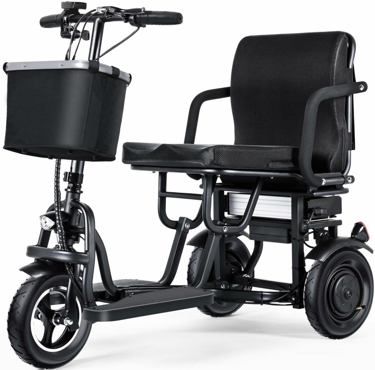
Figure 2.1: TopMate ES11 Mobility Tricycle in its operational state.