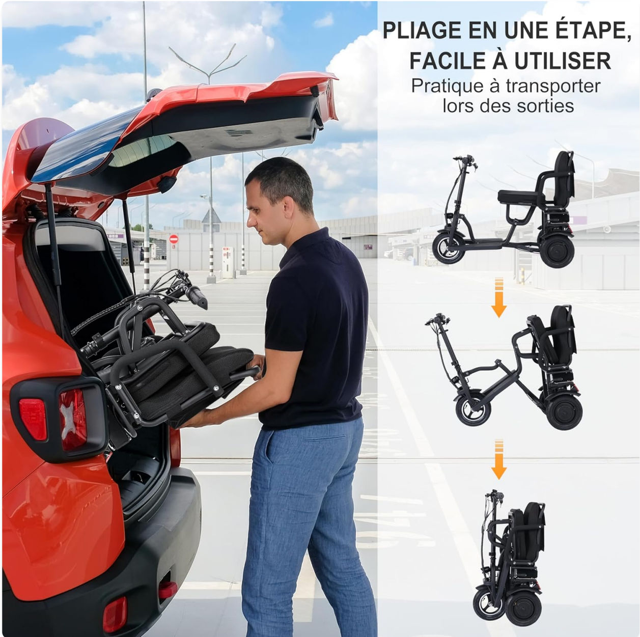
Figure 3.1: The ES11 tricycle can be easily unfolded and stored in a car trunk.

The ES11 features a quick one-step folding mechanism. To unfold, release the locking mechanism and extend the frame until it clicks into place. Ensure all locking pins are engaged for safe operation.