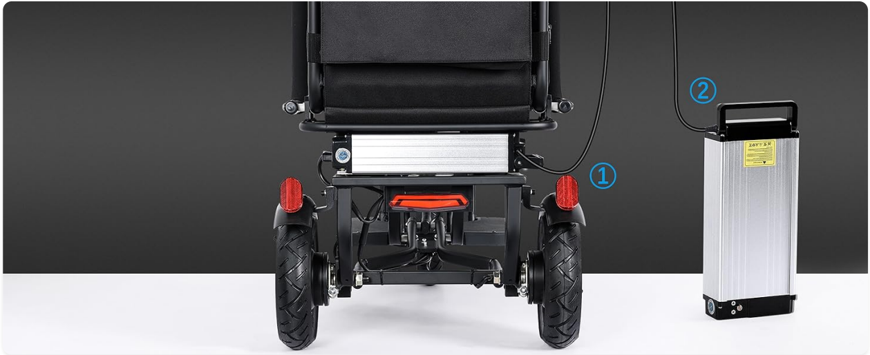
Figure 5.1: The 48V 10.4Ah removable battery provides a range of 26-32 km.