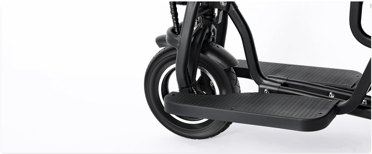
Figure 3.2: Detailed view of the tricycle's folding mechanism.