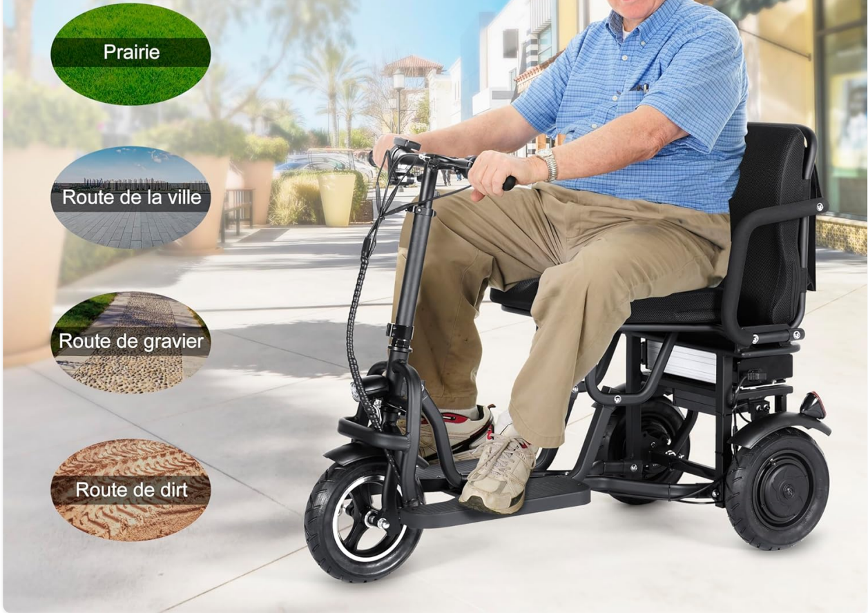
Figure 4.2: The ES11 is powered by two 48V 350W motors, providing a maximum speed of 24 km/h and 24 Nm torque.

Modèle résistant à l'usure et antidérapant Améliore efficacement l'adhérence du pneu, compatible avec une variété de conditions routières