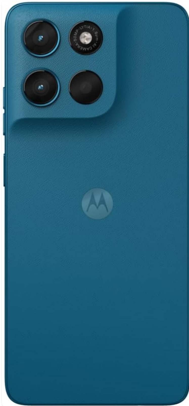
Image 3.1: Rear view of the Motorola Moto G57 5G, showing the camera module and Motorola logo.