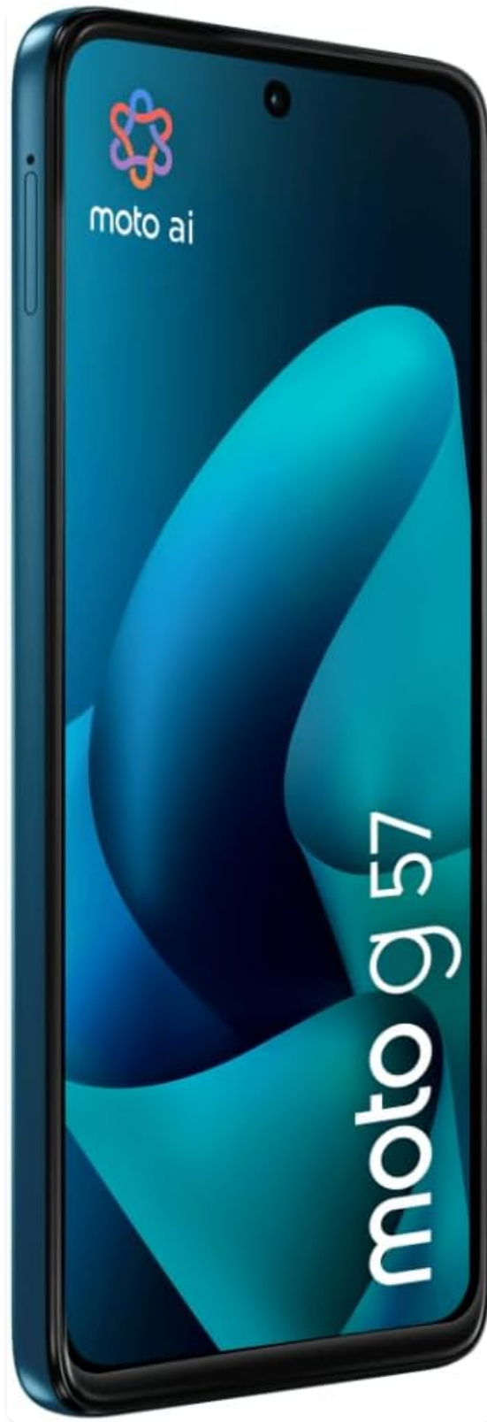
Image 3.2: Side view of the Motorola Moto G57 5G, typically showing power and volume buttons.