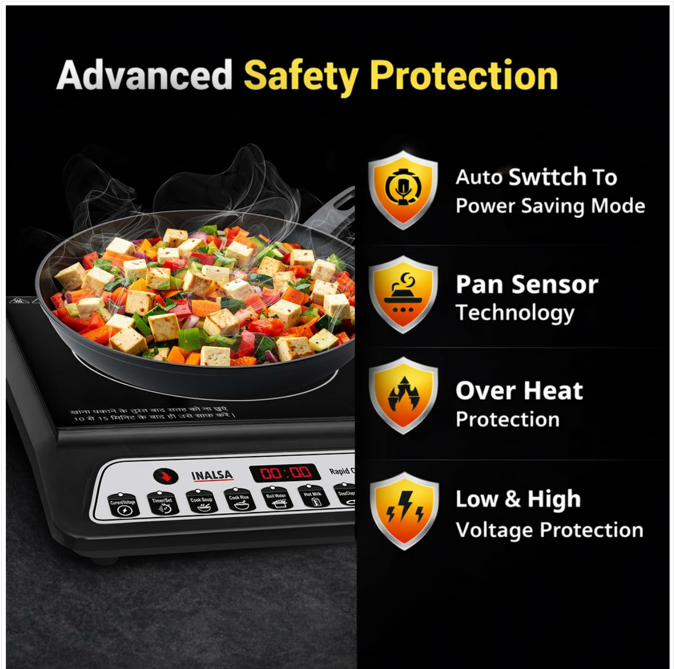
Image 2.1: Illustration of the advanced safety features, including pan sensor technology, overheat protection, and voltage protection.