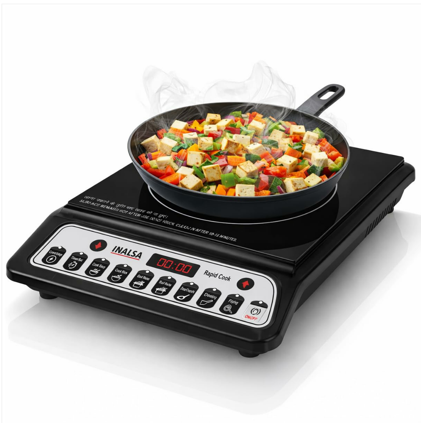
Image 1.1: Overview of the INALSA Rapid Cook 1600W Induction Cooktop highlighting its 1600 Watt power for fast cooking, even heat distribution, energy efficiency, and time-saving benefits.