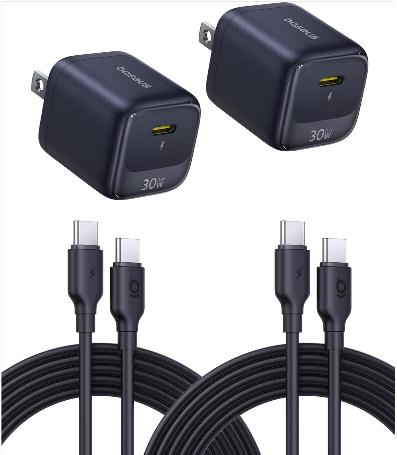
Image: Two Baseus 30W USB C Charger Blocks (EnerFill FN22) shown with accompanying USB-C cables.