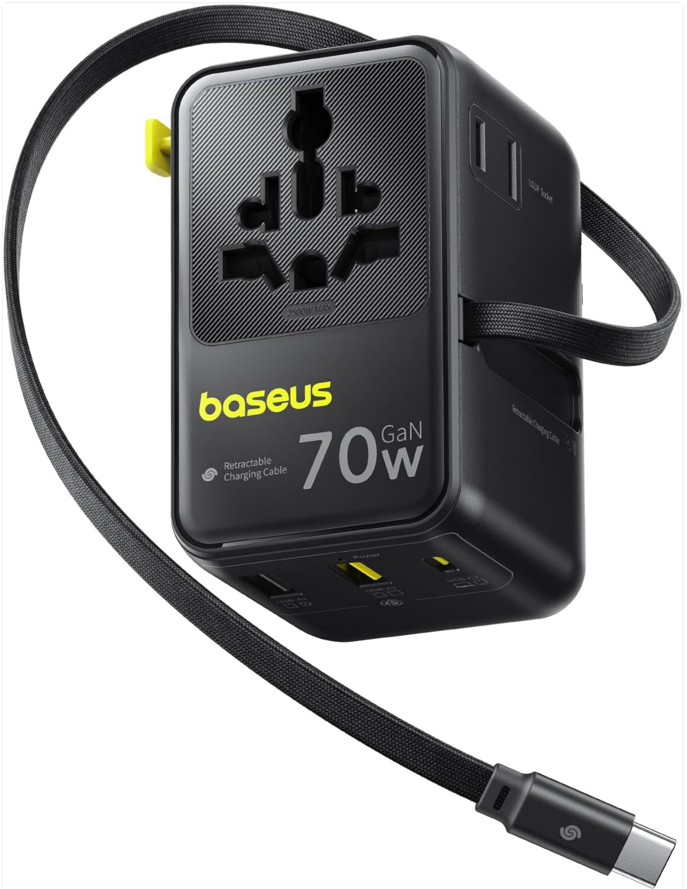
Image: Baseus 70W Universal Travel Adapter (Enercore CG11) with its integrated retractable USB-C cable.