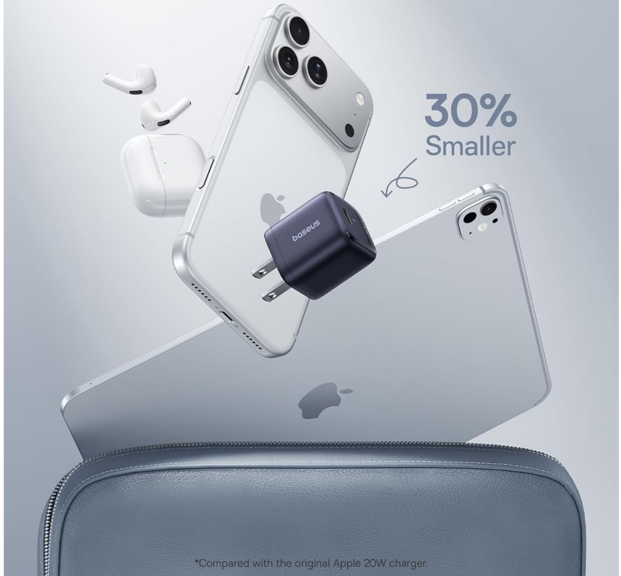
Image: The Baseus 30W charger block shown next to an iPhone and AirPods, emphasizing its ultra-compact design for travel.

Ultra-compact that is easy to carry anywhere.