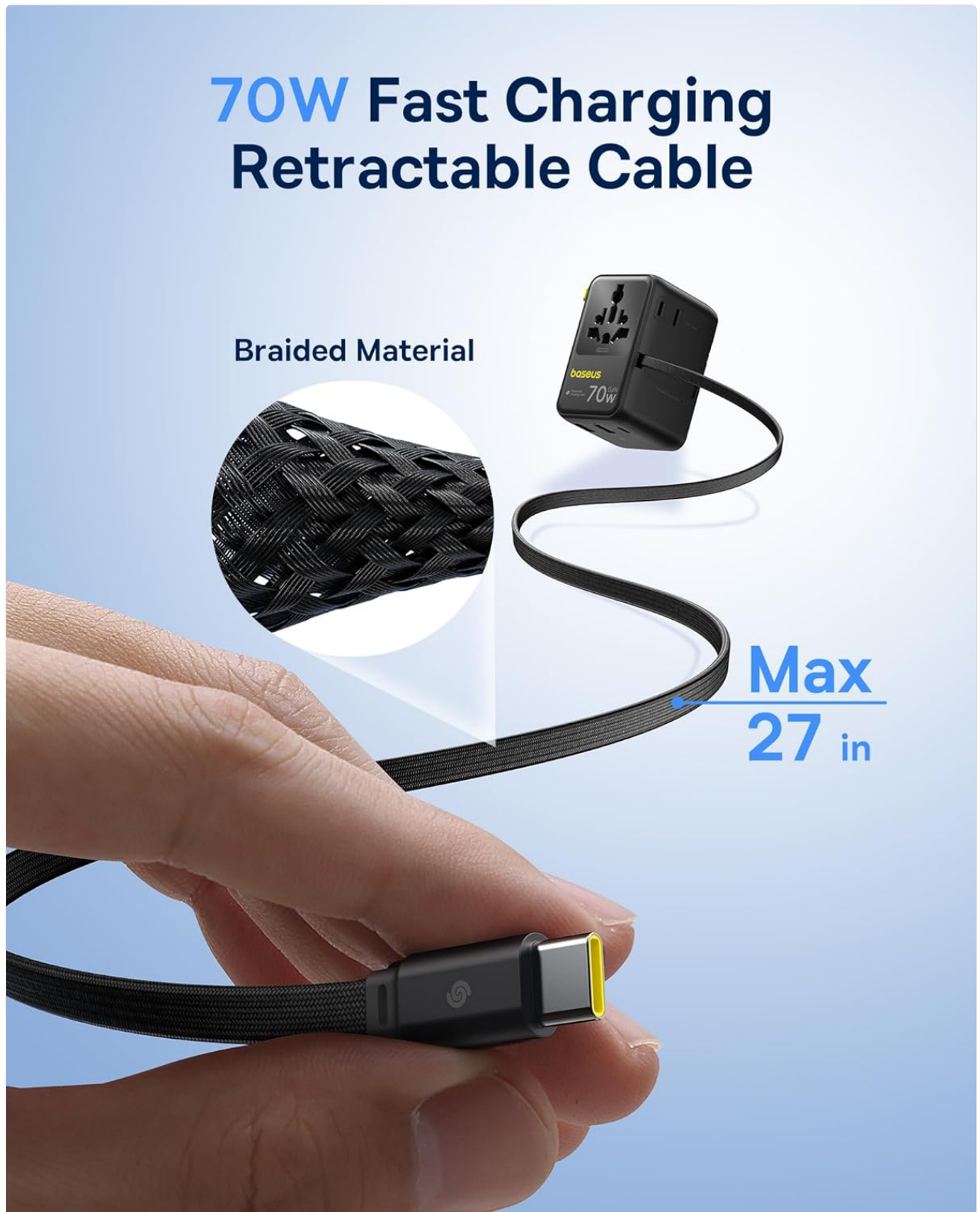
Image: A hand demonstrating the extension of the 70W fast charging retractable USB-C cable from the travel adapter, highlighting its braided material.