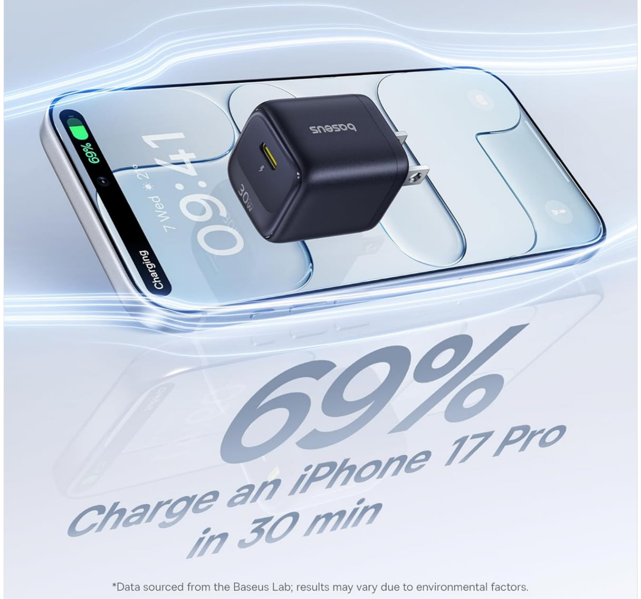
Image: An iPhone 17 Pro displaying 69% charge after 30 minutes, connected to the Baseus 30W fast charger.