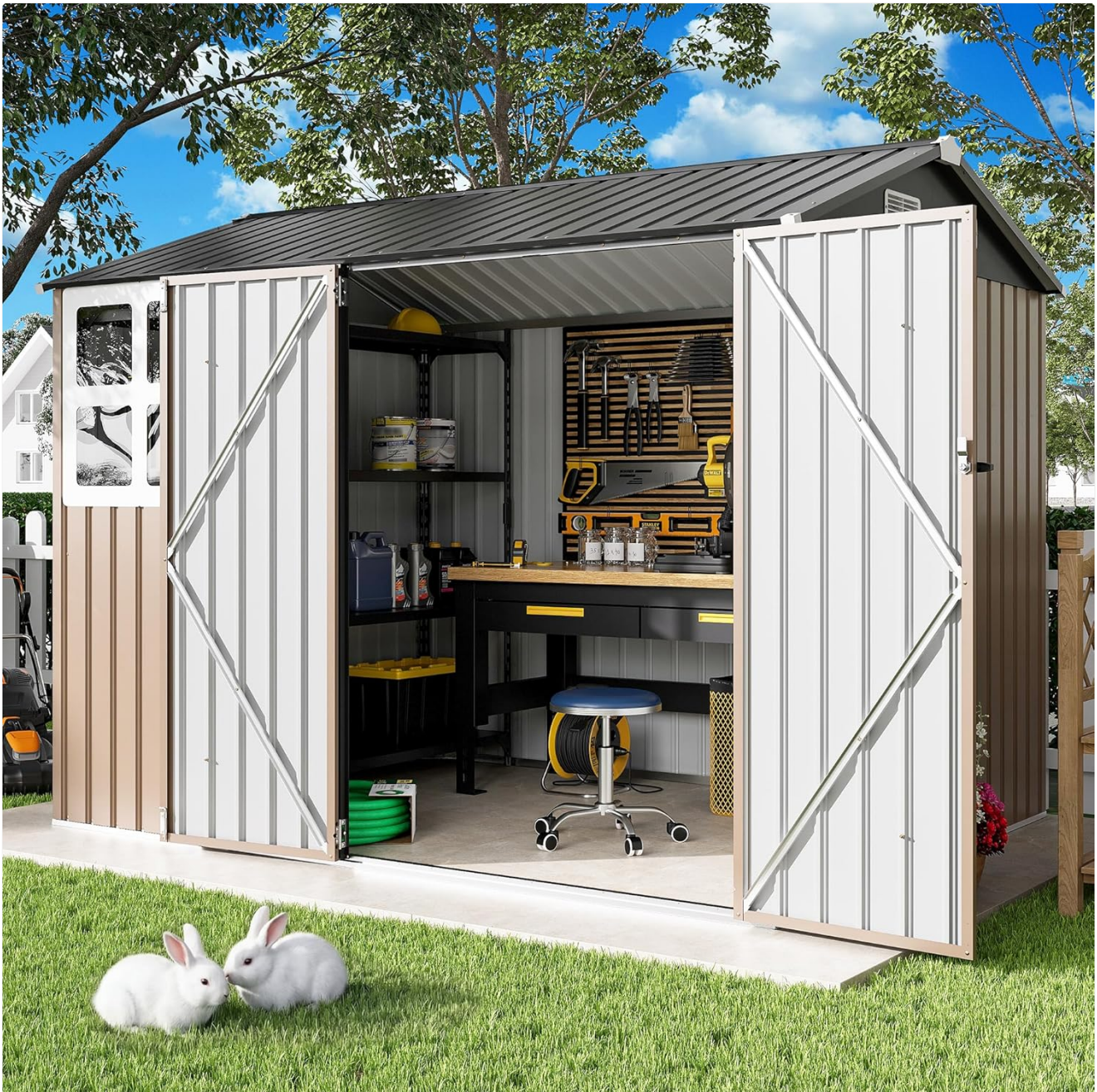
Image 3.3: The shed's interior configured with a workbench and shelving, demonstrating its capacity for organized tool storage.