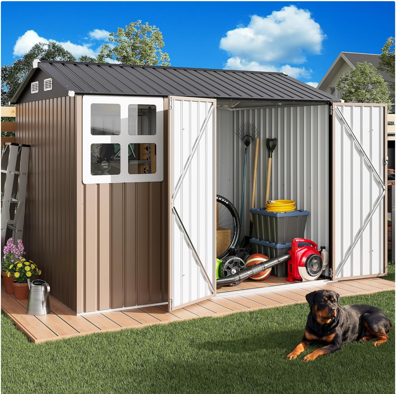
Image 1.1: The IRONCK 8x6FT Outdoor Storage Shed, showcasing its design and capacity for various items in a backyard environment.