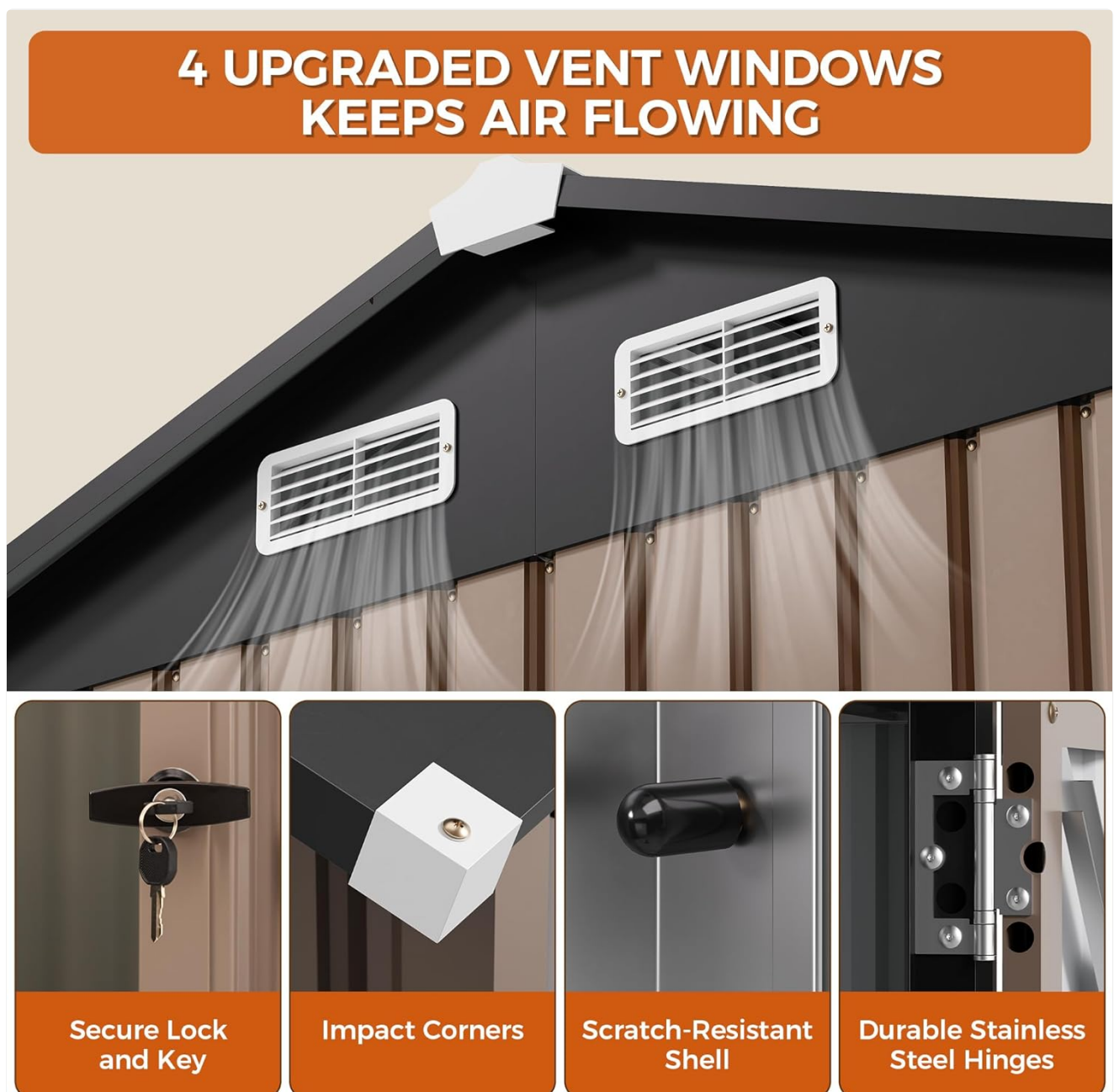
Image 3.1: Details of the shed's security features, including the lock and key, and durable construction elements.