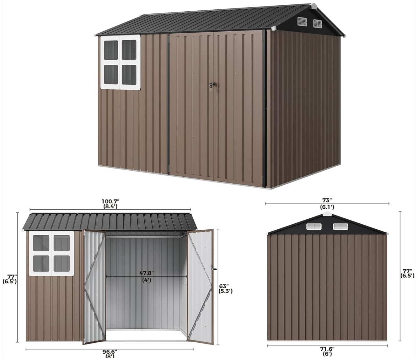
Image 2.1: Product dimensions and structural layout for planning your installation space.