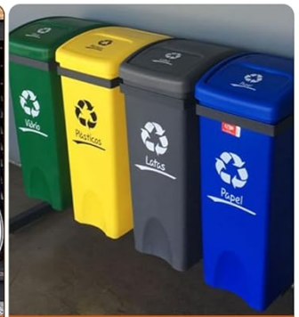
Tidy Bins Storage