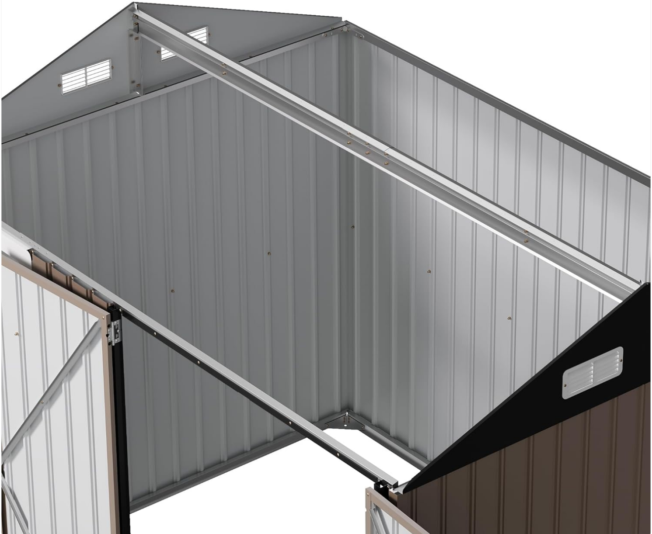
Image 2.2: The shed's heavy-duty crossbeam, illustrating the reinforced galvanized steel frame for structural integrity.

500µm Galvanized Steel Frame Reinforced Structure