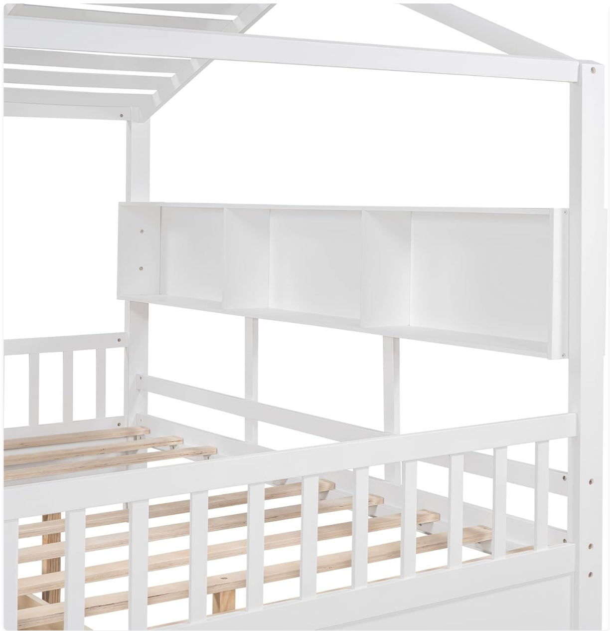
Close-up view of the integrated bookshelf.