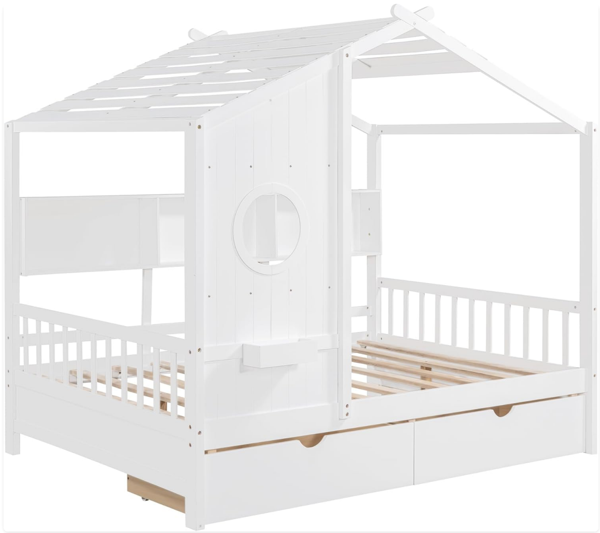
View of the bed with storage drawers extended.