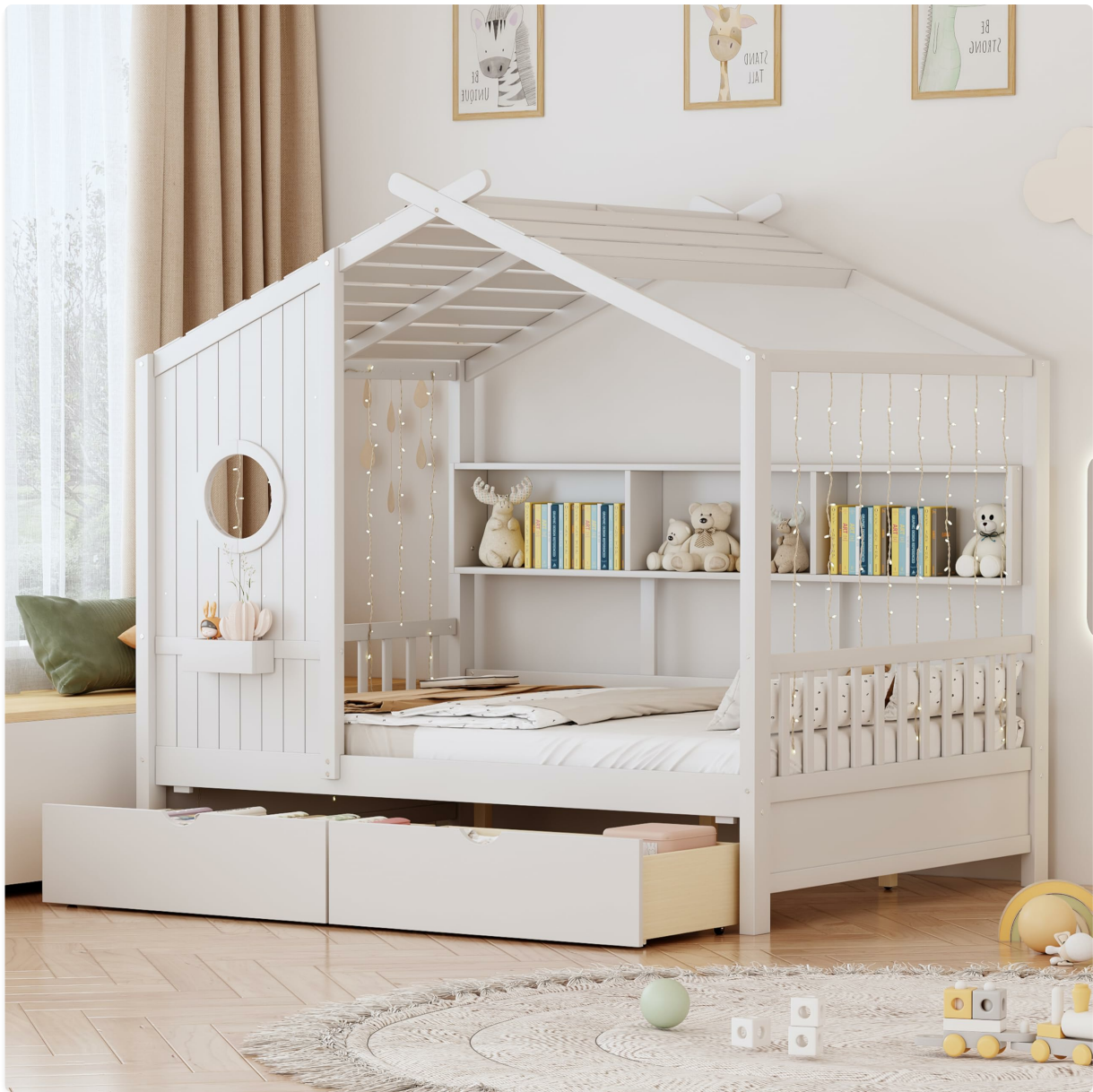
Overall view of the Bellemave Full Size House Bed with Storage Drawers.