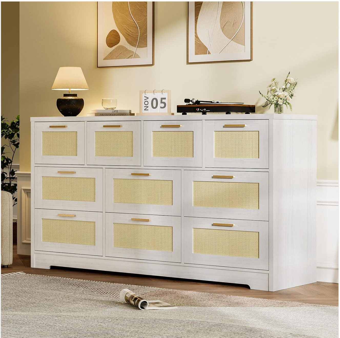
Image 1.1: The Patikuin Modern Farmhouse Rattan 10 Drawer Dresser in a living room environment.