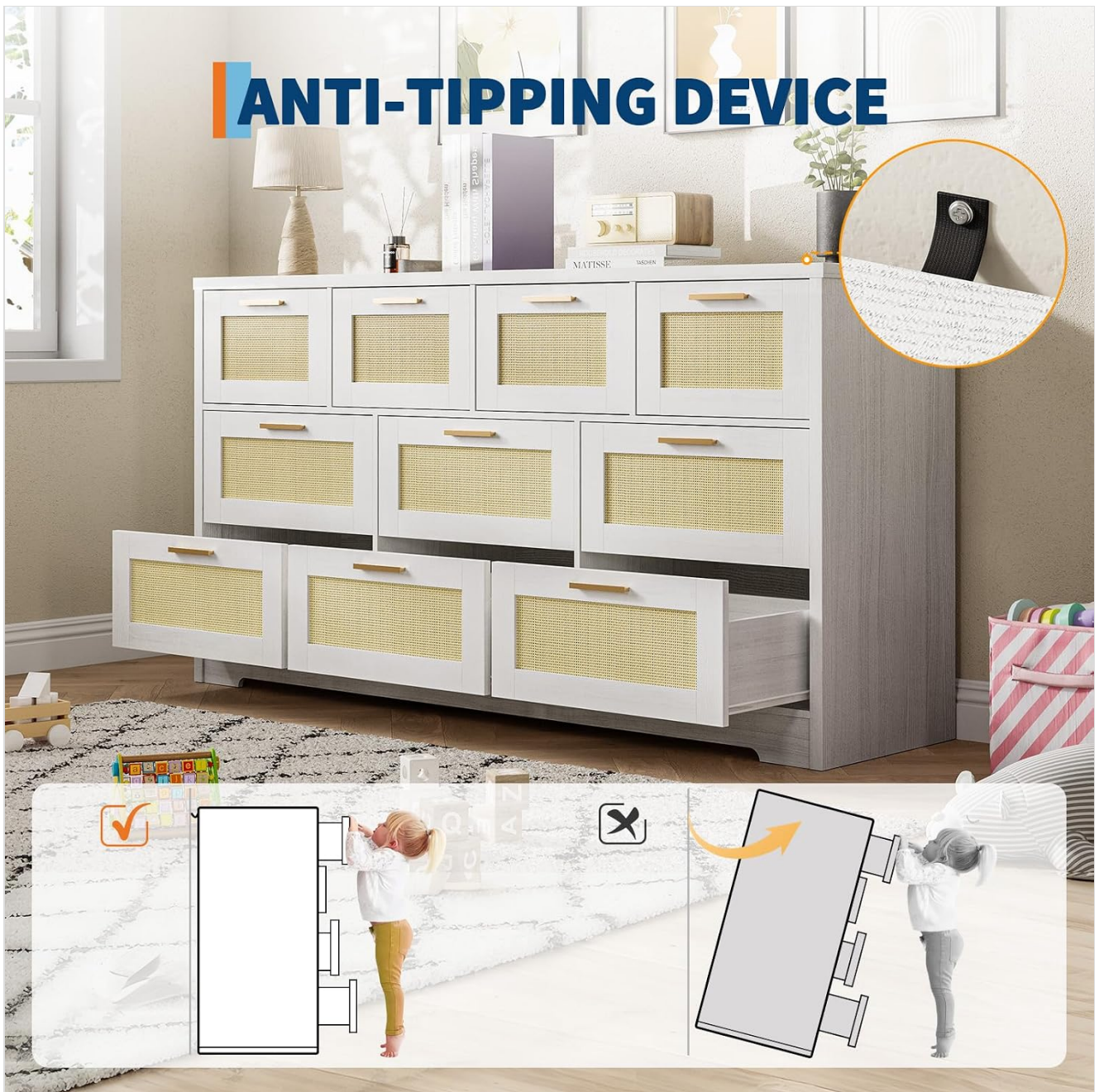
Image 2.1: Visual guide demonstrating the proper installation of the anti-tipping device and the risks associated with not securing the dresser.