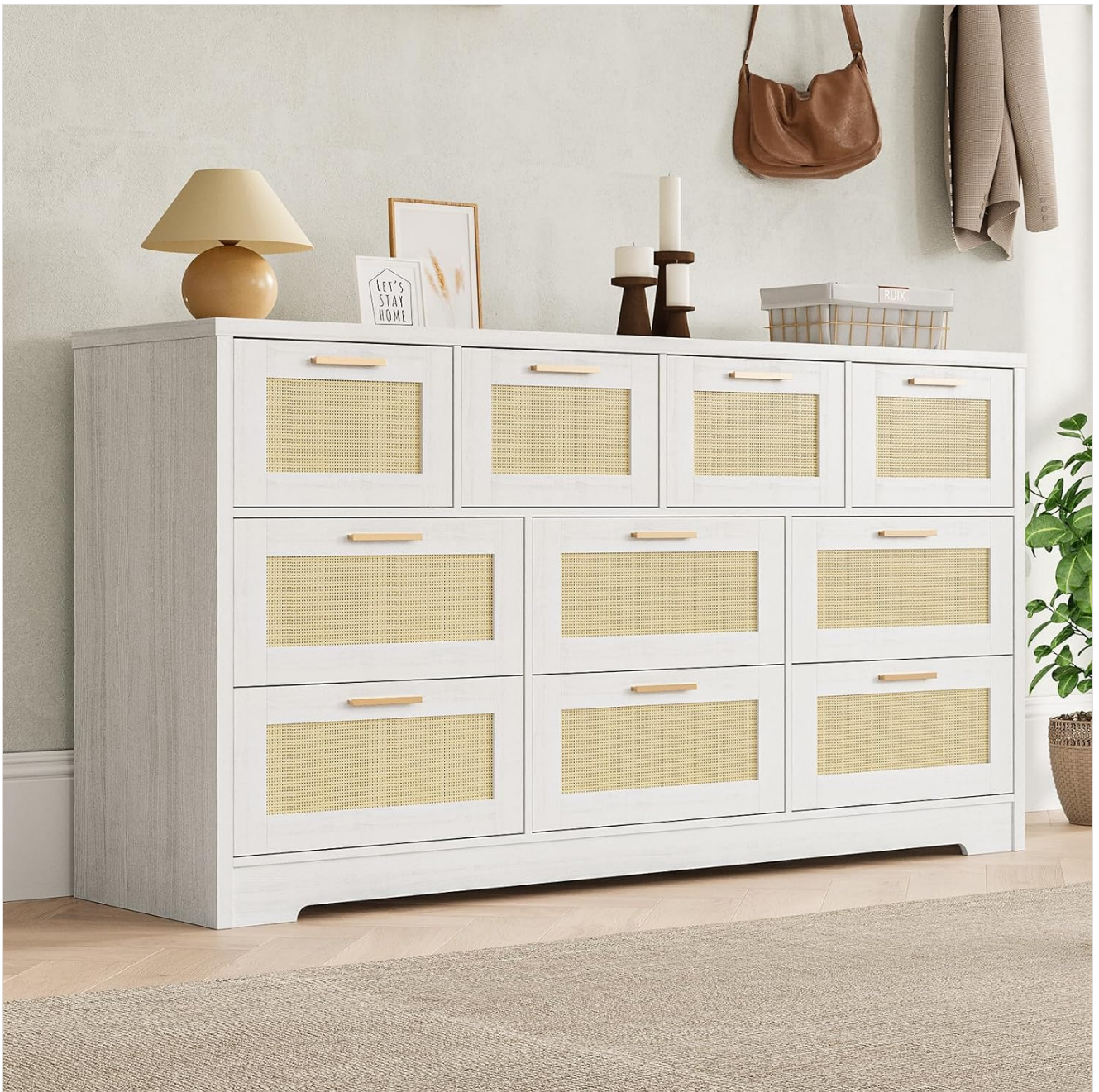
Image 4.1: Detailed view of key components including the golden metal handles, rattan drawer fronts, smooth drawer slides, and the stable wooden base, which are integral to assembly.