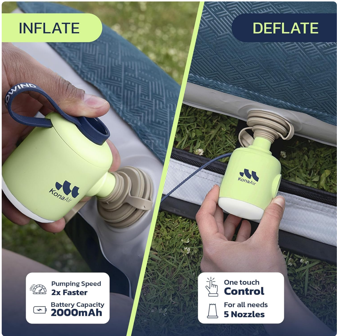
Quickly deflate air mattresses and other inflatables for easy packing and storage.