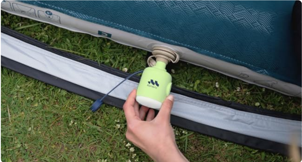
The deflation function helps to quickly remove air, making packing up your camp simple and fast.