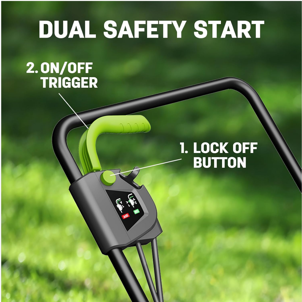
Image: A close-up showing the lock-off button and ON/OFF trigger on the mower's handle, illustrating the dual safety start feature.