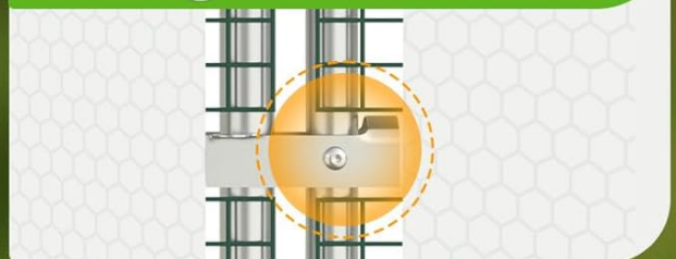
Figure 4.4: The dual-latch door mechanism provides secure closure against predators.