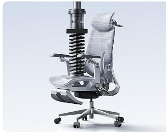
Image: Visual guide to the 4D dual-axis headrest, detailing its vertical, depth, and rotational adjustments for optimal neck support.