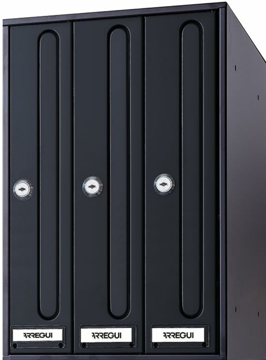
Image 1.1: ARREGUI Front Vertical Community Mailbox (3-unit configuration).