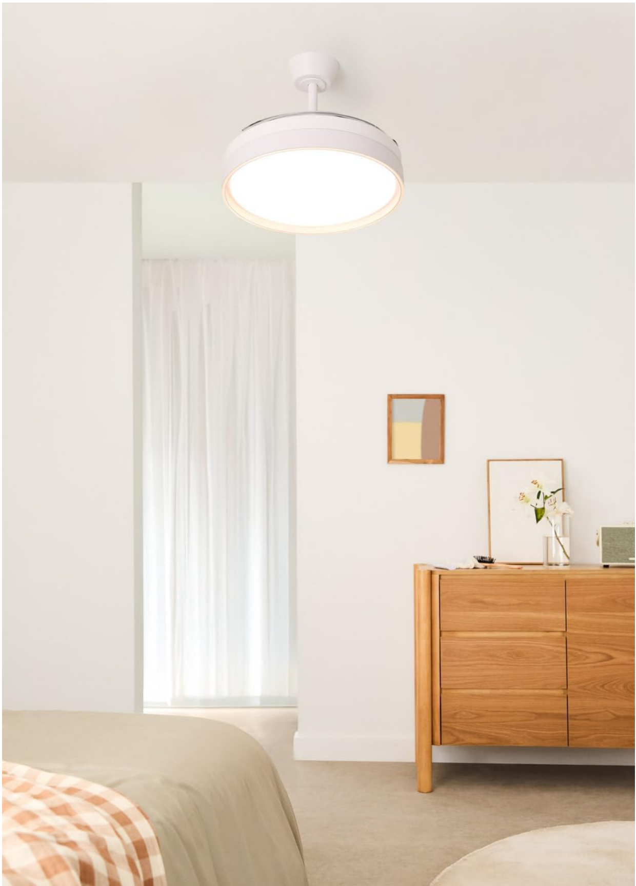
Image: The CREATE WIND CLEAR EDGE ceiling fan installed in a room, with its transparent blades fully retracted, making it appear as a modern ceiling light fixture. The light is on.