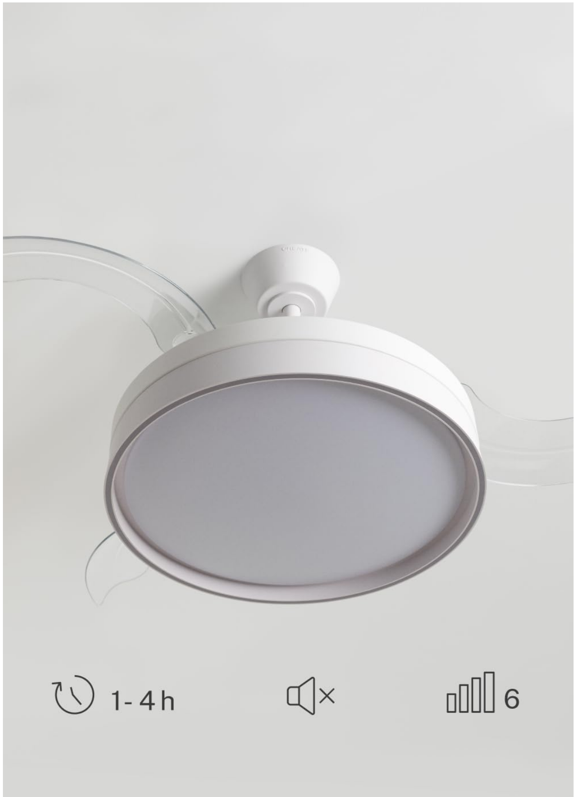
Image: A graphic illustrating key features: a timer icon with "1-4h" indicating programmable operation, a crossed-out speaker icon for silent operation, and a bar graph icon with "6" for the six-speed motor.