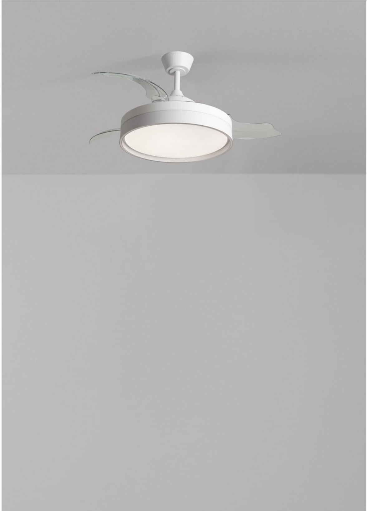
Image: The CREATE WIND CLEAR EDGE ceiling fan with its transparent blades fully extended, viewed from below, ready for operation. The central light fixture is illuminated.