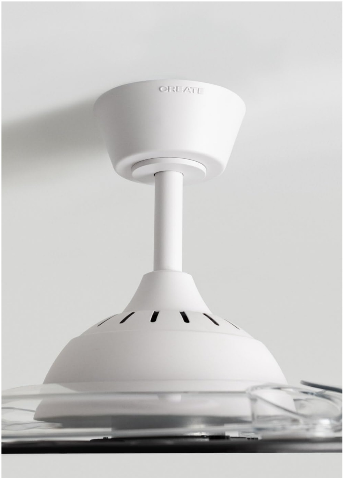
Image: Close-up view of the fan's ceiling mount and downrod, showing the connection point to the ceiling. The 'CREATE' brand name is visible on the canopy.