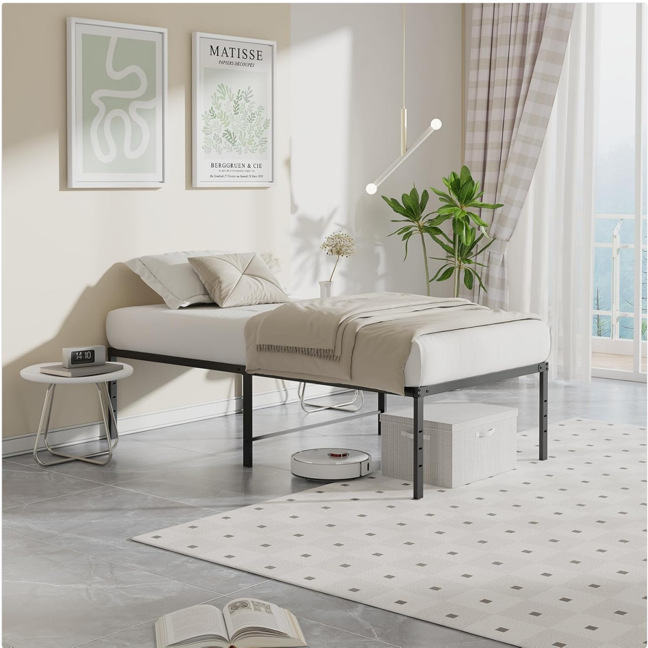
Image: The bed frame demonstrating its 18-inch under-bed clearance, ideal for storage solutions.