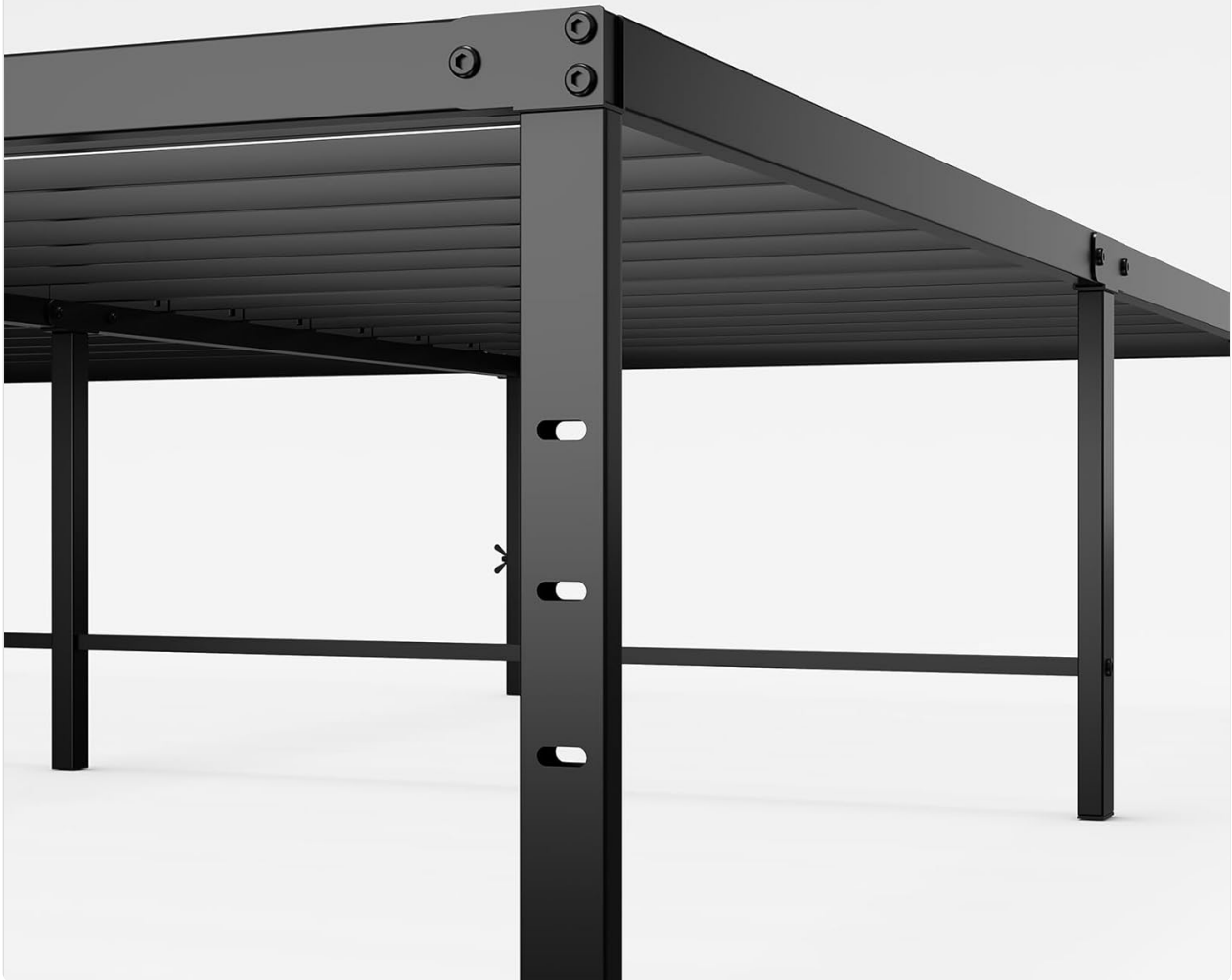
Image: A close-up of a bed frame leg, highlighting the pre-drilled holes for attaching a headboard or footboard.