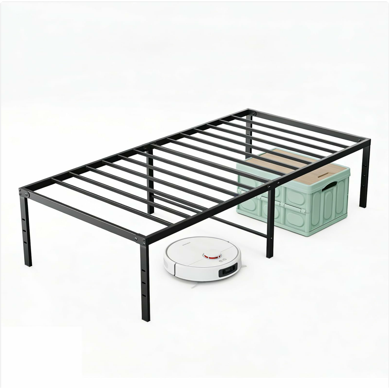
Image: The Sweetcrispy Twin Size 18 Inch Platform Bed Frame, showcasing its minimalist design and under-bed clearance in a modern bedroom.