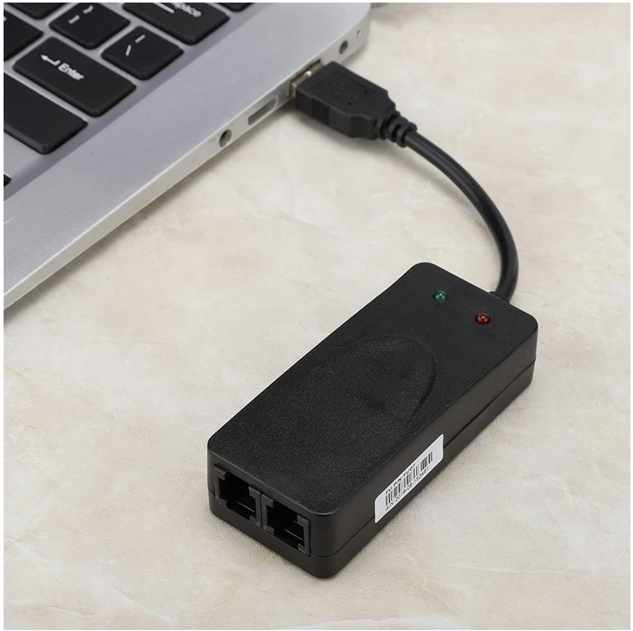
Figure 6: Modem connected to a laptop.