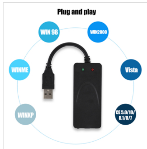
Figure 1: Overview of modem features.