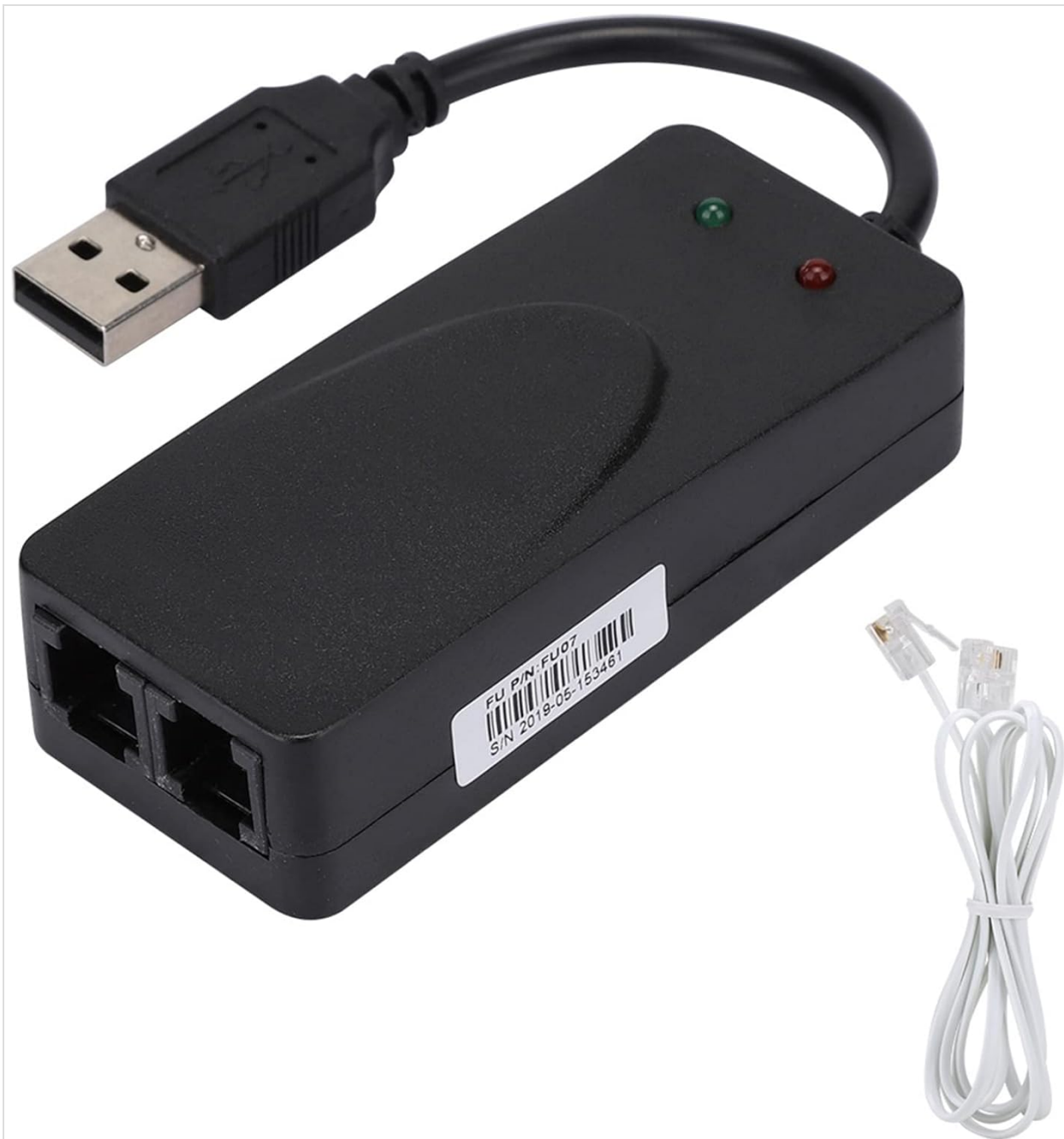
Figure 4: Modem connected to a phone line.