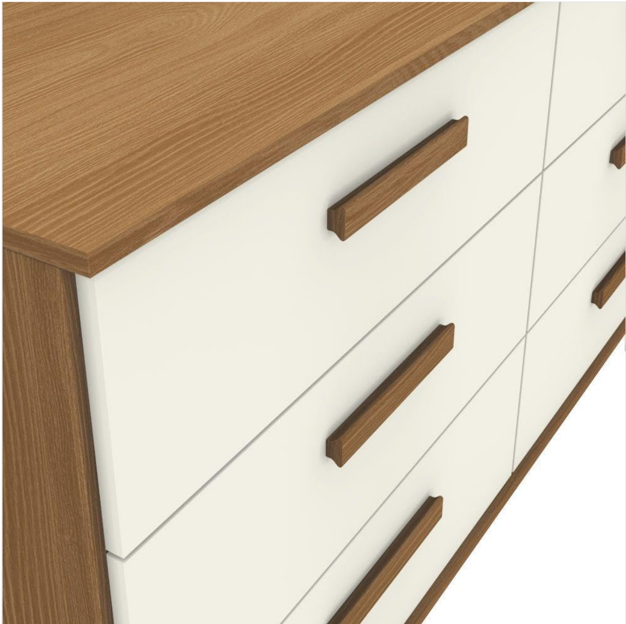
Figure 5.1: Detail of the drawer fronts and handles.