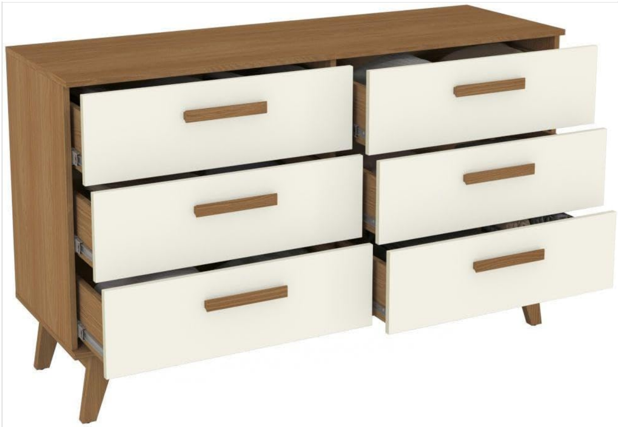
Figure 3.1: Kappesberg T268 Chest of Drawers with drawers open, illustrating storage capacity.