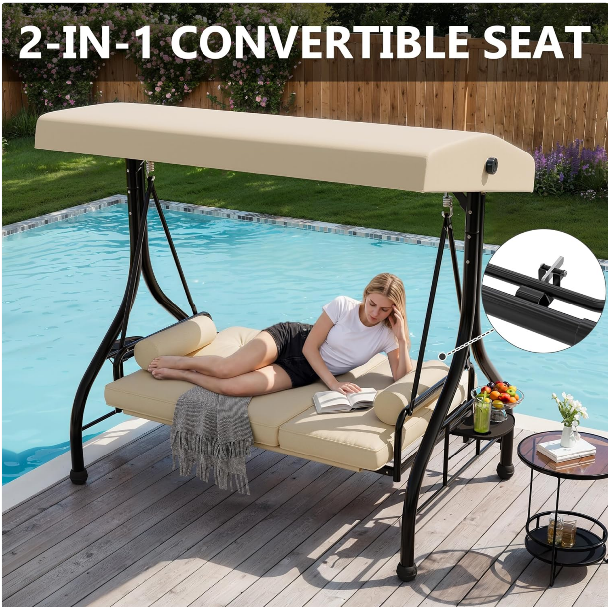
Figure 5: Swing seat in reclined position.