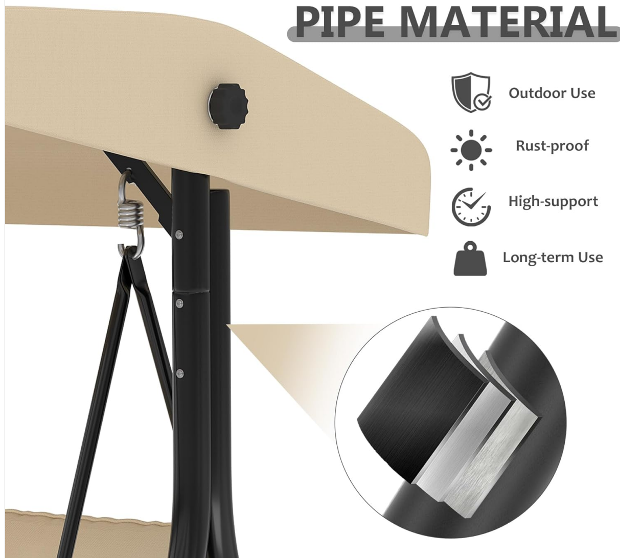
Figure 6: Thickened pipe material for durability.