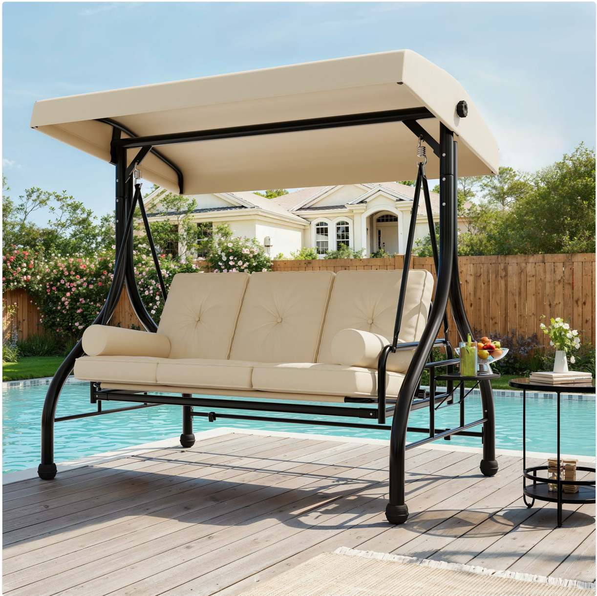
Figure 1: Garvee 3-Seat Outdoor Porch Swing with Khaki Canopy.

This porch swing is constructed with a heavy-duty powder-coated steel frame for stability and rust resistance, supporting up to 800 lbs. The canopy is made from UV-resistant fabric and can be tilted to various angles to provide optimal shade throughout the day. The seat cushions are designed for comfort, and the backrest can be adjusted to a 180-degree recline, transforming the swing into a lounge bed. Two foldable side trays offer convenient storage for beverages and small items.