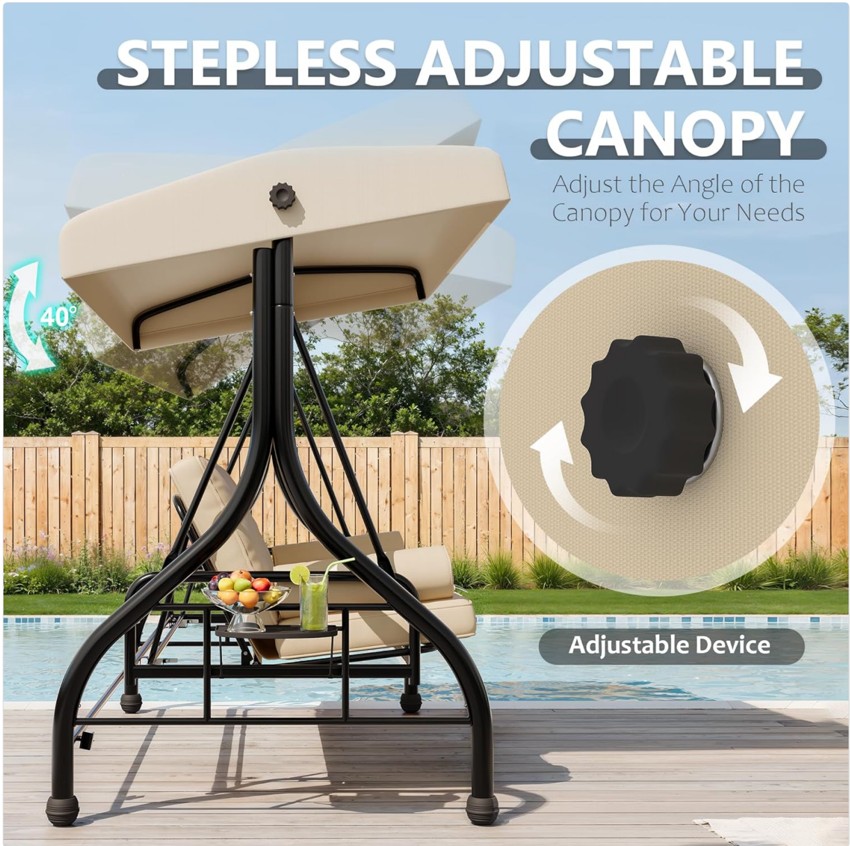
Figure 4: Canopy adjustment mechanism.