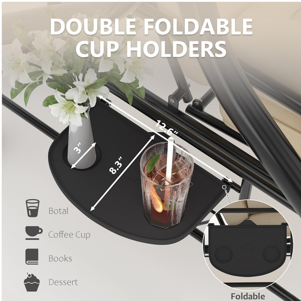
Figure 3: Detail of the foldable cup holder trays.