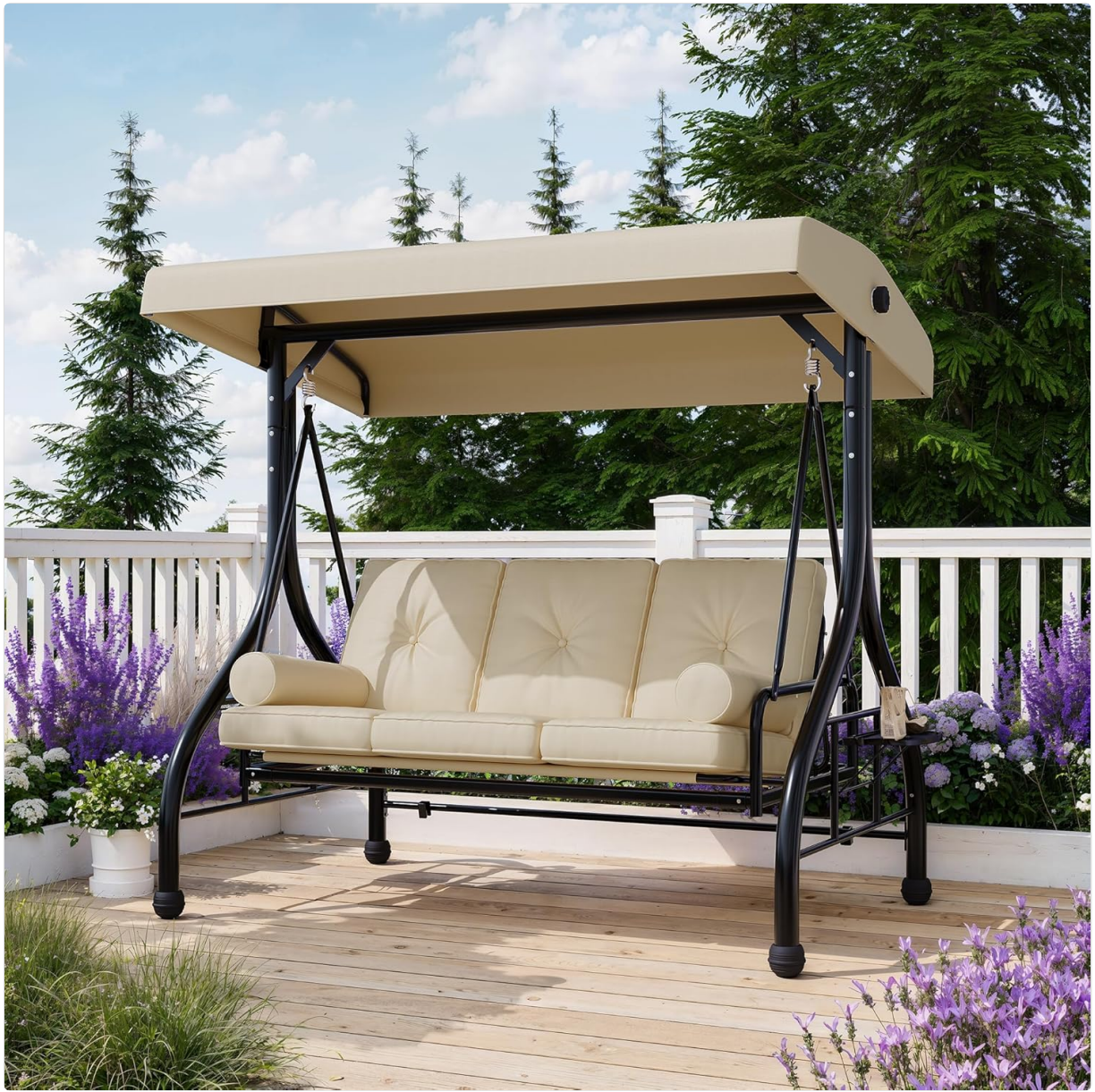
Figure 2: Assembled Garvee Outdoor Porch Swing.