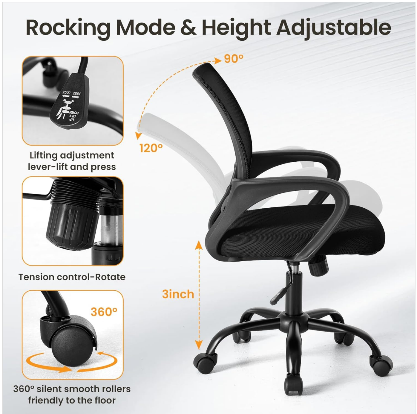
Figure 2: Product dimensions and components overview.