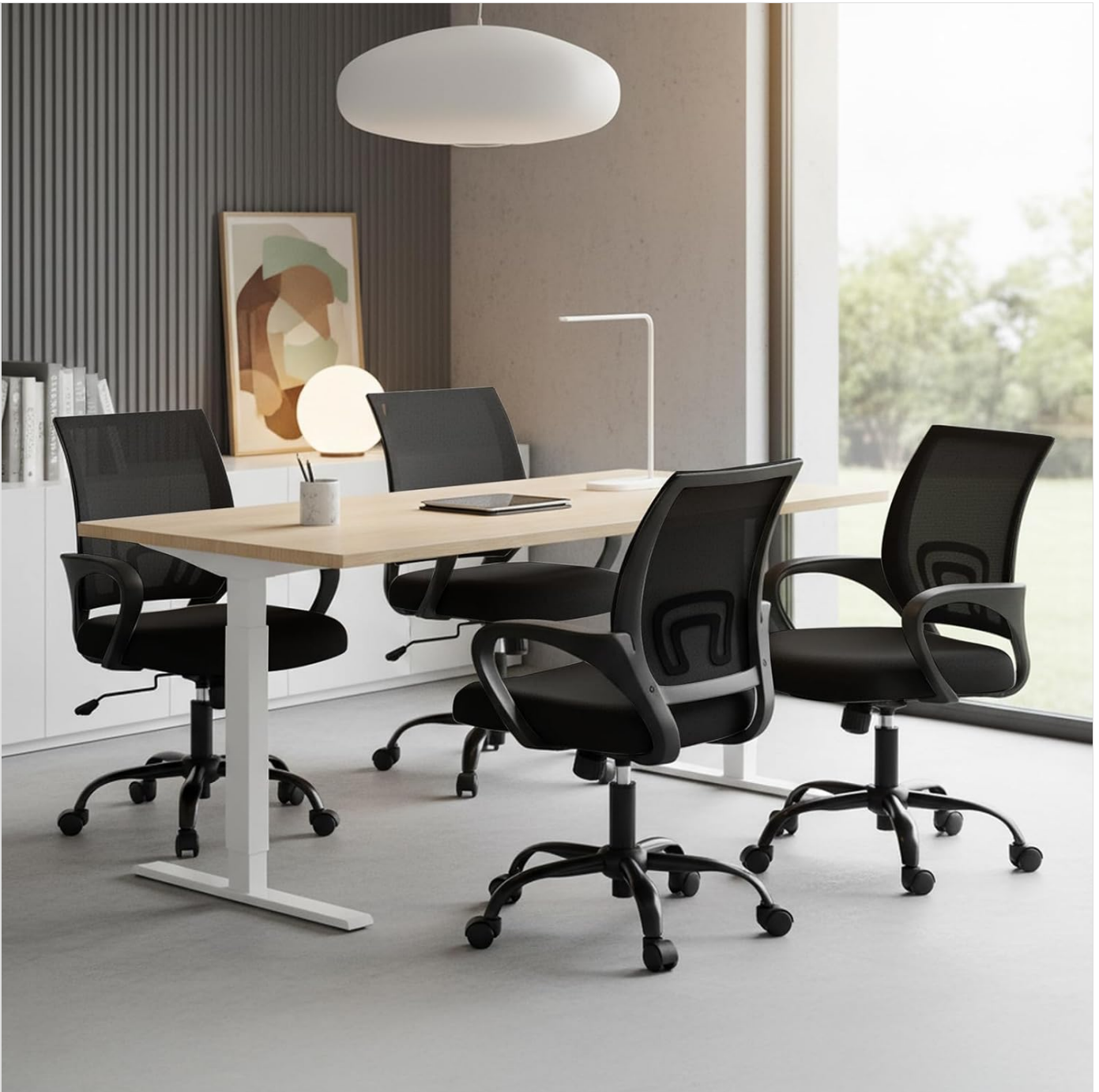
Figure 5: Breathable mesh back and high-resilience foam seat construction.