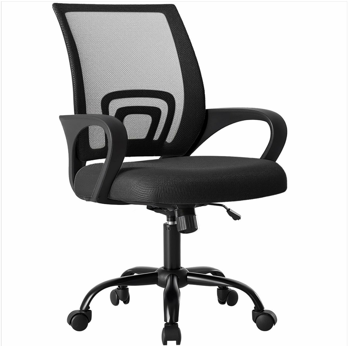
Figure 1: OLIXIS Office Desk Chair (Model 1411BK2-HJ3Nsun)