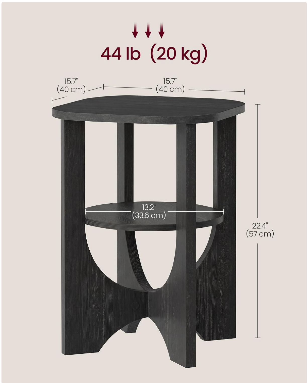
Image: Technical diagram illustrating the dimensions and maximum load capacity of the table.