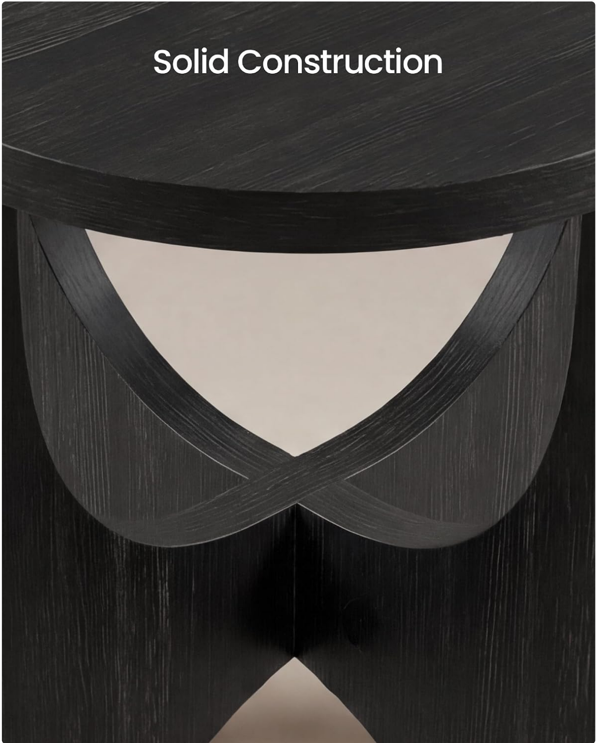
Image: Close-up view of the table's solid construction, highlighting the interlocking leg design.