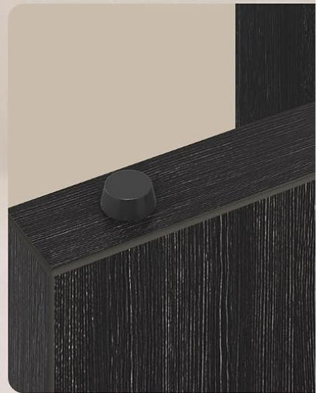
Protective Foot Pads

Image: Detail view showing the elegant finish of the table surface and the protective foot pads on the legs.