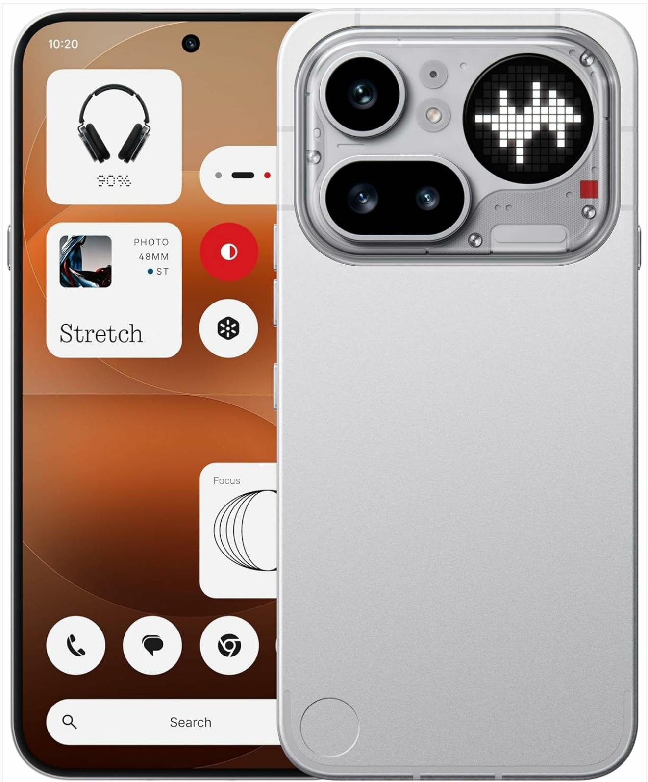
Figure 1.1: Front view of the Nothing Phone (4a) Pro. This image displays the sleek design and full-screen display of the device.