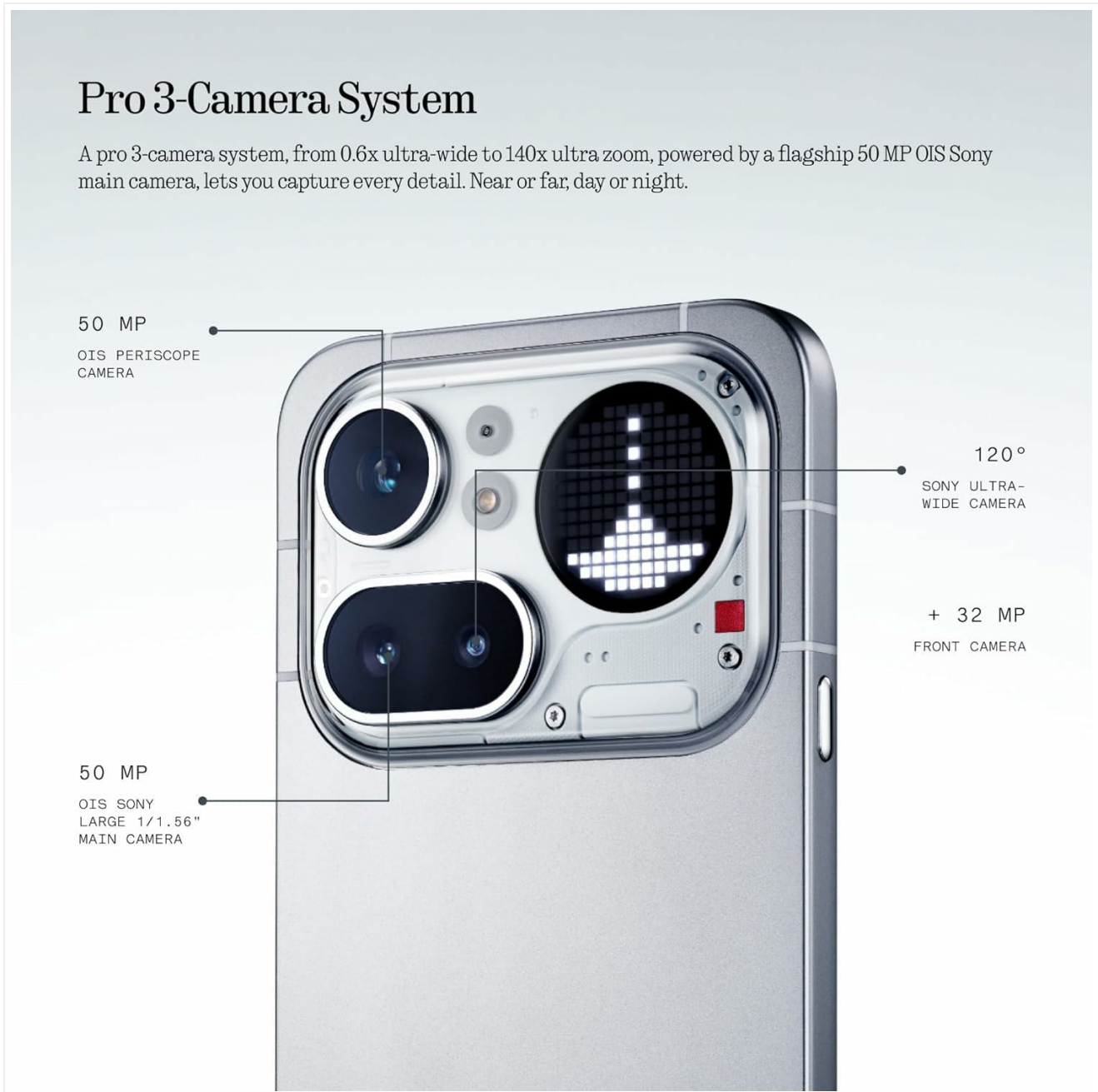
Figure 5.1: Diagram illustrating the Pro 3-Camera System of the Nothing Phone (4a) Pro, highlighting the 50 MP OIS Periscope Camera, 50 MP OIS Sony Main Camera, 120° Sony Ultra-Wide Camera, and 32 MP Front Camera.

The front camera features a 32MP sensor , supporting 1080p video recording at 30fps/60fps with Ultra XDR, ideal for selfies and video calls.