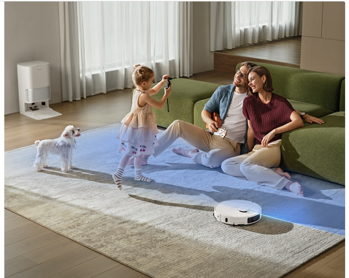
Image: Smart navigation ensures efficient and thorough coverage of your home.