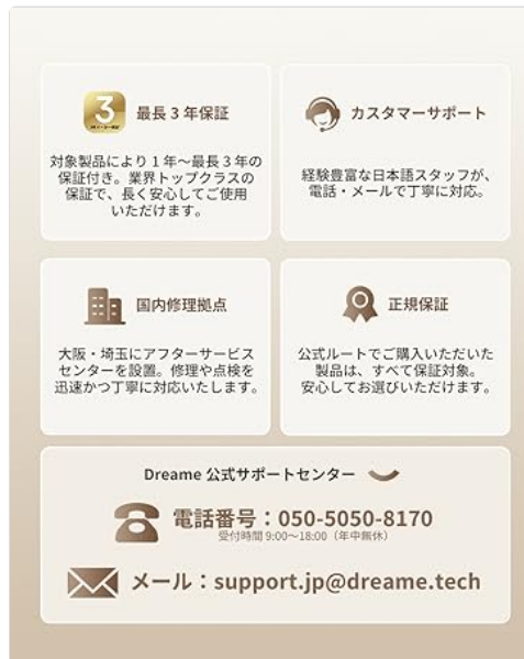
Image: Warranty and support information.

The dreame L10s Ultra Gen3 comes with a warranty period of up to 3 years, depending on the specific product. Please refer to the official Dreame website for detailed warranty terms and conditions.