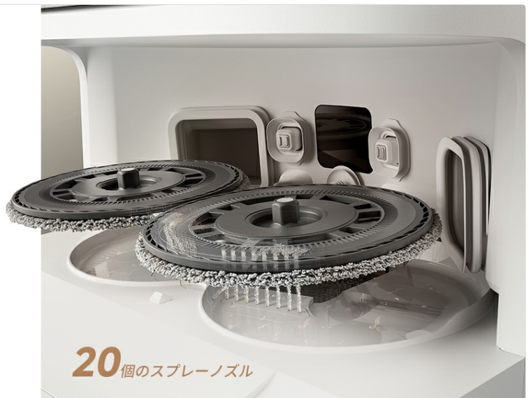
Image: The integrated spray cleaning system keeps mop pads clean.