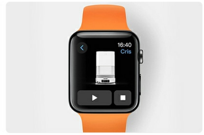
Apple Watch コントロール 腕時計から簡単操作。

*Alexa、Siri、Google Home：これらのサードパーティサービスには、音声テクノロジー搭載のデバイスが必要です。