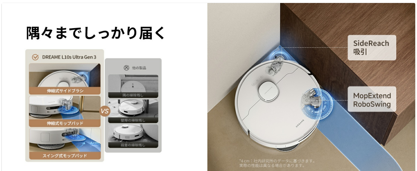
Image: The extendable side brush and mop ensure thorough cleaning along edges and in corners.