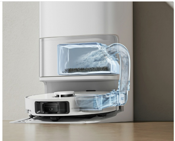
Image: Automatic dust collection for up to 100 days.

*100 日間：社内研究所のデータに基づきます。実際の性能は異なる場合があります。