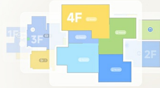
Image: The robot supports mapping for multiple floors.

家のレイアウトに合わせて掃除ルートを調整。4フロアまで正確にマッピングできます。1回セットすれば、あとはロボット掃除機が完璧に掃除してくれます。