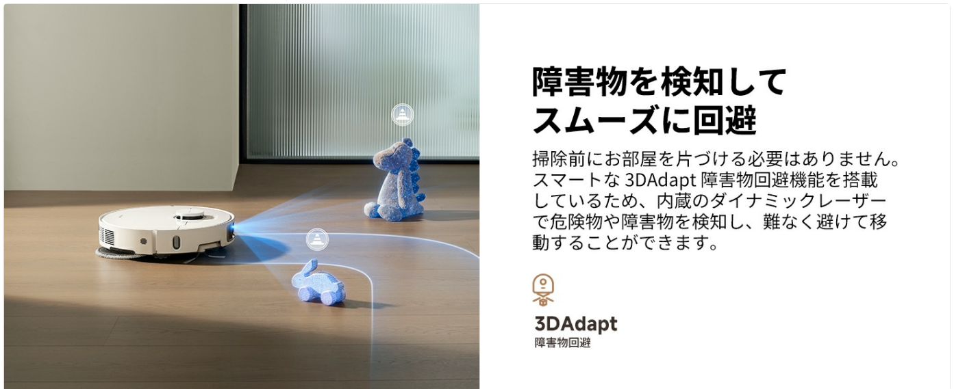
Image: The robot detects and smoothly avoids obstacles.