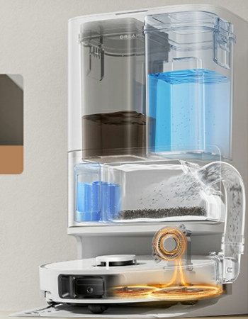
Image: The multi-functional PowerDock base station.

*100 日分：社内研究所のデータに基づきます。実際の性能は異なる場合があります。 *洗浄液の自動補充：必ず純正の洗浄液をお使いください。それ以外の洗浄液を使用した場合、故障の原因になることがあります。