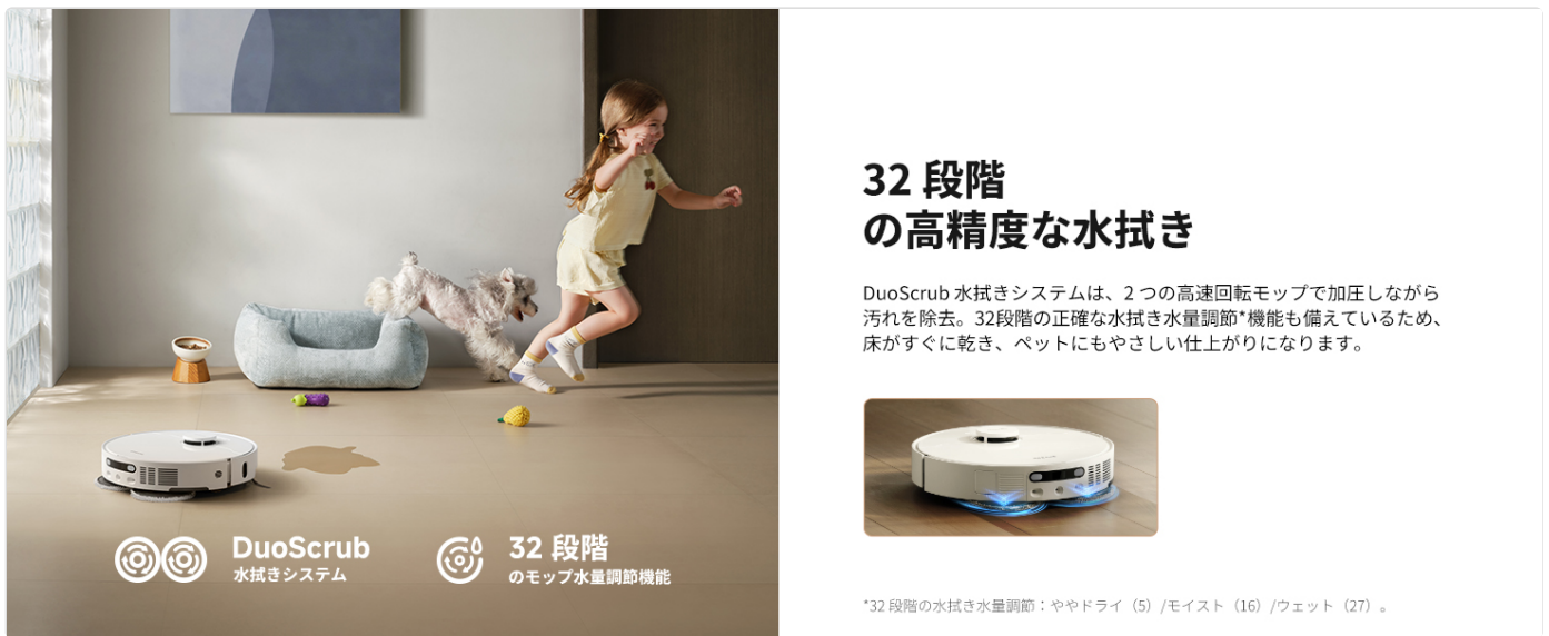
Image: The robot vacuum's mopping function in action.