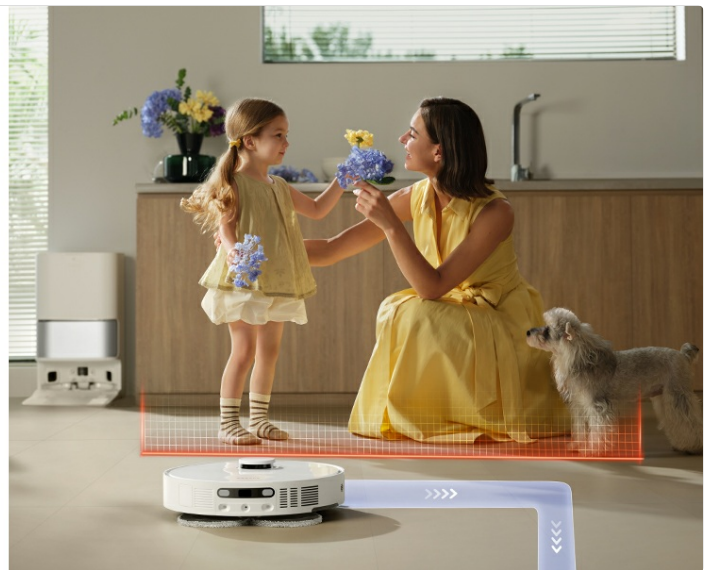
Image: Easily set restricted zones via the app.