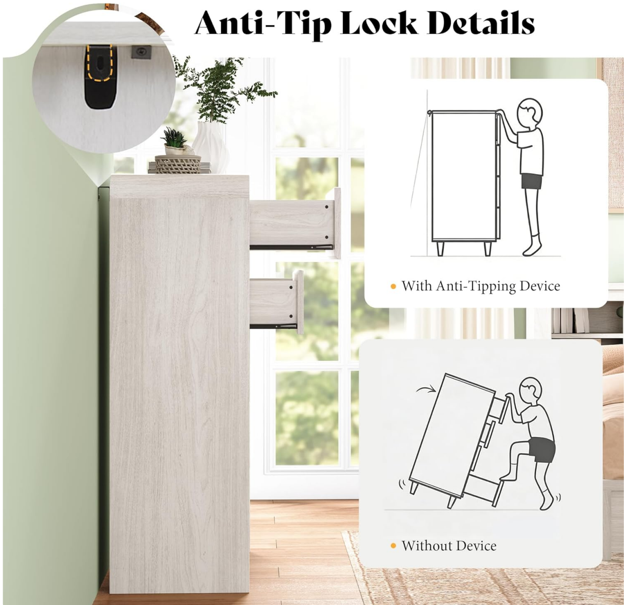
Image: Anti-Tip Lock Details. This image illustrates the proper installation of the anti-tip device and demonstrates the risk of tip-over without it, emphasizing safety.

Video: Elegant Harmonious Bedroom Set. This video demonstrates the quiet operation of the drawers and highlights the anti-tip feature for enhanced safety.