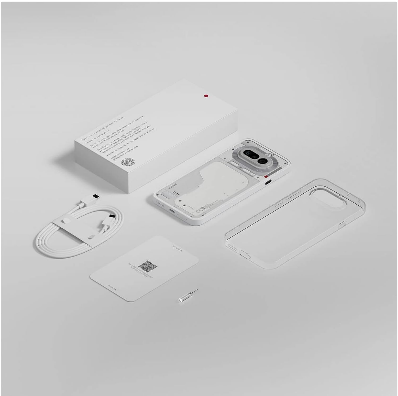
Image: Unboxed Nothing Phone 4a components, including the device, charging cable, and user guide.