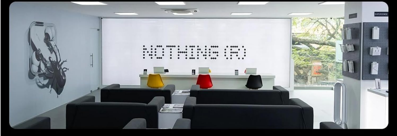
Image: Nothing Support contact information and service statistics.