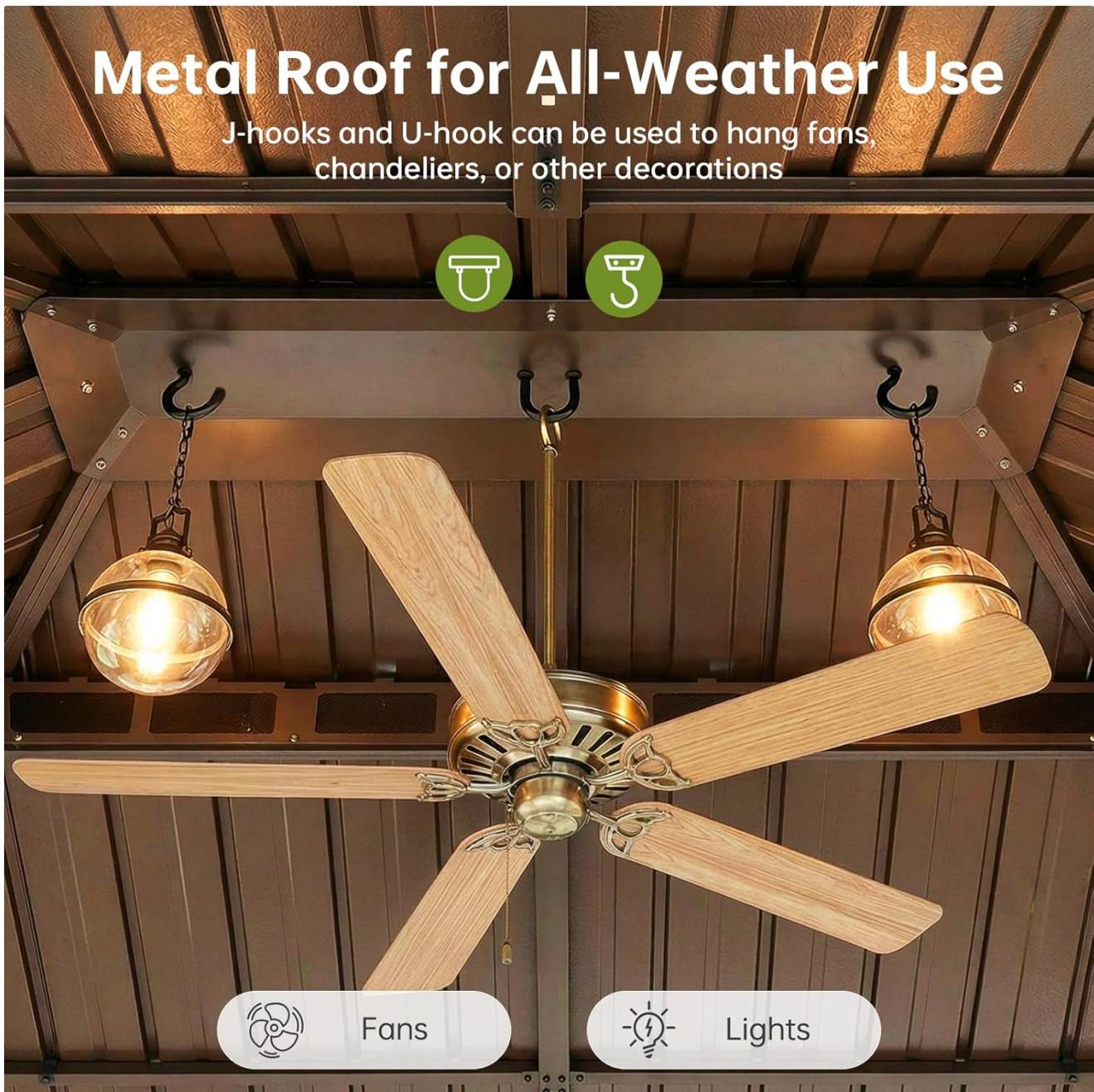
Image: Close-up view of the sturdy J-hooks and U-hooks integrated into the roof for hanging accessories like fans and lights.

The gazebo roof structure includes J-hooks and U-hooks for hanging lights, fans, or other decorations. Ensure any hung items do not exceed the weight capacity specified in the detailed product manual.