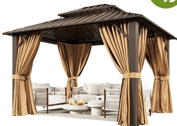
Image: Details of the double-layer curtain design, highlighting tough mesh, double track system, and anti-drop hooks.