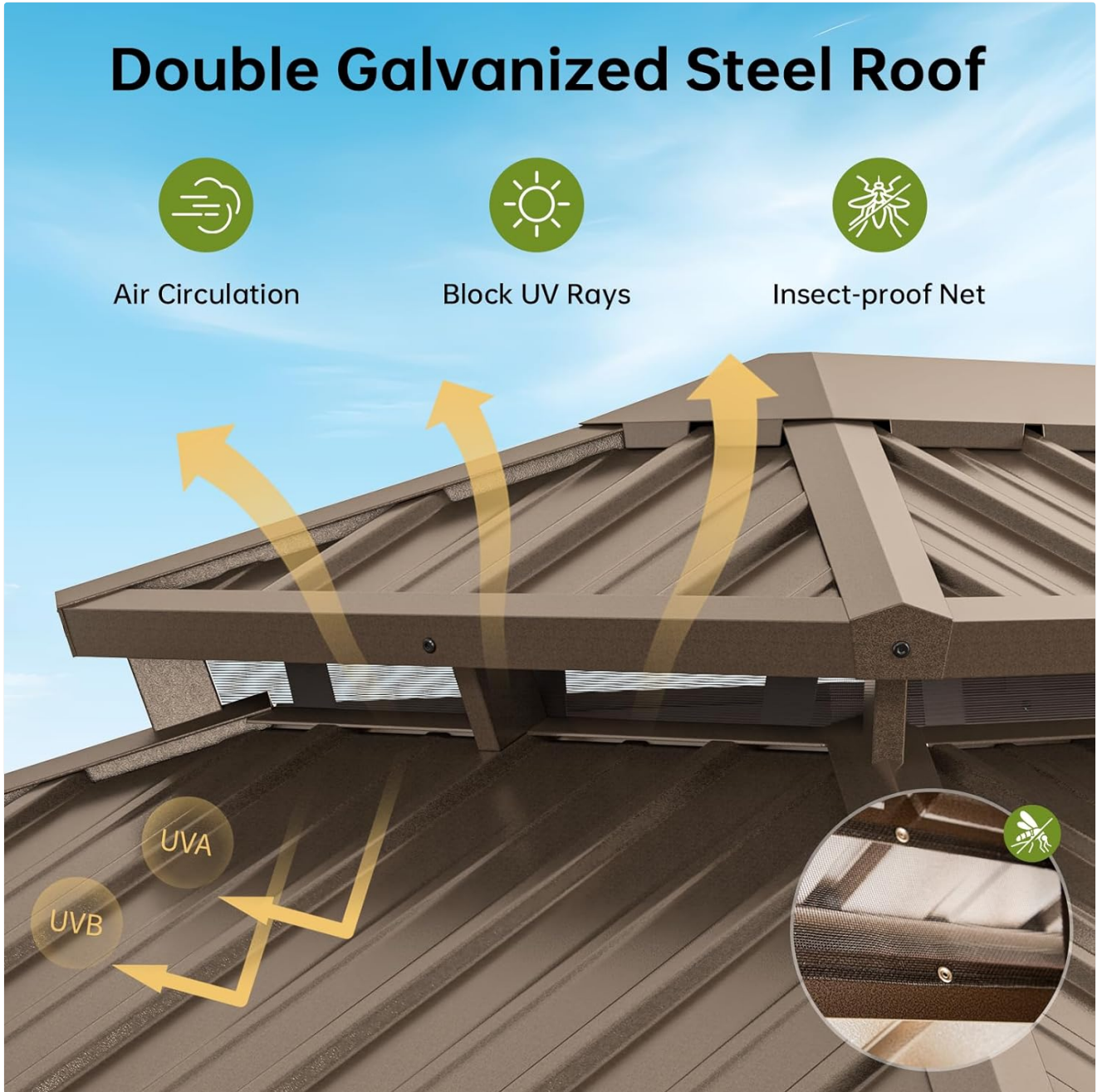
Image: Diagram illustrating air circulation, UV ray blocking, and insect-proof netting features of the double galvanized steel roof.

The double-layer galvanized steel roof is designed for optimal air circulation, UV protection, and weather resistance. The sloped design facilitates water drainage, and the robust construction can withstand up to 6 inches of snow and winds up to 38 mph.