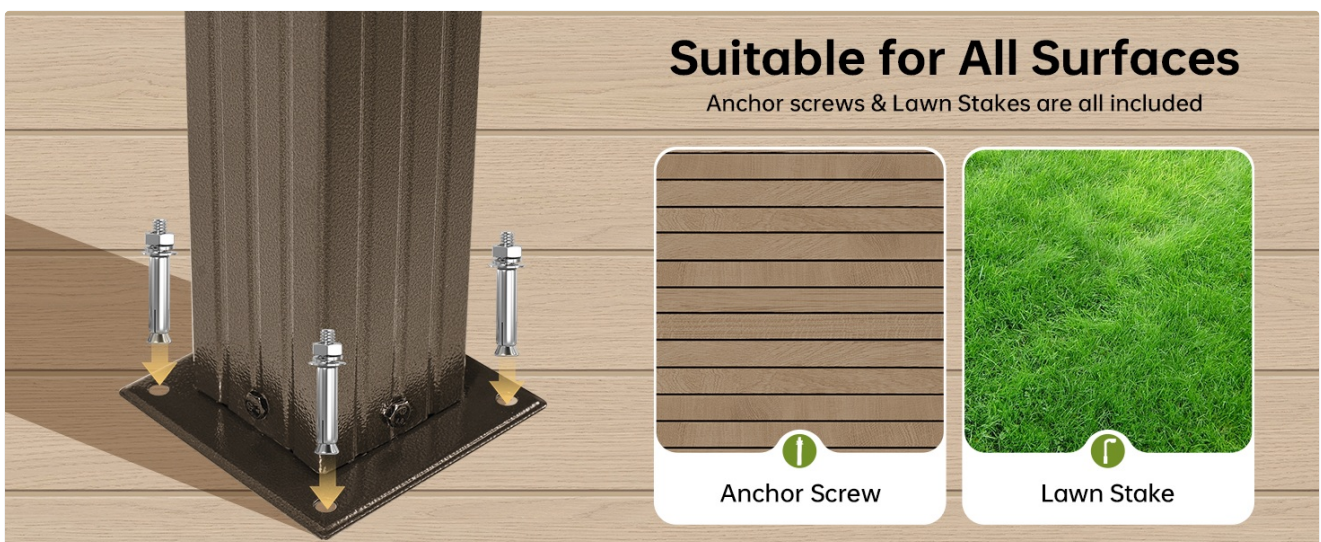
Image: Demonstrates anchoring options for various surfaces, including anchor screws for decks and lawn stakes for grass.