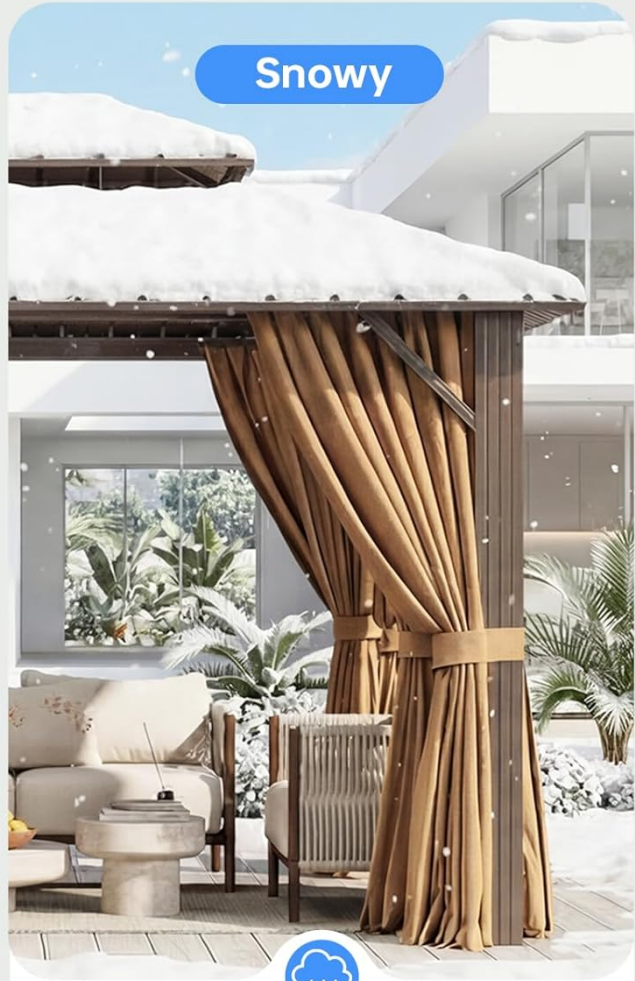
Withstand 6 in of snow

Image: Visual representation of the metal roof's performance in rainy conditions (sloped drainage) and snowy conditions (withstanding up to 6 inches of snow).