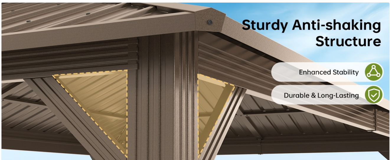
Image: Illustration of the sturdy anti-shaking structure with triangular column reinforcements for enhanced stability.

Video: Official assembly guide for the Breezestival 10x12FT Hardtop Gazebo, demonstrating key installation steps.