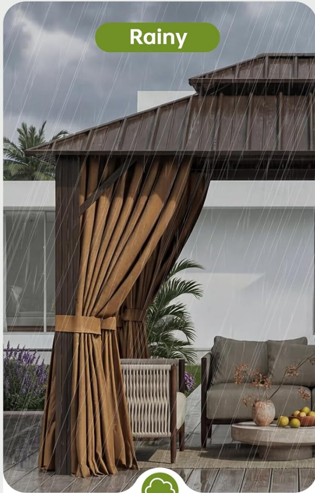
Sloped Roof Drainage