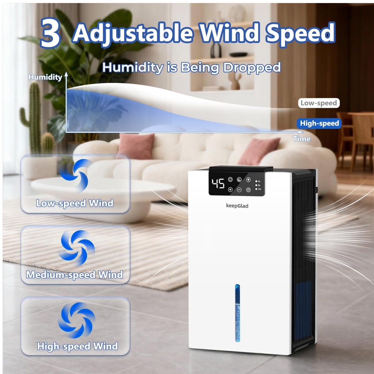
Figure 5.2: The dehumidifier offers three fan speeds for efficient moisture removal.