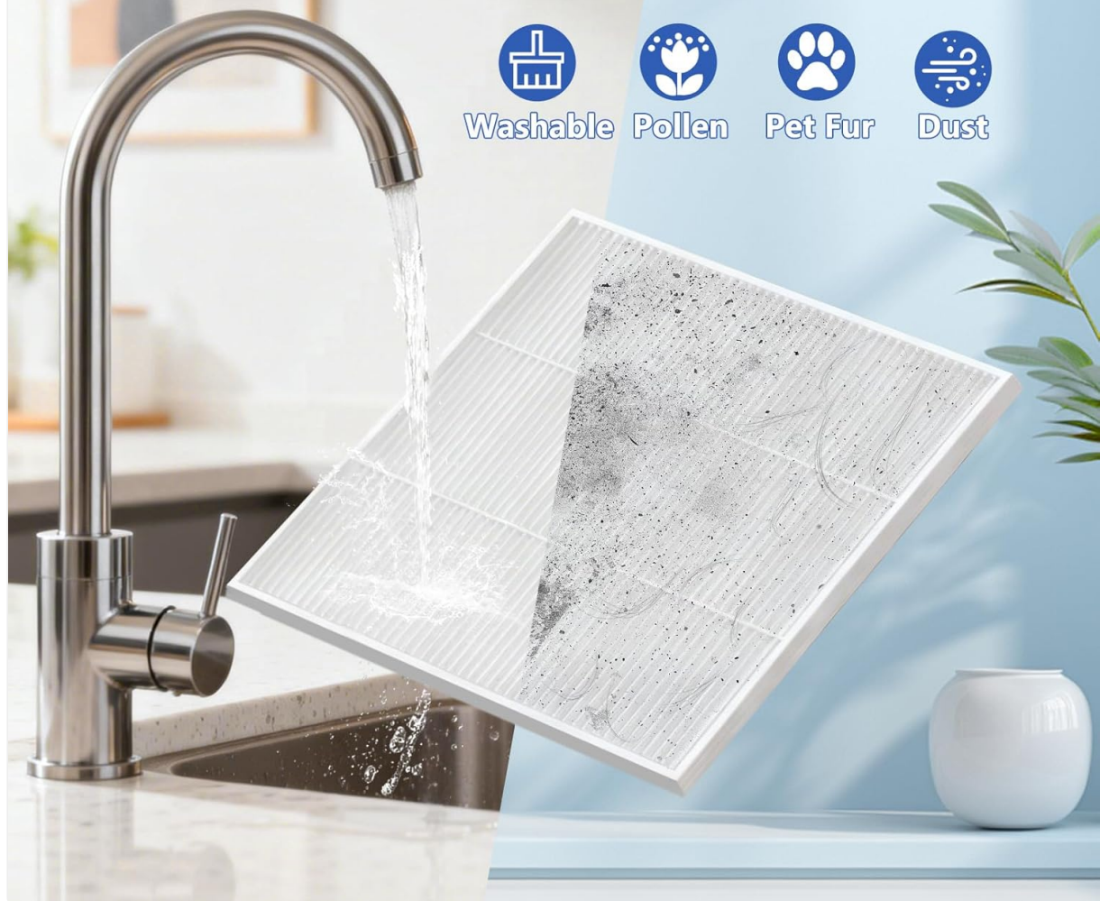
Figure 4.1: The reusable filter can be easily removed and washed for maintenance.