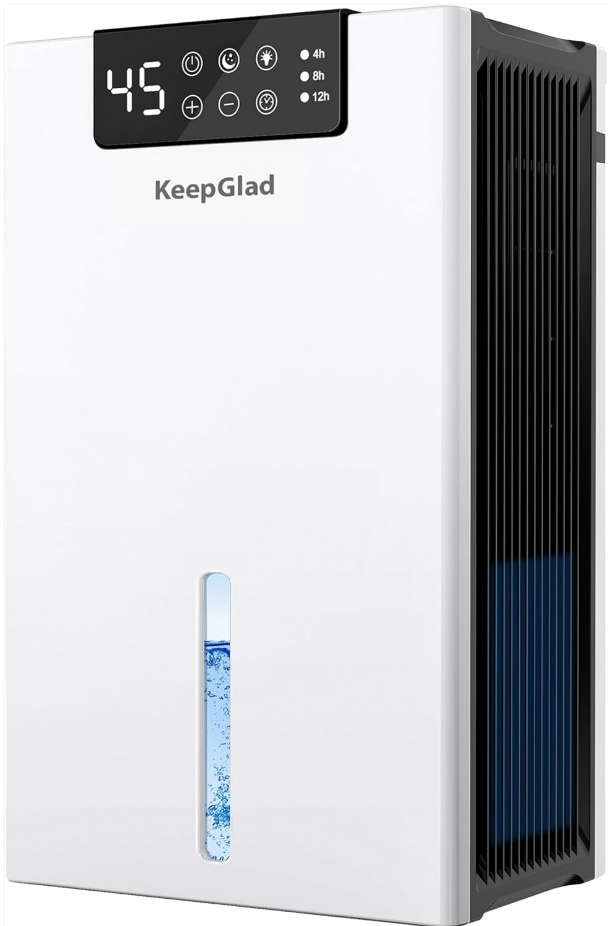
Figure 3.1: Front view of the KeepGlad RX02-B Dehumidifier, showing the digital display, control panel, and visible water level indicator.