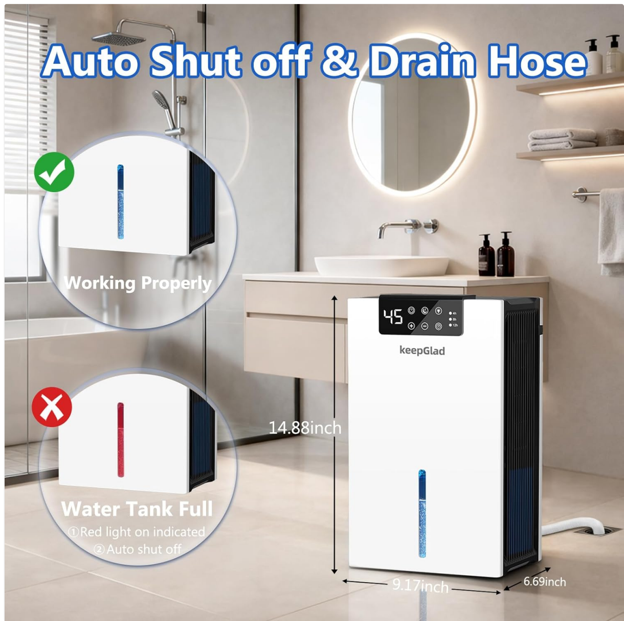
Figure 6.1: The unit features an auto shut-off function when the water tank is full, indicated by a red light.