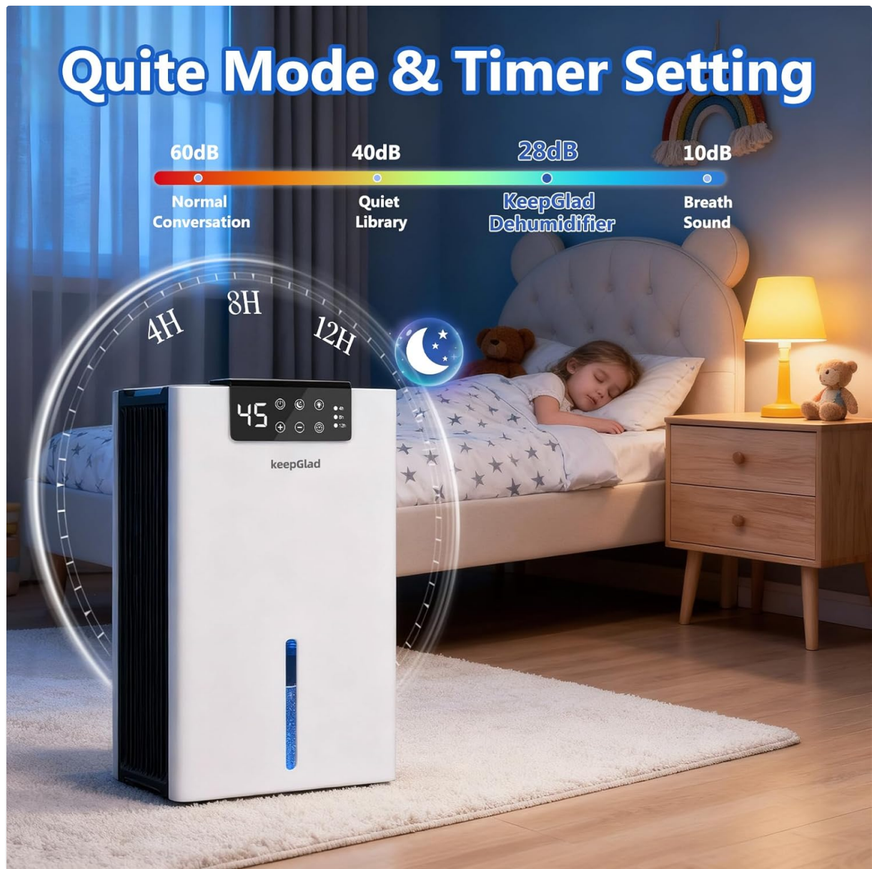
Figure 5.3: Quiet mode and timer settings ensure comfortable operation, especially during sleep.