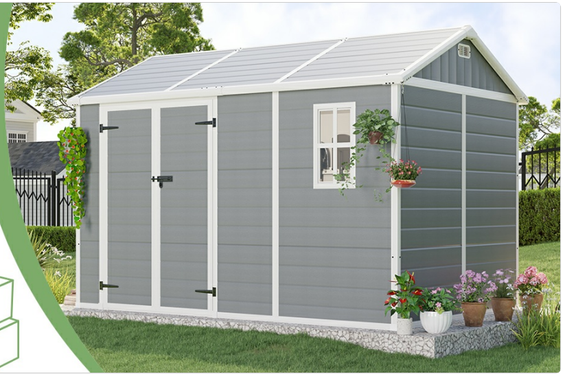
Image: The shed components are delivered in three separate packages. Please check all packages upon arrival.