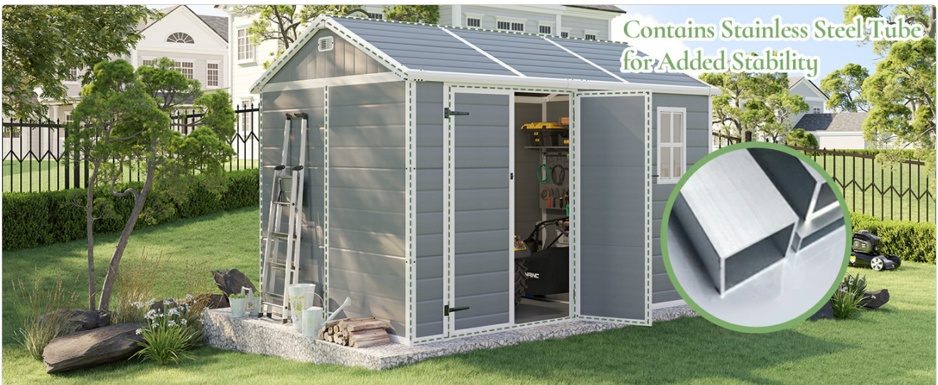
Image: Details of the shed's durable construction and security features.