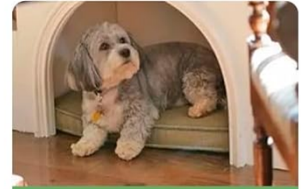
Cozy Pet House

Image: Interior view during assembly, showing the interlocking wall panels and roof frame.