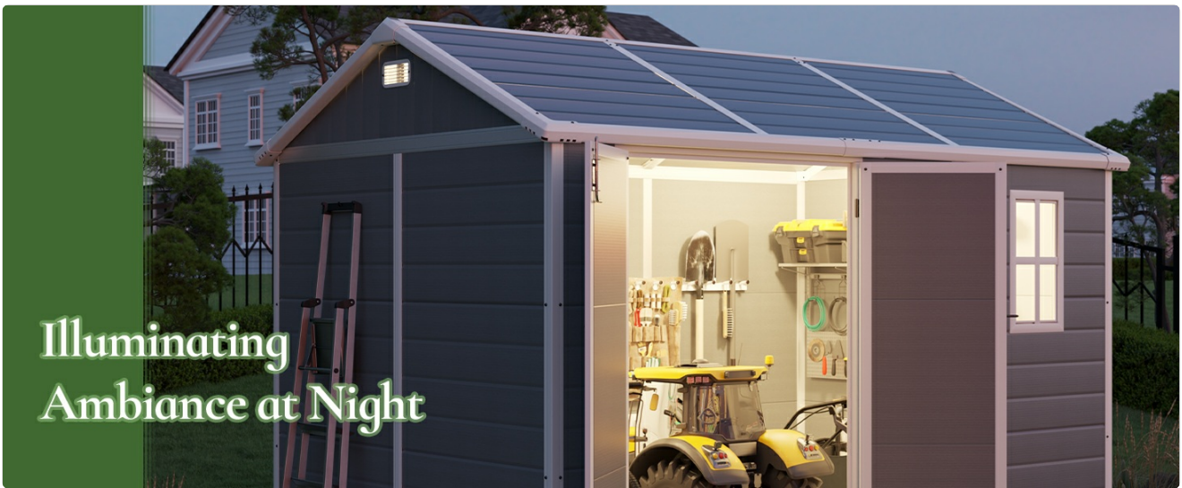
Image: Illustrates the spacious interior for various equipment and tools.