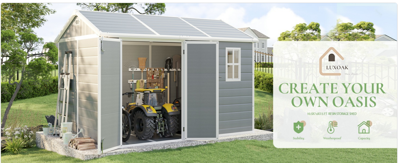
Image: Detailed product dimensions and capacities.