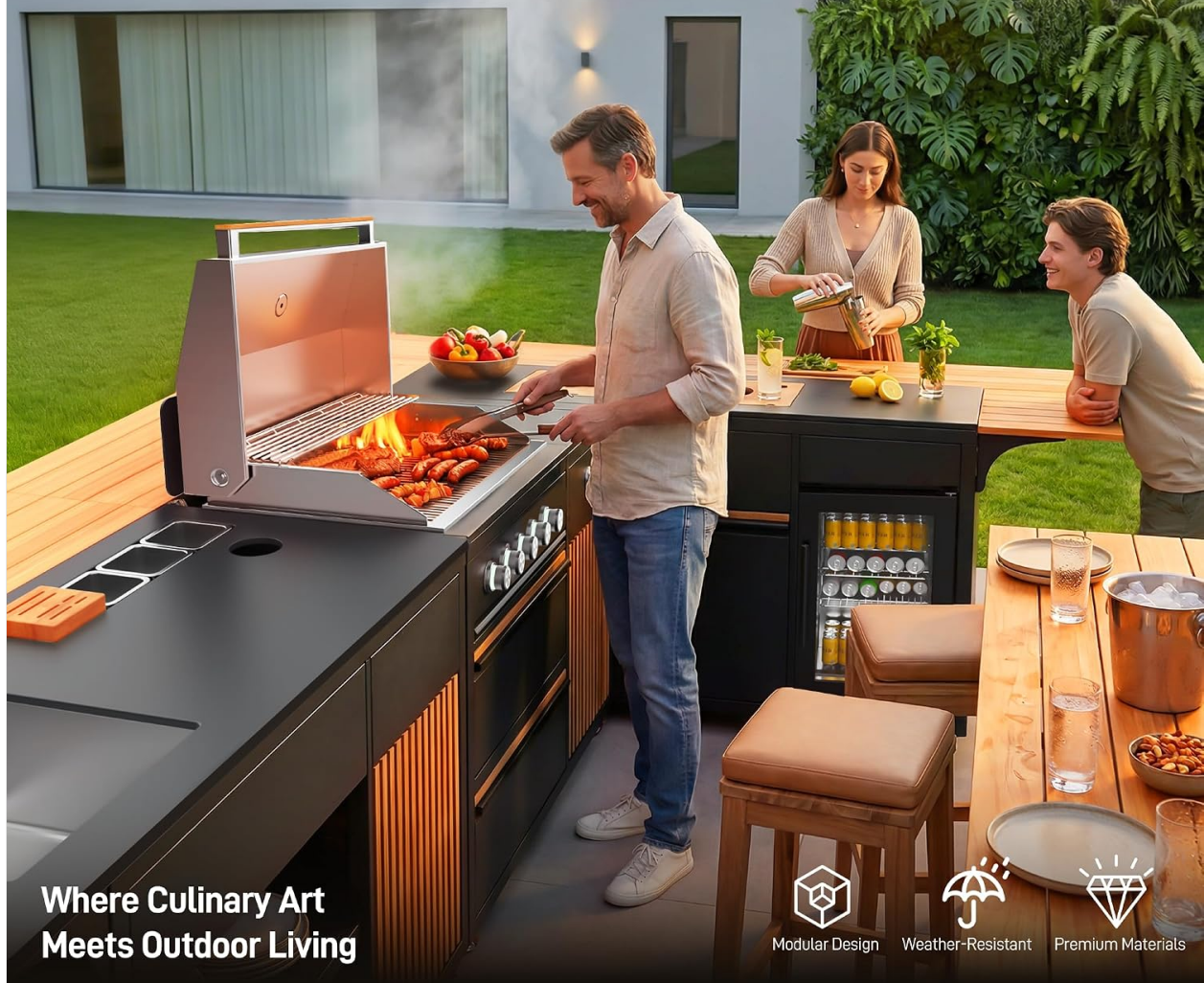
Figure 4.1: Modular layout and dimensions of the kitchen island.

Video 4.1: Demonstrates the unboxing and initial assembly of the modular outdoor kitchen.