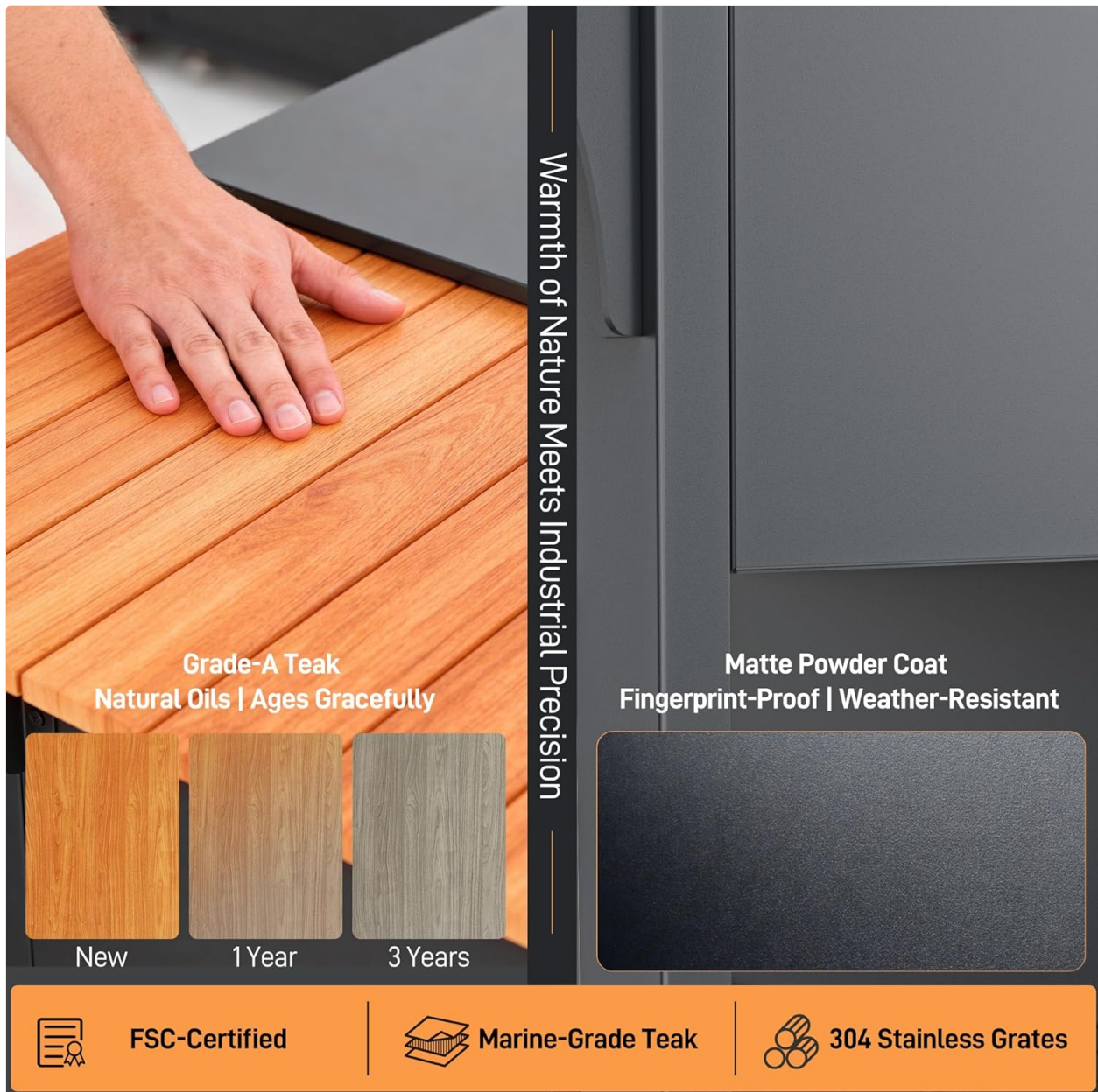
Figure 4.2: Detail of the teak wood and powder-coated stainless steel construction.

Secure the natural teak extension boards to the designated areas on the kitchen island modules. These boards provide additional workspace and serving areas.