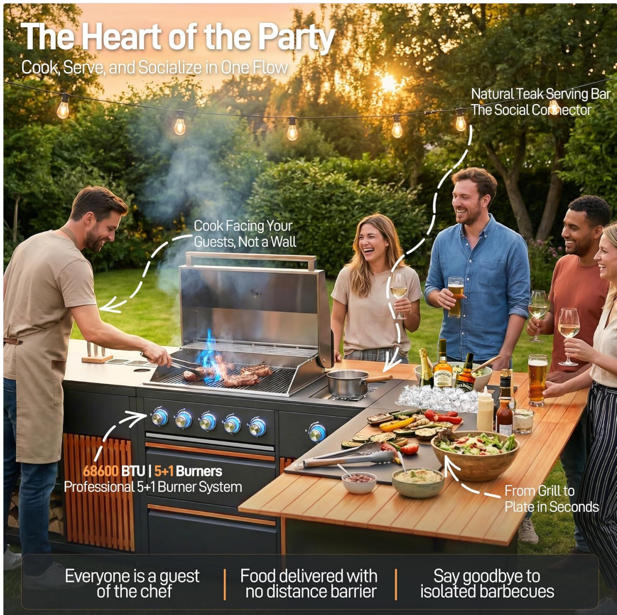
Figure 5.1: Grill module in use, demonstrating cooking capabilities.