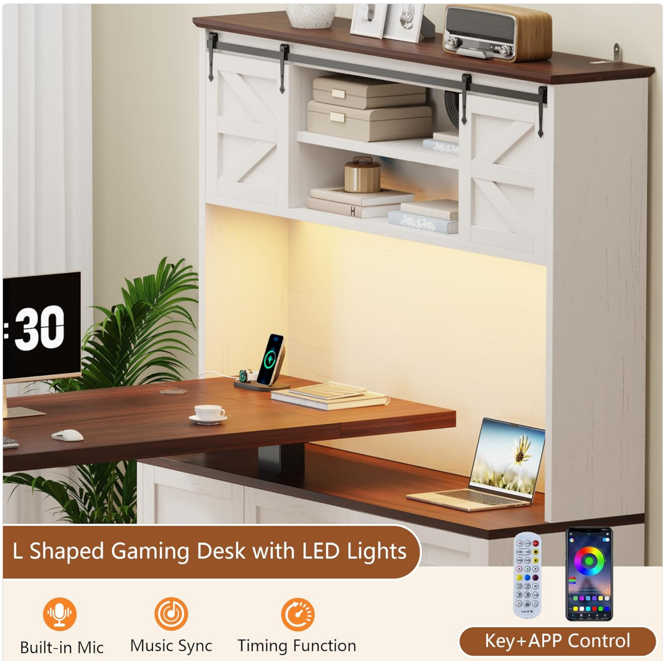
Figure 6: RGB LED Lighting. This image shows the desk with its LED lights illuminated, along with the remote control and smartphone app interface used to manage the lighting features, including built-in mic, music sync, and timing functions.