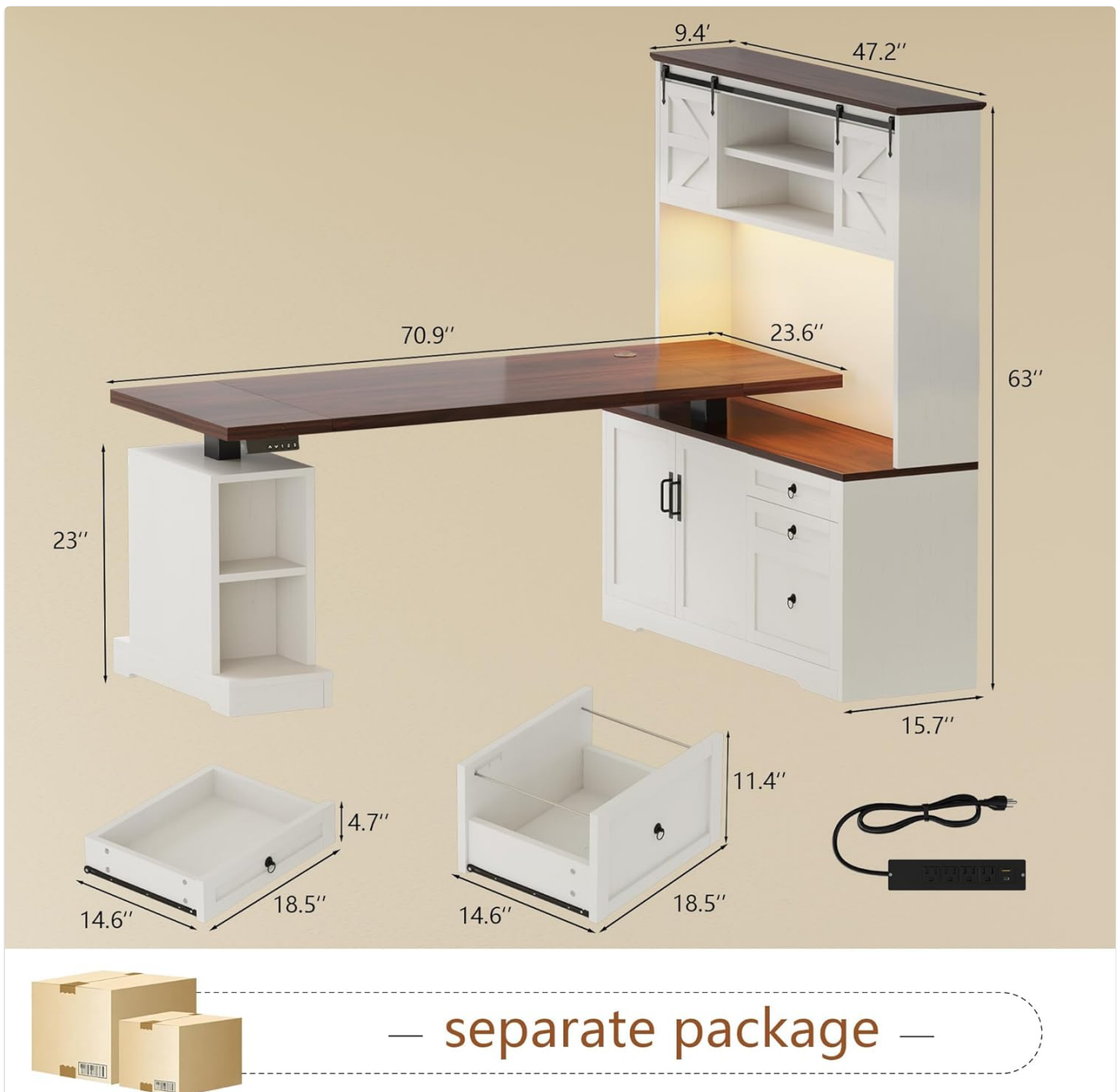
Figure 1: Desk Dimensions and Included Components. This image illustrates the overall dimensions of the L-shaped desk, including the main desktop (70.9" length), hutch (47.2" width, 63" height), and the adjustable desk section (23" height). It also shows the dimensions of the two types of drawers (14.6" x 18.5" with depths of 4.7" and 11.4") and a power strip. The bottom of the image indicates that the product ships in "separate packages".