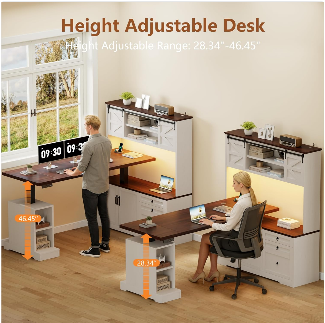
Figure 3: Height Adjustable Desk in Use. This image demonstrates the desk's height adjustment feature, showing a user standing at 46.45 inches and another sitting at 28.34 inches. The arrows indicate the adjustable range.

The desk features an electric height adjustment system, allowing you to switch between sitting and standing positions effortlessly and quietly.