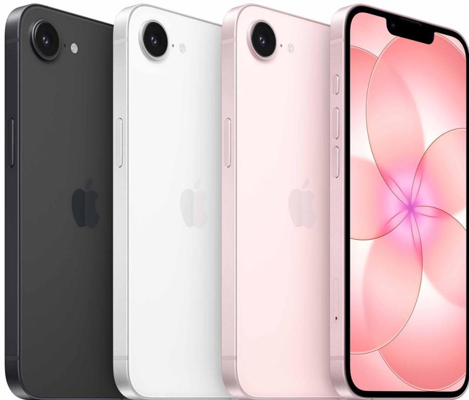
Image 1.2: The iPhone 17e is available in various colors, including Black, White, and Soft Pink.