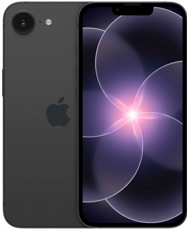
Image 1.1: The Apple iPhone 17e in Black, showcasing its sleek design.