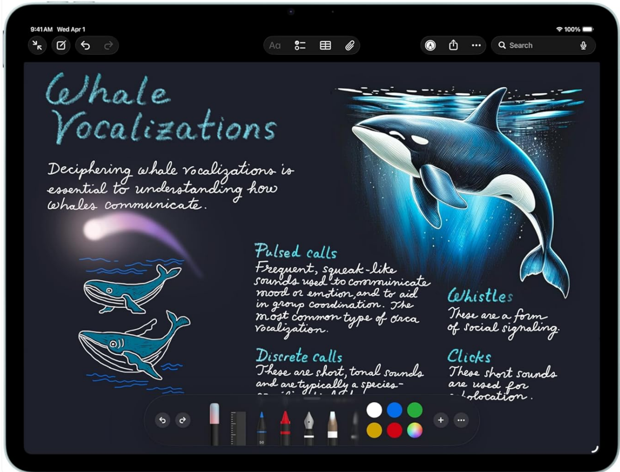
Image: The iPad Air screen showing a detailed note with drawings and text, illustrating how Apple Intelligence can assist with creative and organizational tasks.