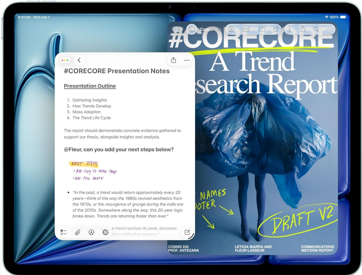
Image: The iPad Air screen demonstrating multitasking capabilities with two applications open side-by-side, powered by the M4 chip and iPadOS.