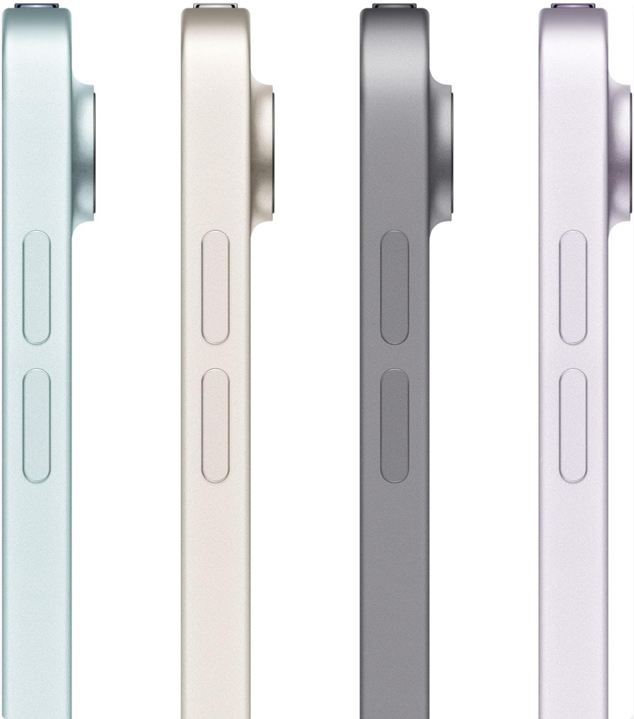
Image: A close-up side view of multiple iPad Air devices, showcasing the various color options and button placements.