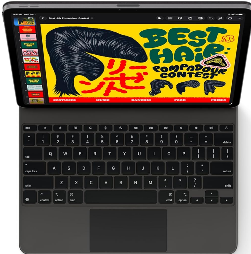
Image: The iPad Air connected to a Magic Keyboard, showcasing its use as a productivity tool with a full keyboard and trackpad.