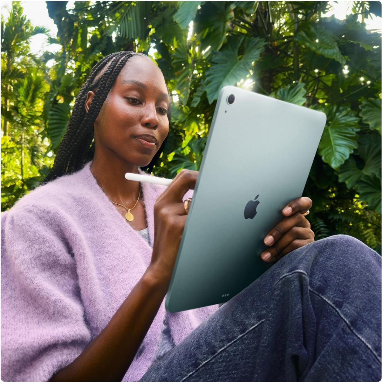
Image: A user interacting with the iPad Air using an Apple Pencil, highlighting its portability and creative capabilities.