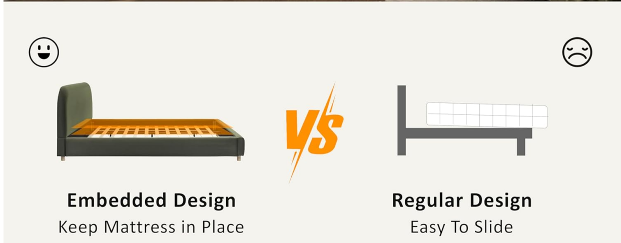
Image: Detail illustrating the 'Thought Embedded Design' of the bed frame, which helps prevent mattress movement, contrasted with a regular design that allows easy sliding.