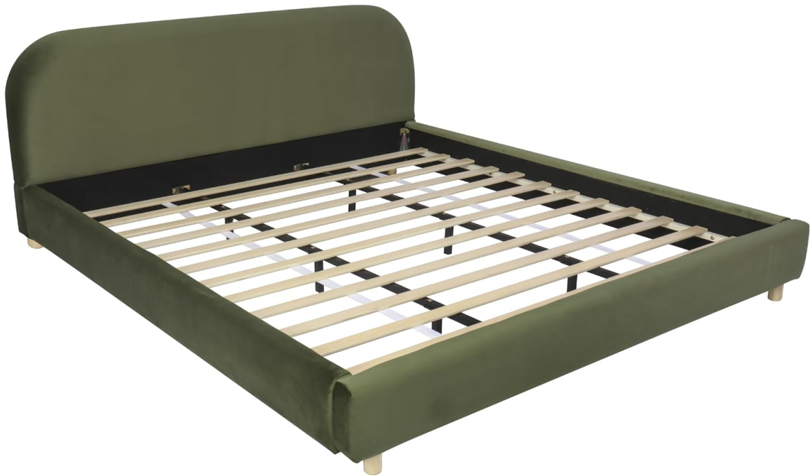
Image: Angled view of the Merax California King bed frame with all wooden slats properly installed, forming the mattress support surface.

Position the wooden slats evenly across the bed frame. Secure them using the provided fasteners or by following the specific instructions in your hardware pack. A power drill may expedite this step.