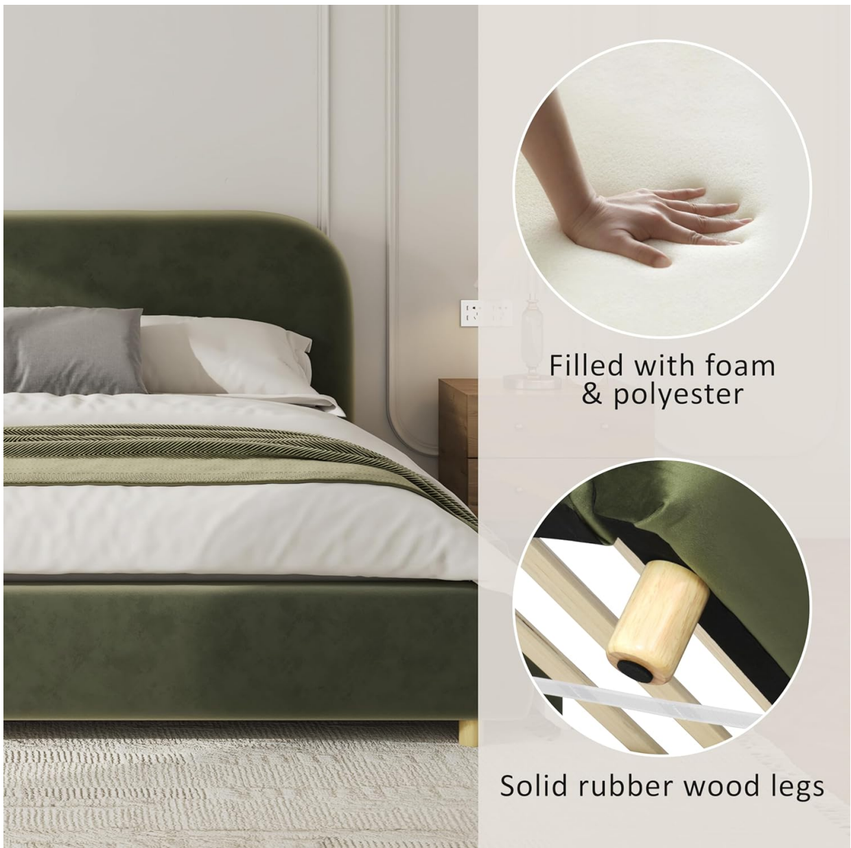
Image: Close-up view of the bed's upholstered headboard, emphasizing the soft velvet fabric, and a detail of the solid rubber wood legs, highlighting the materials used.