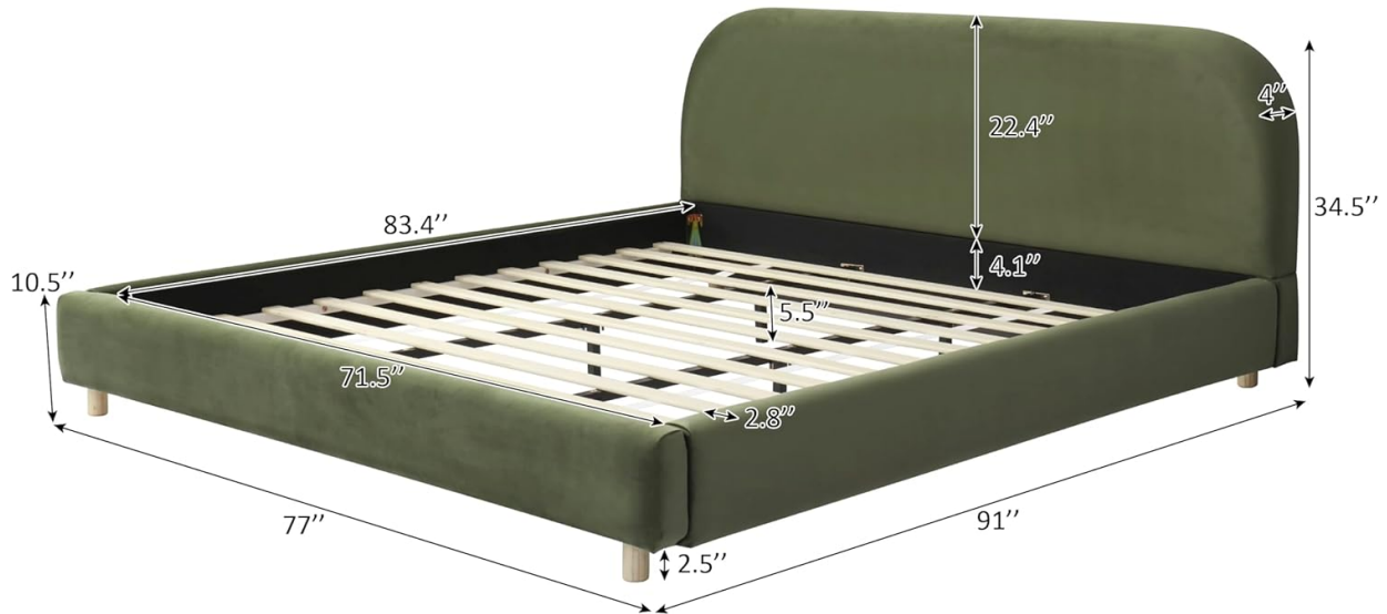
Image: Detailed dimensions of the Merax California King bed frame, indicating overall length, width, headboard height, and recommended mattress thickness and weight capacity.