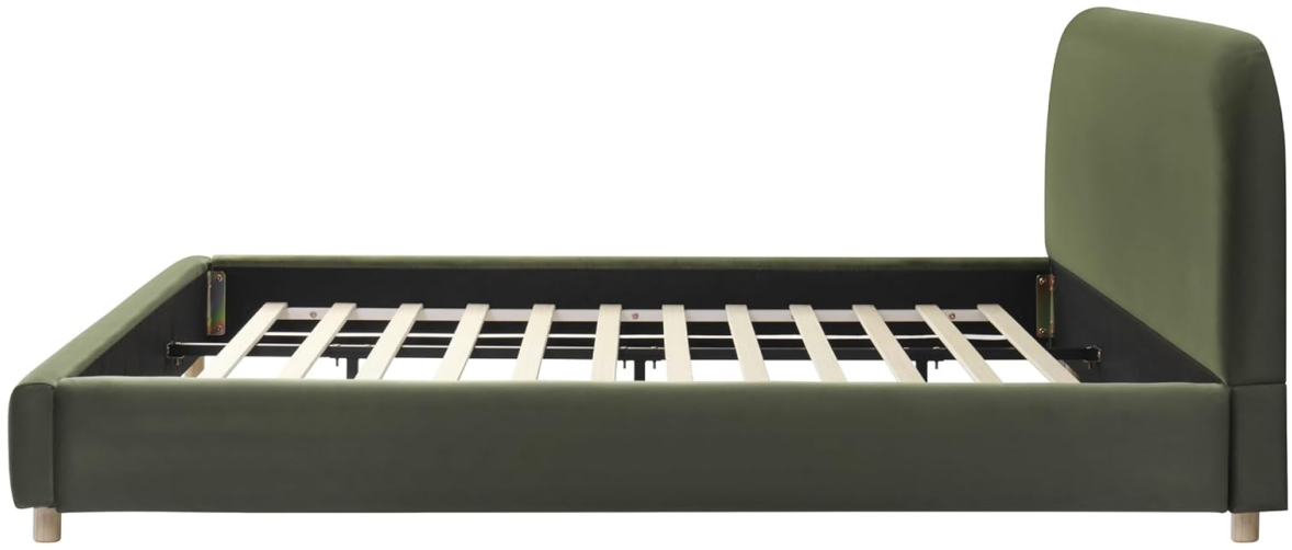
Image: Side view of the Merax California King bed frame, illustrating the connection points between the side rails, headboard, and footboard. The internal structure for slats is visible.