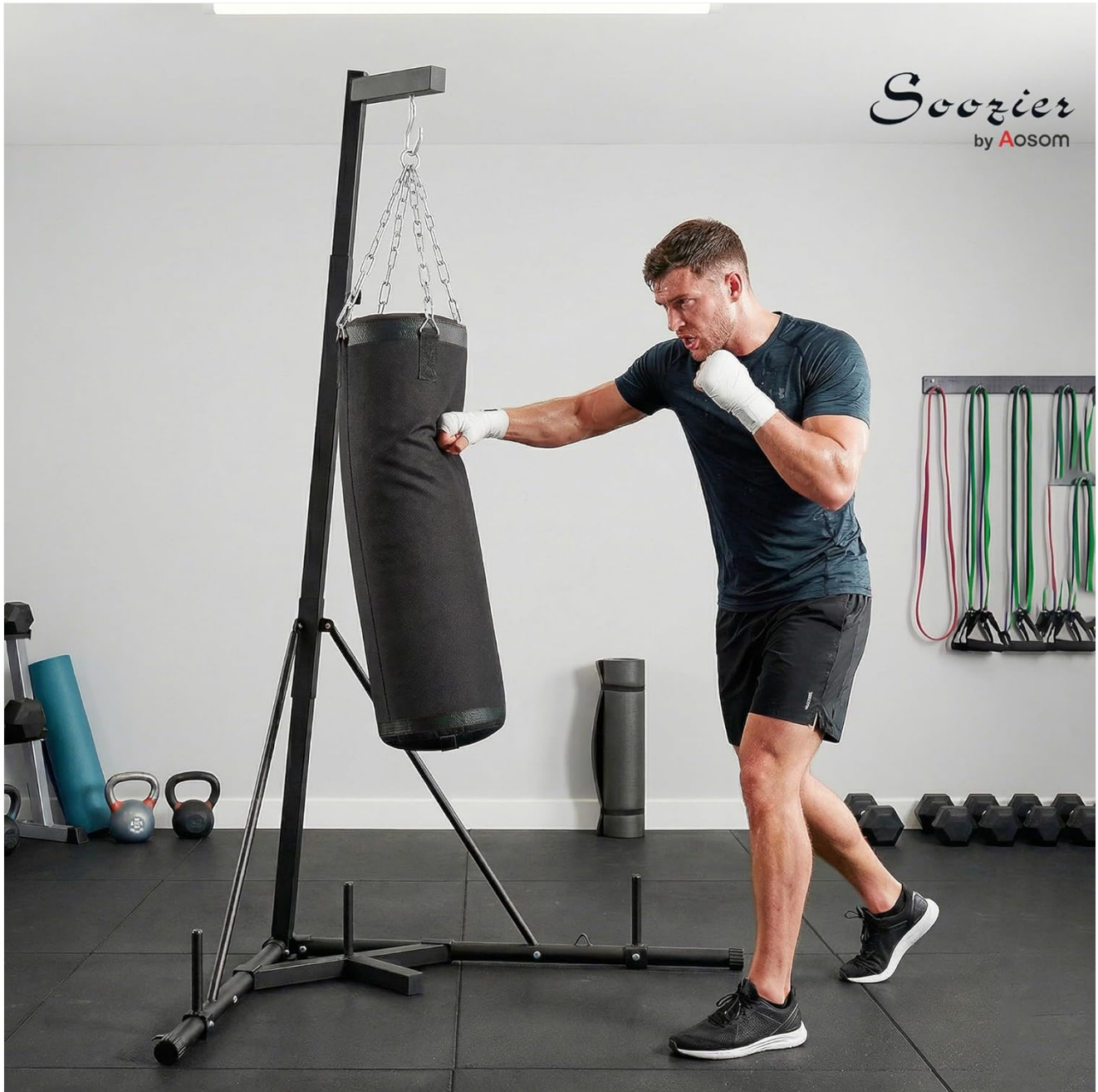
Image 2.1: A user engaging with the Soozier Punching Bag with Stand.