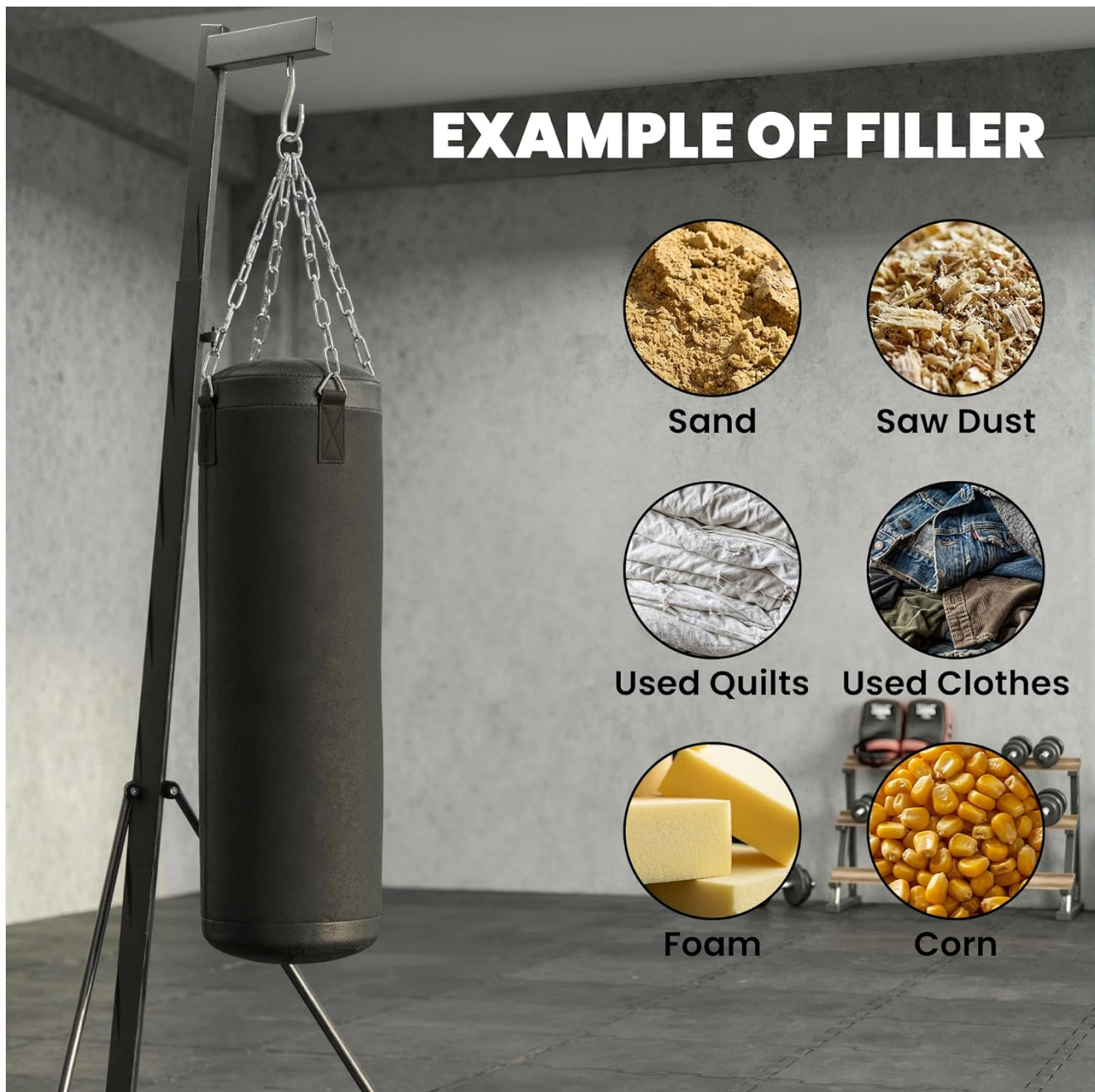
Image 4.1: Examples of suitable filler materials for the punching bag.