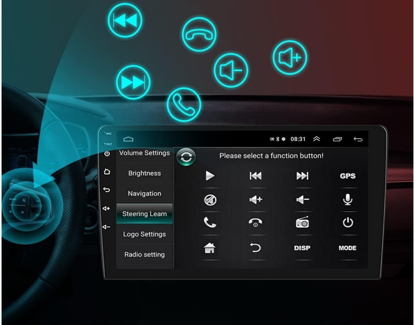
Figure 7: Steering Wheel Control learning interface, showing various button assignments for functions like volume, track skip, and call handling.

Quickly switch functions which you want with your car's steering wheel control