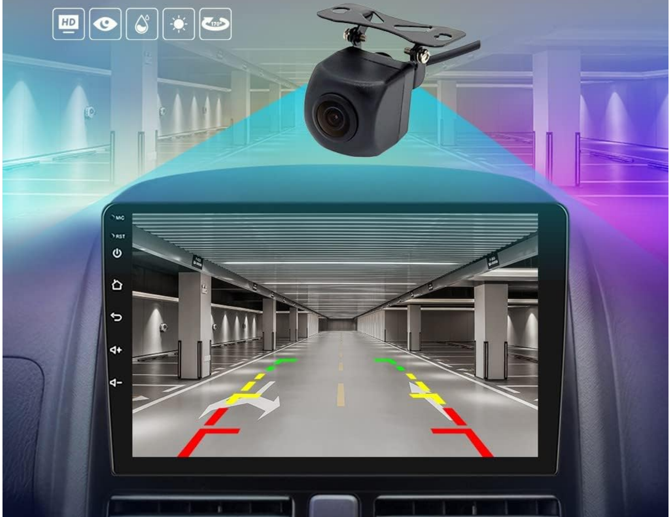
Figure 1: Illustration of car reverser camera installation and its display on the head unit screen, showing parking guidelines.