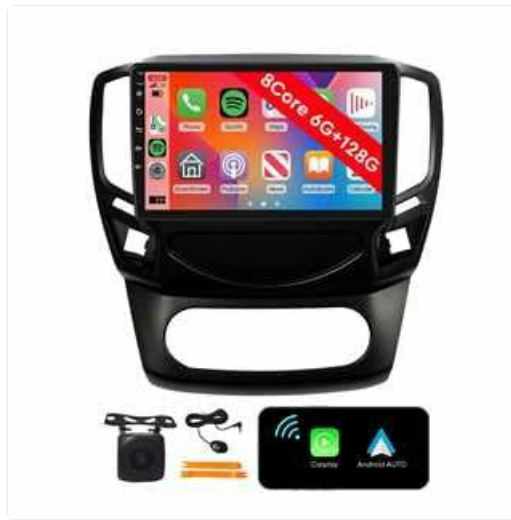
Figure 3: GPS Navigation screen showing a map, vehicle status, and common navigation app icons.