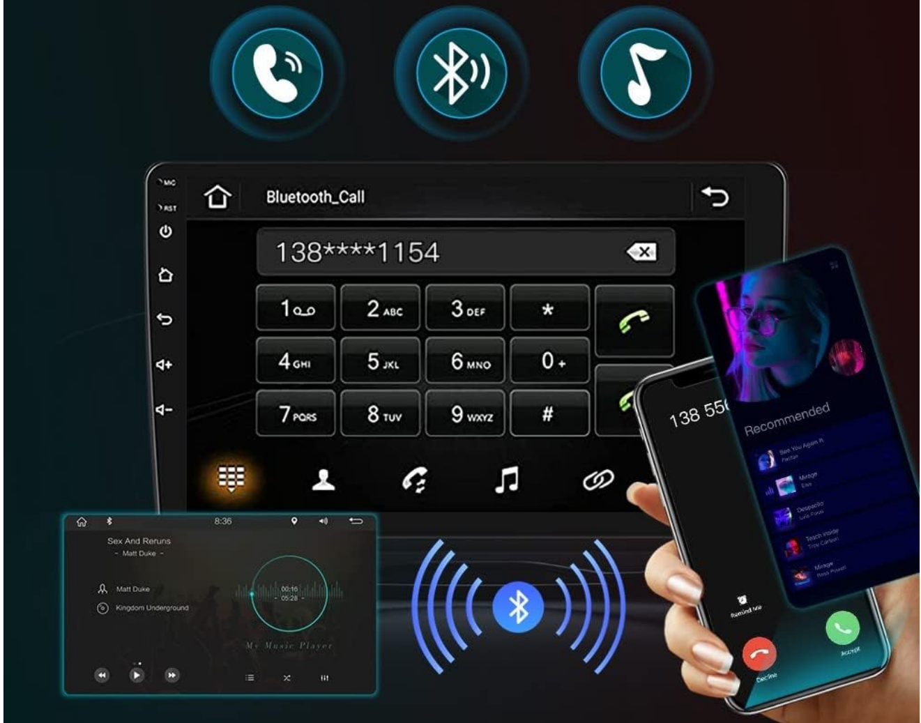
Figure 5: Bluetooth interface showing a dial pad for calls and music playback controls.

Built-in BT, Enjoy Wireless Streaming Music, Hands-free Calling & Navigation