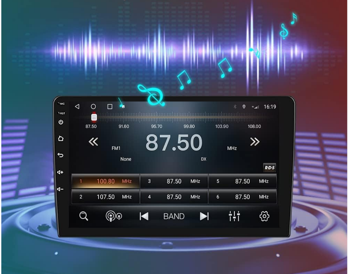
Figure 4: FM Radio interface displaying current frequency, station presets, and tuning controls.

You can transfer the music to the car stereo by FM, Long press to save your favorite radio station