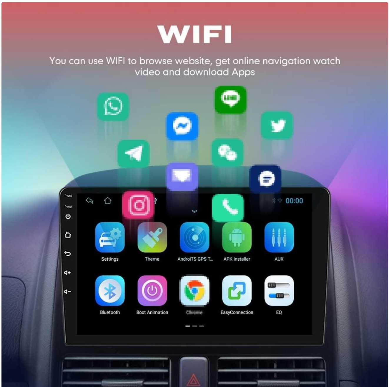
Figure 6: Car stereo home screen displaying various application icons, indicating Wi-Fi connectivity.