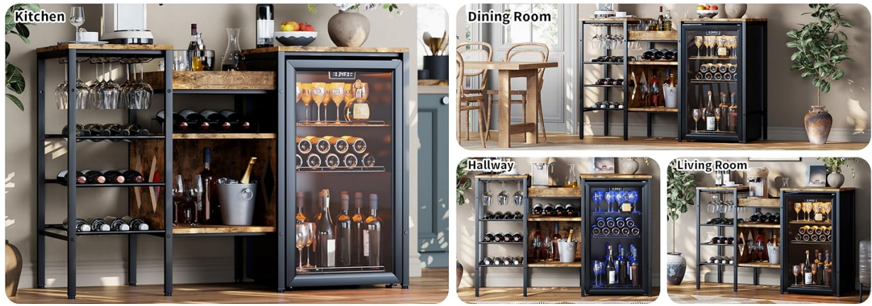
Image: The cabinet's adaptable design allows it to function effectively in diverse environments such as kitchens, dining rooms, hallways, and living rooms.