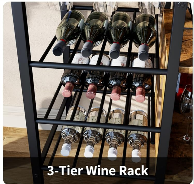
3-Tier Wine Rack