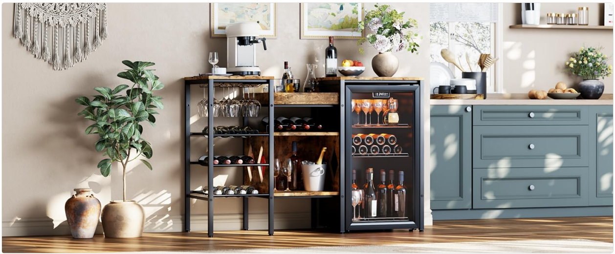
Image: The reversible frame design allows for flexible configuration of the cabinet's side shelves.