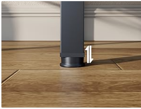
Image: Adjustable feet allow for leveling the cabinet on uneven floors, enhancing stability.