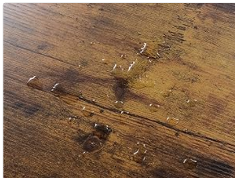
Image: The engineered wood surface exhibits water resistance, aiding in spill management.