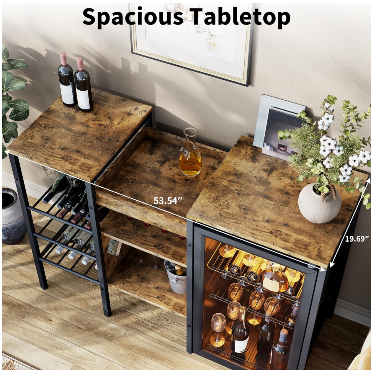
Image: The spacious tabletop provides ample surface area for various items and activities.

The generously sized 19.7" x 53.5" tabletop can accommodate various items. It is suitable for preparing drinks, displaying decorative pieces, or placing small appliances such as coffee makers or microwaves.