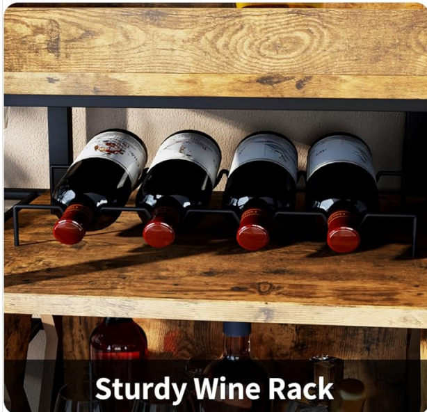
Sturdy Wine Rack