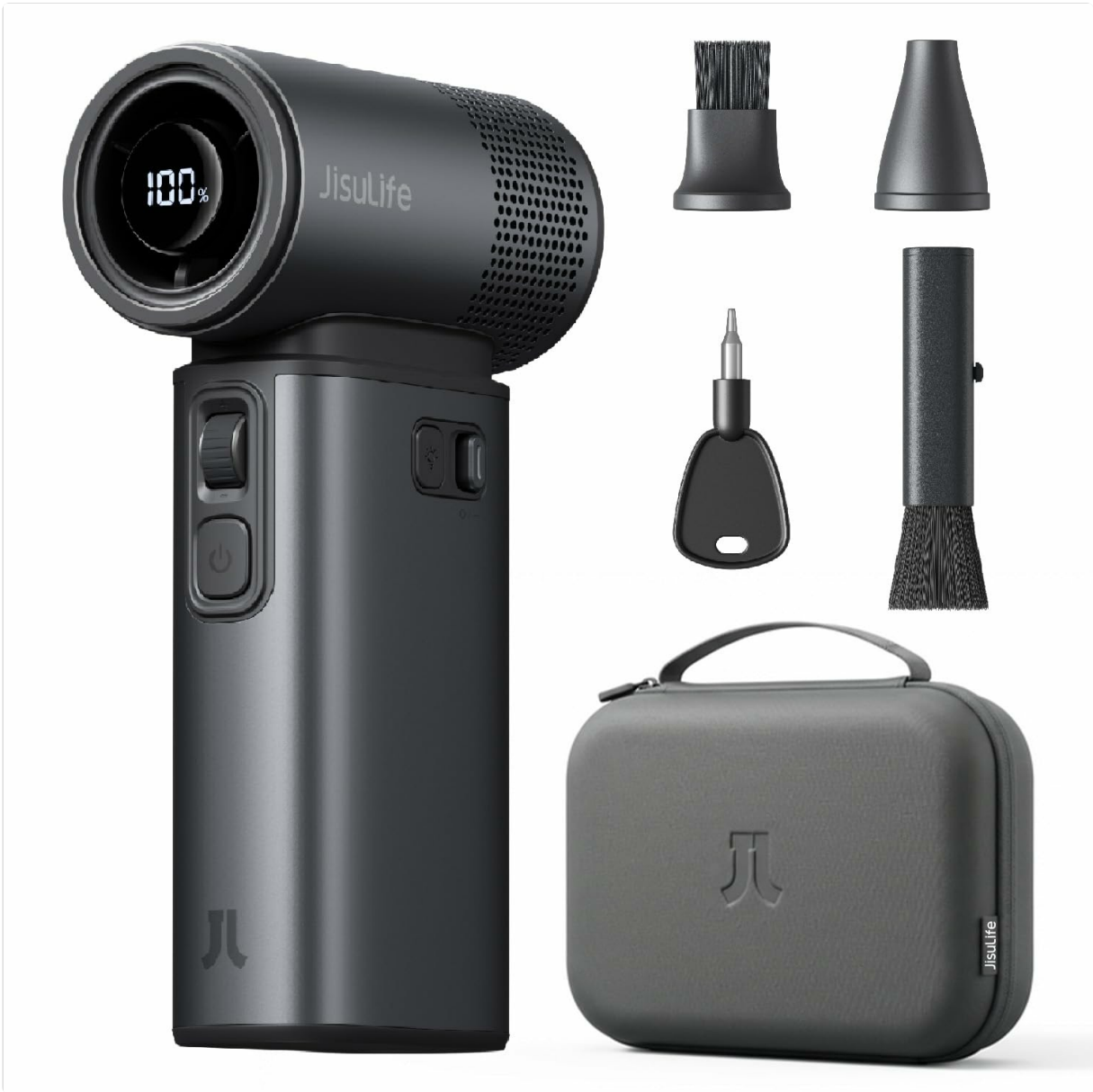
Figure 7.1: The JISULIFE Handheld Fan Ultra2 illustrating its removable and washable air inlet net, designed with a honeycomb structure to prevent hair entanglement. Also shown are the digital LED display, safety lock, and flashlight button.