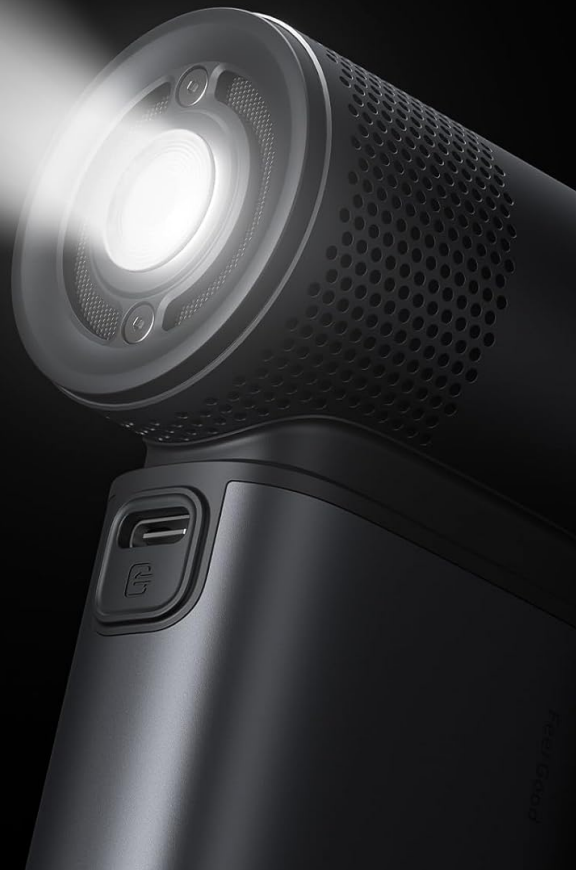
Figure 6.3: Detailed view of the JISULIFE Handheld Fan Ultra2's flashlight, showing its three brightness levels (Level 1: 8502K, 35LUX; Level 2: 8634K, 67LUX; Level 3: 10195K, 82LUX) at 100cm distance.