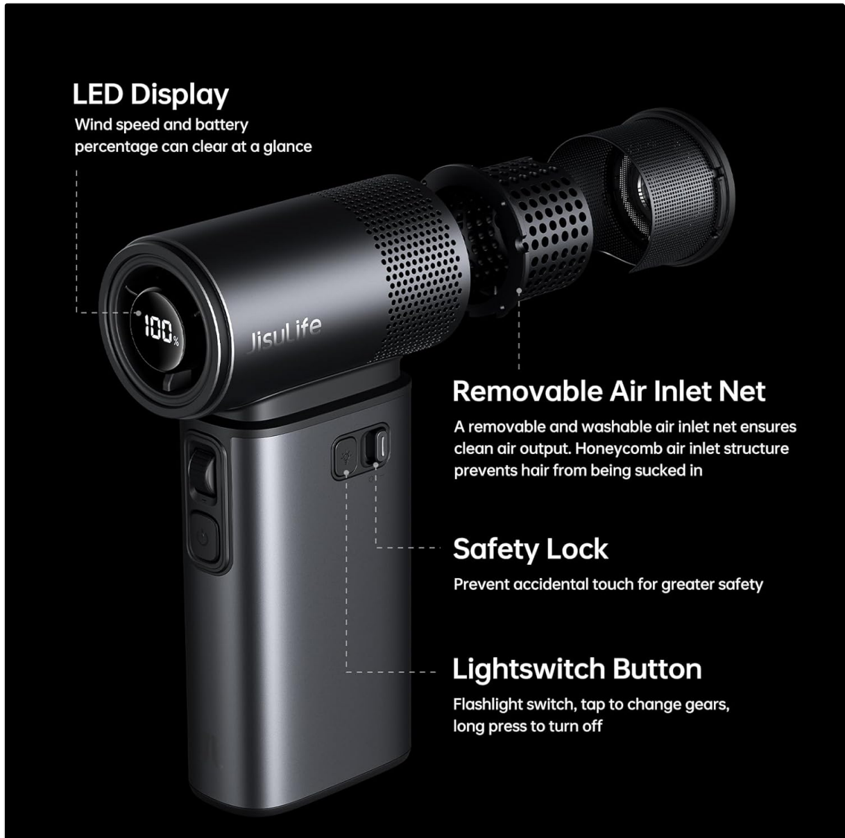
Figure 6.2: The JISULIFE Handheld Fan Ultra2 highlighting its substantial 9000mAh battery, capable of providing up to 25 hours of runtime and serving as a reliable power bank for other devices.