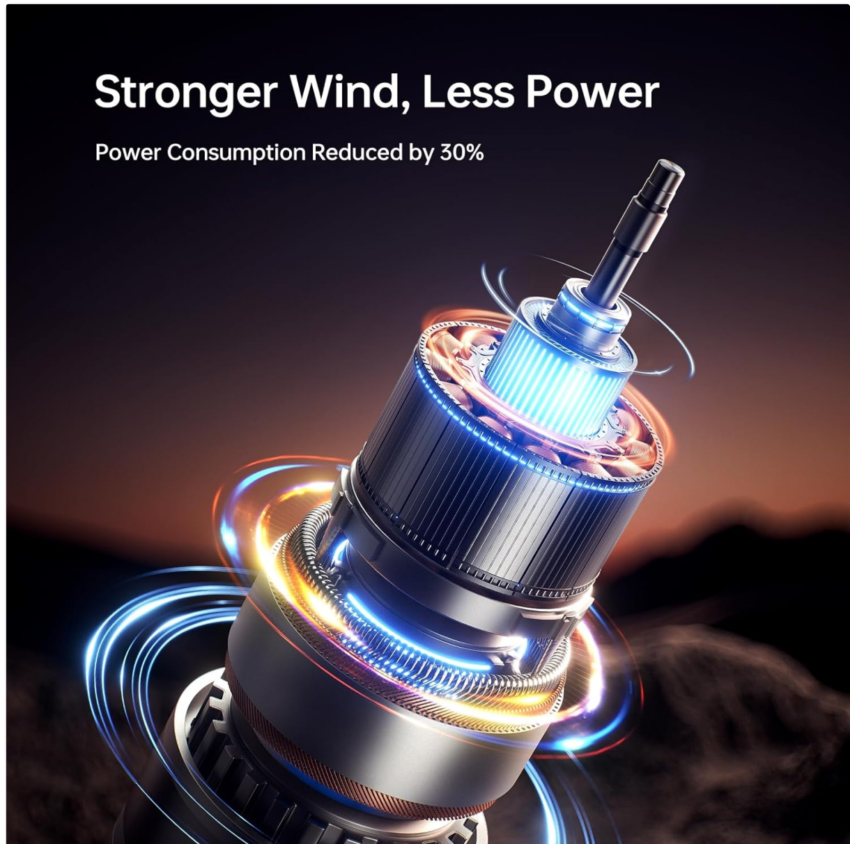
Figure 4.2: An internal view of the JISULIFE Handheld Fan Ultra2, highlighting its high-speed motor and large 9000mAh battery. This illustrates the robust engineering behind its powerful performance and extended runtime.