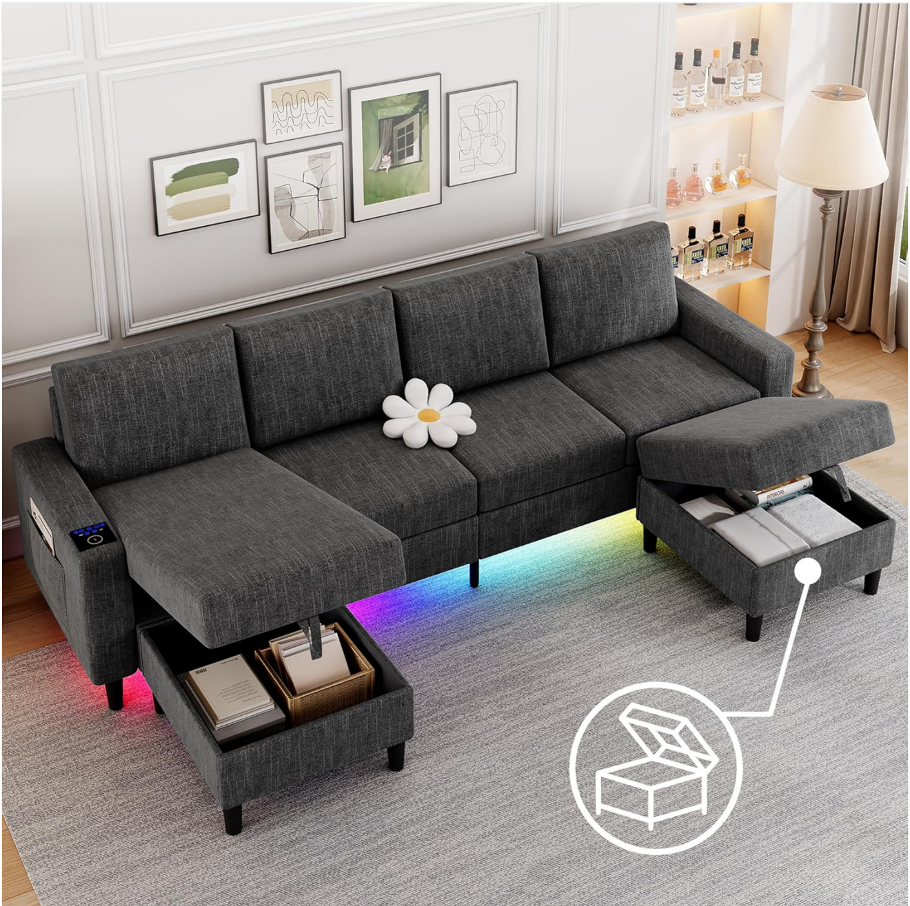
Image: An overhead view of the sectional couch, highlighting the open storage compartments within the two movable ottomans, filled with items like blankets and books.

The couch includes two movable storage ottomans and two side pockets for organization.