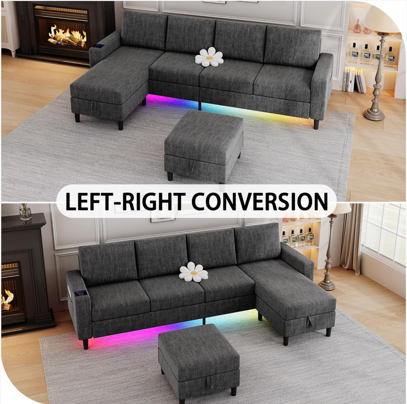
Image: Depicts the sectional couch configured with the chaise on the left and then on the right, demonstrating its reversible design.

The chaise lounge can be configured on either the left or right side of the main sofa section to suit your room layout.